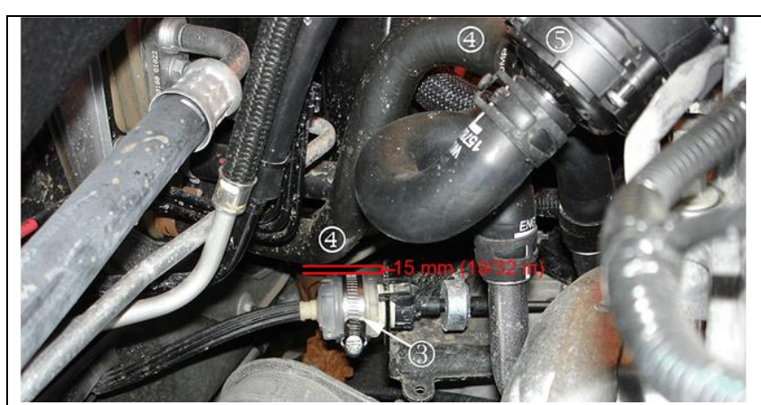
Hybrid vehicle shown. Combustion engine vehicle is similar.

Without the reinforcement kit, the transmission shift cable could fracture without warning. If this occurs, the transmission may not be in the PARK position and may not match the gear position indicated by the shift lever. The driver would be able to remove the key from the ignition, but the door locks may not unlock automatically and the PARK indicator lamp would not be illuminated. The driver may not be able to restart the vehicle and the vehicle could roll away after the driver has exited the vehicle, resulting in a possible crash.