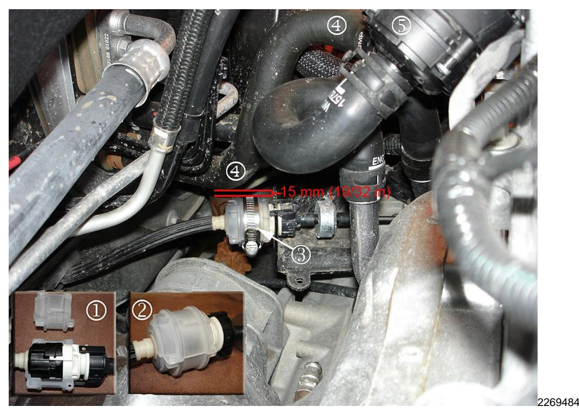
Hybrid vehicle shown. Combustion engine vehicle is similar.