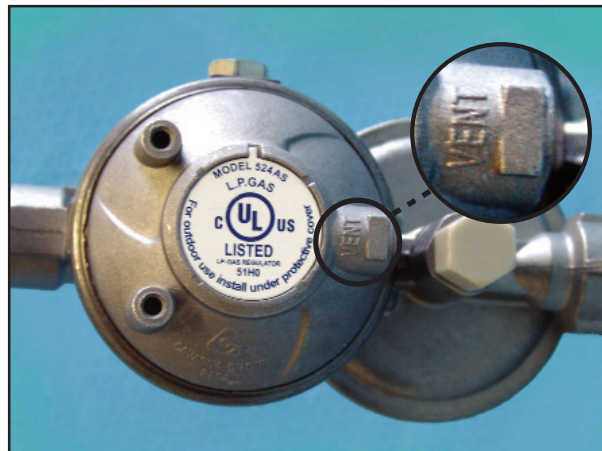
Figure 2 If the regulator's vents face horizontally in the installed position, the regulator is incorrect and must be replaced.