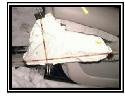
Figure 5. 2000 Mercedes-Benz S500 side impact air bag.

The Mercedes-Benz was also equipped with door-mounted side impact air bags for the outboard seating positions. The left side air bags deployed as a result of the crash. The air bags were housed in the door panel above the armrest with a horizontally oriented flap tear seam (H-configuration). The leather flaps were rectangular/symmetrical in shape and measured 35.0 cm (13.8 in) in width and 6.0 cm (2.4 in) in height. Although no contact evidence was identified on the exterior surface of the module cover flaps, blood spattering was found on the upper section of the air bag. The NASS researcher measured the left side impact air bag at 55.0 cm (21.7 in)