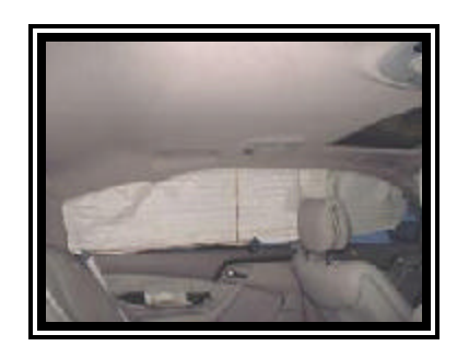
Figure 6. Interior view of the 2000 Mercedes-Benz side impact curtain.

The Mercedes-Benz was also equipped with side curtains for the outboard seating positions ( Figures 6 & 7 ). The left side curtain deployed as a result of the crash. The side curtain was housed between the interior roof headliner and structural roof side rail with a horizontal seam measuring 155.0 cm (61.0 in) in length ( separation of headliner versus an actual flap ). Hair strands were documented on the curtain just forward of the B-pillar area. The NASS researcher measured the left curtain at 165.0 cm (65.0 in) in width and 30.0 cm (11.8 in) in height in its deflated state. The curtain was tethered by an external strap connected to the left A-pillar.