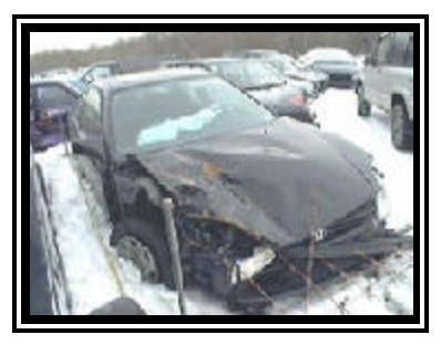
Figure 4. Frontal damage to the 1997 Honda Civic EX.

The 1997 Honda Civic EX sustained moderate frontal damage as a result of the impact with the Mercedes-Benz ( Figure 4 ). The direct contact damage began at the front right bumper corner and extended 50.0 cm (19.7 in) inboard. The impact deformed the full frontal width resulting in a combined direct and induced damage length (Field L) of 103.0 cm (40.6 in). The bumper fascia separated from the reinforcement bar with an indentation noted from the left front wheel of the Mercedes-Benz. Direct contact damage was also noted along the right side surface of the vehicle from sustained contact prior to spinout. The right front wheel was deflated (not restricted). Reduction in the right side wheelbase measured 14.0 cm (5.5 in).