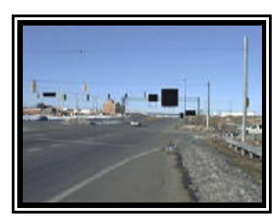
Figure 2. Northbound approach for the 1997 Honda Civic EX.