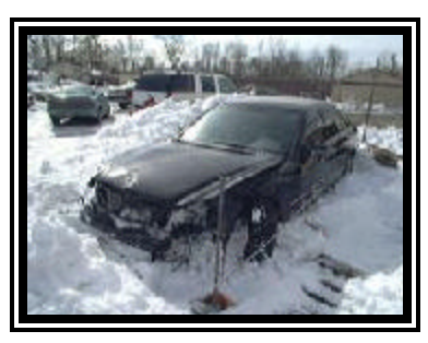
Figure 3. Left side damage to the 2000 Mercedes-Benz S500.

The Mercedes-Benz sustained moderate left side damage as a result of the impact with the Honda Civic ( Figure 3 ). The direct damage began at the front left bumper corner and extended 63.0 cm (24.8 in) rearward. The combined direct and induced damage length (Field L) began at the front left bumper corner and extended 138.0 cm (54.3 in) rearward. Six crush measurements were documented at the level of the mid-door: C1= 0 cm, C2= 3.0 cm (1.2 in), C3= 8.0 cm (3.1 in), C4= 20.0 cm (7.9 in), C5= 31.0 cm (12.2 in), C6= 46.0 cm (18.1 in). The left front wheel was restricted (not deflated). Minor hood displacement was noted along with lateral bumper shift to the right. The windshield was undamaged.