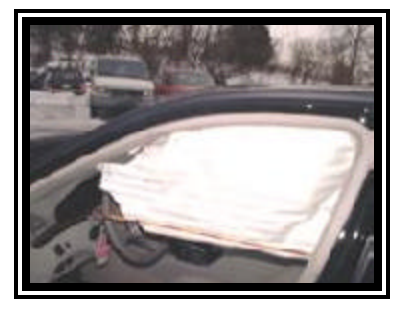
Figure 7. Secondary view of the Mercedes-Benz side impact curtain.