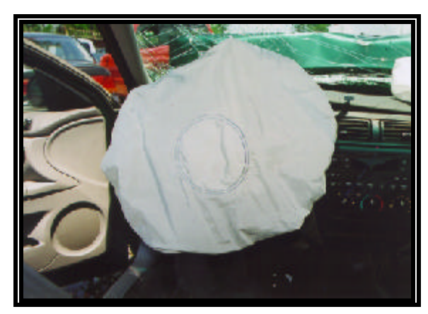
Figure 8: Driver air bag.

The front right passenger air bag, Figure 9 , was a top-mount design housed in the right aspect of the instrument panel. The module cover flap was vinyl and measured 27.9 cm x 14.0 cm (11.0 in x 5.5 in), width by depth. The face of the passenger air bag measured 55.9 cm x 30.5 cm (22.0 in x 12.0 in). The bag extended rearward from the module 40.6 cm (16 in) in its deflated state. The bag was vented by two ports measuring 4.6 cm (1.8 in) in diameter. The ports were symmetrically located on the side panels of the bag. The only contact evidence on the face of the bag consisted of a 20 cm x 30 cm (8 in x 12 in) area of patterned vinyl transfers. This transfers were the result of contact with the aft edge of the air bag module during the deployment sequence.