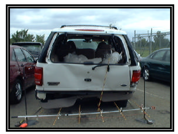
Figure 10: Rear view of the Ford Expedition.

The Collision Deformation Classification was 06-BDEW-03. The total delta V of the Expedition calculated by the Damage Only Algorithm of the WINSMASH model was 24.9 km/h (15.5 mph). The longitudinal and lateral components were -24.8 km/h (-15.4 mph) and 2.2 km/h (1.3 mph), respectively. The calculated Barrier Equivalent Speed was 35.5 km/h (22.1 mph). These results appeared reasonable based on SCI experience.