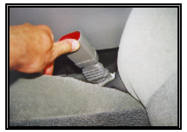
Figure 7: View of the left inboard buckle anchor.

The restraint's upper anchorages (D-rings) were adjustable. The left front D-ring was adjusted to the full up position. Inspection of the surface of the D-ring identified an abrasion across the full width of its friction surface. Upon inspection, the driver's restraint webbing was stowed in the retractor and operational. After extending webbing and buckling the latch plate, evidence of use in the crash was identified near the latch plate. The webbing appeared stressed and was "waffled". This belt evidence measured 5 cm (2 in) in length and began 80.8 cm (31.8 in) above the outboard anchor. Additional belt evidence was identified 13 cm (5 in) above the outboard anchor. This belt evidence consisted of a 1 cm (0.5 in) abrasion from contact with the aft aspect of the vinyl trim structure surrounding the seat cushion. A corresponding abrasion was identified on the vinyl trim.