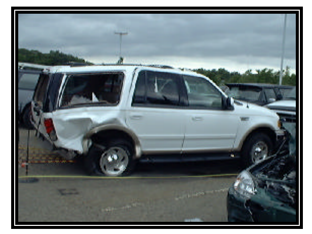
Figure 11: Right side view of the Expedition.