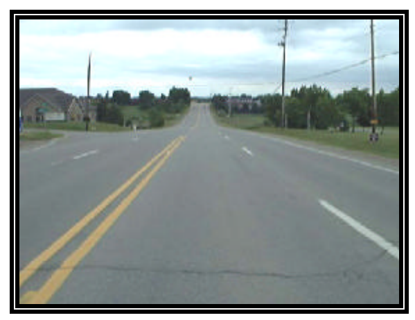
Figure 1: Northbound pre-crash trajectory view.