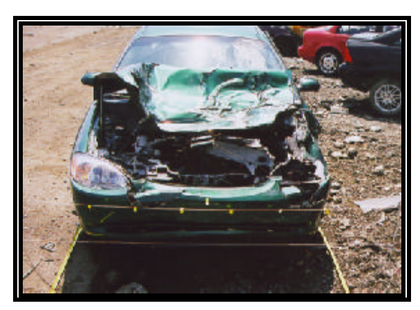
Figure 5: Front view of the Taurus.

The direct contact damage due to the under-ride extended rearward onto the hood and left front fender. The damage was comprised of longitudinal scraping and scratches caused by the rear bumper and undercarriage of the Expedition. The damage on the surface on the hood extended rearward 122 cm (48 in) from the front of the Taurus. The hood was buckled and had shifted rearward fracturing the lower aspect of the windshield. The exterior surface of the windshield was fractured directly in front of the driver's position by contact from the Expedition's rear bumper. (Note, this windshield fracture was inaccurately attributed to an interior occupant contact in the NASS file). The left fender was buckled and crushed down during the under-ride. The left front door had shifted rearward, overlapping the left rear door at the B-pillar. All the doors remained operational. The left wheelbase was foreshortened approximately 2.5 cm (1.0 in). The Collision Deformation Classification (CDC) was 12-FDEW-01. The