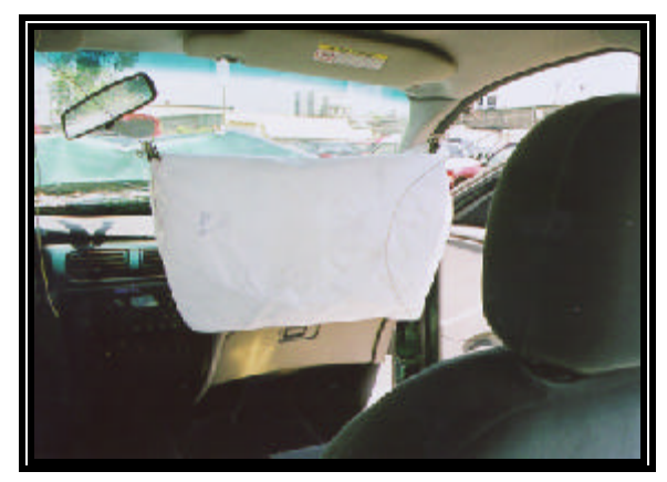
Figure 9: Front right passenger air bag.