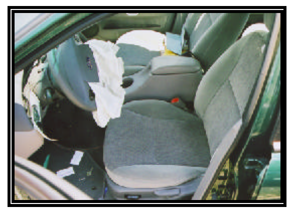
Figure 6: Left interior view of the Taurus.

Figure 6 is a left interior view of the front occupant compartment. The electrically adjustable driver's seat was adjusted to a full rear position at inspection. This was the at-crash adjustment of the seat as the seat track could not have been altered due to damage to the vehicle's electrical system. The horizontal distance between the center hub of the steering wheel and seat back measured 66 cm (26 in). The seat back was reclined 17 degrees aft of vertical. The foot controls were not adjustable.