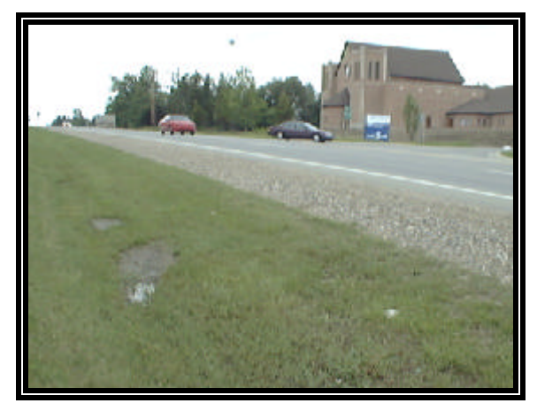
Figure 2 : Look back from the area of final rest toward the intersection.