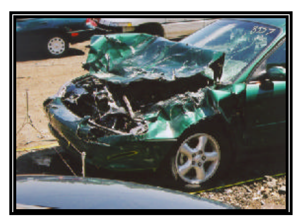
Figure 4: Left front view of the Taurus.

Figures 4 and 5 are the left front and front views of the Taurus, respectively. The front plane sustained direct and induced damage that extended across the entire 157 cm (62 in) end width of the vehicle. The damage was biased to the vehicle's left side as a result of the pre-crash right steering maneuver. The direct contact damage began 47.0 cm (18.5 in) right of center and extended 119.0 cm (44.5 in) to the left front bumper corner. The crush profile measured on the bumper reinforcement bar was as follows: C1=5 cm (2 in), C2=10 cm (3.9 in), C3=12 cm (4.7 in), C4=13 cm (5.1 in), C5=10 cm (3.9 in), C6=0. The bumper reinforcement had rotated clockwise during the under-ride (when viewed from the left end) and indicated the direct bumper to bumper contact at impact was minimal.