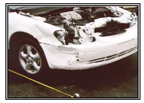
Figure 4: Close-up view of the right front damage.