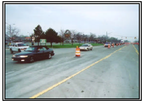
Figure 1: Southward trajectory view near the point of impact.

of the crash and the weather was clear. The road surface was dry. At the crash scene, the primary roadway was a five lane north/south road. The road was configured with two travel lanes in either direction and with a common center turn lane. A two-lane east/west private driveway intersected from the east forming a three-leg intersection. The driveway served as the entrance/exit into a parking area for a shopping plaza. The intersection was controlled by a stop sign for traffic exiting the parking lot. The speed limit in the area of the crash was 72 km/h (45 mph). Figure 1 is a southbound trajectory view. Note, the construction zone was not present at the time of the crash.