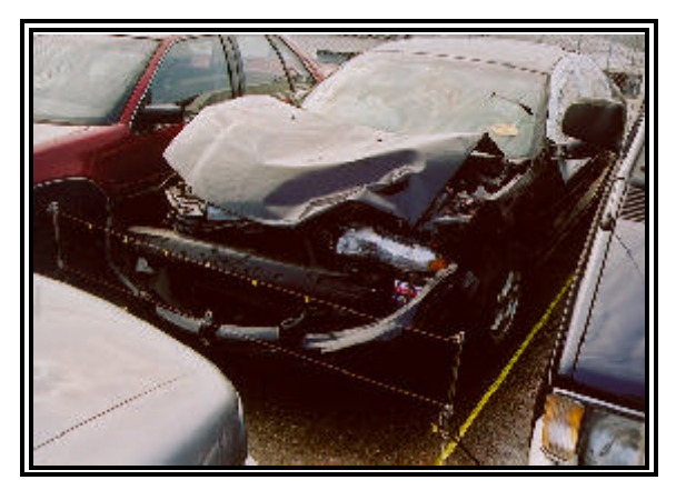
Figure 5: Frontal view of the Dodge.

front bumper corner. The combined direct and induced damage extended across the vehicle's entire 147 cm (58 in) frontal end width. The crush profile measured along the bumper reinforcement bar was as follows: C1=35.9 cm (14.1 in), C2=29.2 cm (11.5 in), C3=24.1 cm (9.5 in), C4=19.9 cm (7.9 in), C5=14.0 cm (5.5 in), C6=9.3 cm (3.7 in). The hood buckled rearward and contacted the windshield, fracturing the left lower aspect of the laminate. There was no measurable change in the wheelbase dimensions. The total delta V calculated by the WINSMASH model calculated a damage based delta V of 33.5 km/h (20.8 mph). The Collision Deformation Classification was 11-FLEW-2.