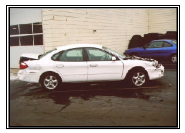
Figure 3: Right side view of the Taurus.

The vehicle was in a state of repair at the time of the SCI investigation. Reportedly, the frame had been partially straightened. Figures 3 and 4 are right side and right front close-up views of the damaged vehicle. The forward aspect of the Taurus's right side sustained 54.6 cm (21.5 in) of direct contact damage, as a result of the initial impact. The direct contact began 30.5 cm (12.0 in) forward of the right front axle and extended forward to the right corner of the front bumper. This direct damage pattern wrapped around the corner an additional 16.5 cm (6.5 in). The force of the lateral impact to the front bumper shifted the vehicle's front clip (vehicle structure forward of the cowl) to the left. The operation of the left front door was restricted. There were no glass fractures. There was no measurable change in the wheelbase dimensions. Vehicle crush measurements were not taken, as the vehicle had been partially repaired and its crush profile had been altered. The Missing Vehicle algorithm of the WINSMASH model calculated a total delta V of 31.2 km/h (19.4 mph). The longitudinal and lateral delta V components were -15.6 km/h (9.7 mph) and -27.0 km/h (16.8 mph), respectively. The estimated Collision Deformation Classification (CDC) was 02-RFEW-2.