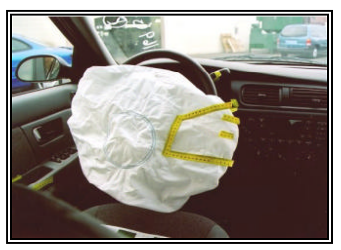
Figure 6: View of the driver air bag.

The front right passenger air bag module was a top mount design located in the right aspect of the instrument panel. The air bag had deployed as designed from the module. The face of the deployed passenger bag measured 58.4 cm x 39.4 cm (23.0 in x 15.5 in), width by height, and extended 46 cm (18 in) from the aft edge of the module. A series of vertical vinyl transfers were located on the lower central aspect of the face of the bag. These transfer marks resulted from contact between the air bag and the rear