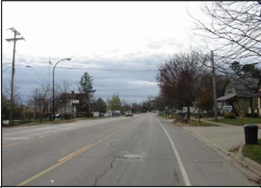
Figure 2 - Southbound approach of 1996 Oldsmobile Ninety-Eight.

the frontal damage to the Oldsmobile indicated an avoidance maneuver to the right which exposed the left aspect of the vehicle to the impact. He did warn the front right occupant, who is partially blind, by shouting that they were going to crash.