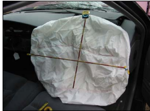
Figure 8 - Deployed front right air bag.