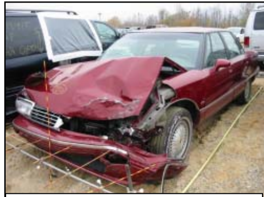
Figure 1. Subject 1996 Oldsmobile Ninety-Eight.

This remote investigative effort focused on the severity of the crash and the injury sources for an 80-year-old male driver of a 1996 Oldsmobile Ninety-Eight. The Oldsmobile ( Figure 1 ) was equipped with frontal air bags for the driver and front right position that deployed as result of this two-vehicle crash. The restrained 80-year-old male driver was operating the Oldsmobile southbound on the two-way north/south roadway. A 56-year-old male driver was operating a 1993 Jeep Grand Cherokee eastbound exiting a private driveway. The driver of the Jeep initiated a left turn from the driveway, across the path of