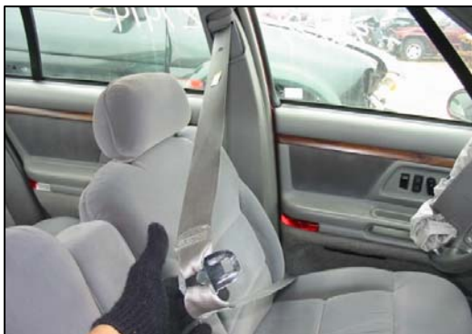
Figure 5 - Driver 3-point lap and shoulder restraint.

The 1996 Oldsmobile Ninety-Eight was equipped with manual 3-point lap and shoulder belts for all four outboard seating positions. The center seating positions in both rows were equipped with a lap belt. The front belts were configured with sewn-on latch plates, adjustable D-rings, and Emergency Locking Retractors (ELR’s). The second row belts were configured with locking latch plates and ELR’s. The driver’s and front right passenger’s belt webbing exhibited loading evidence in the form of D-ring loading on the webbing, indicative of usage. The dimensions associated with the loading evidence were not reported in the NASS case; however, images of the restraints were provided ( Figures 5 and 6 ).