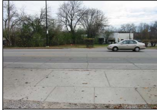
Figure 3 - Westbound approach of 1993 Jeep Cherokee.