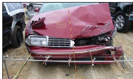
Figure 2 - Damaged 1996 Oldsmobile Ninety-Eight.

The 1996 Oldsmobile Ninety-Eight ( Figure 4 ) sustained moderate frontal damage as a result of the impact with the 1993 Jeep Cherokee. The SCI revised direct contact damage began at the left front corner and measured 78 cm (30") in