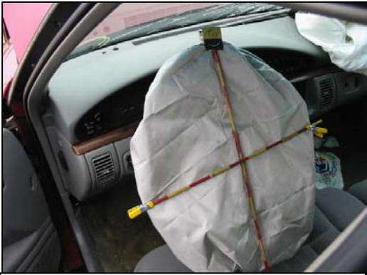
Figure 7 - Deployed driver's air bag.

The front right air bag deployed through a top-hinged single cover flap that was 39 cm (15.4”) in width and 20 cm (7.9”) in height. The deployed front right air bag ( Figure 8 ) was 61 cm (24”) in width and 48 cm (18.9”) in height in its deflated state. The air bag was vented by two ports located at the 10 and 2 o’clock positions on the rear of the bag and was tethered by two straps in unknown locations. Vinyl striations were present on the upper aspect of air bag; however, no discernable occupant loading evidence was present.