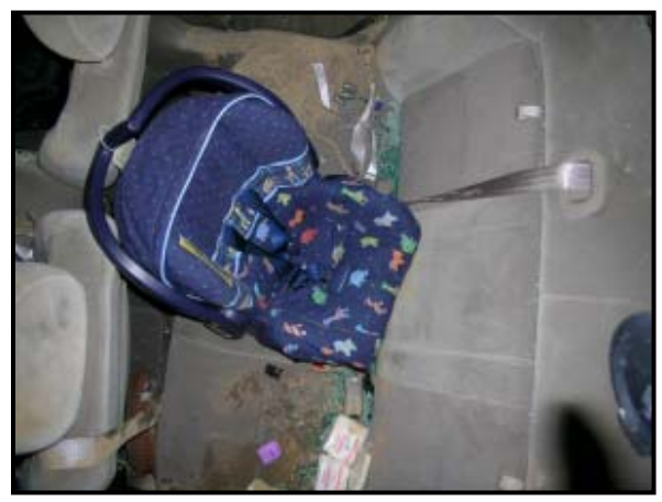
Figure 18: Left view of the RFCSS.