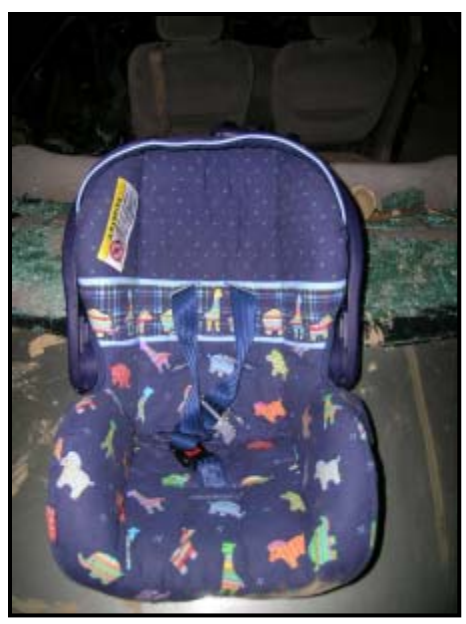
Figure 15: View of the RFCSS shell.

Figure 15 is a front view of the Rear Facing Child Safety Seat (RFCSS) in use at the time of the crash. The RFCSS was an Evenflo Port About RFCSS Model No: 5581333N1, manufactured February 6, 2004. The base of the RFCSS was restrained in the center rear position of the Ford by the vehicle's 3-point lap and shoulder belt. The seat was labeled for use by infants 2.2 kg to 10 kg (5 lb to 22 lb) with a height of 66 cm (26 in) or less. The manufacture's labels were intact and legible. The instruction manual was not present. The locking clip was in place on the back aspect of the shell.