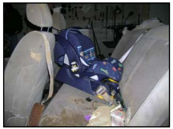
Figure 17: Overhead view of the RFSCC.

Figures 17 and 16 are views of the reconstructed position of the RFCSS. The RFCSS base fully engaged the depth of the seat cushion. The measured angle of the shell was 60 degrees and the manufacturer's inclinometer was in the " Green " zone. The upper right aspect of the seat was in-close proximity to the driver's seat back.