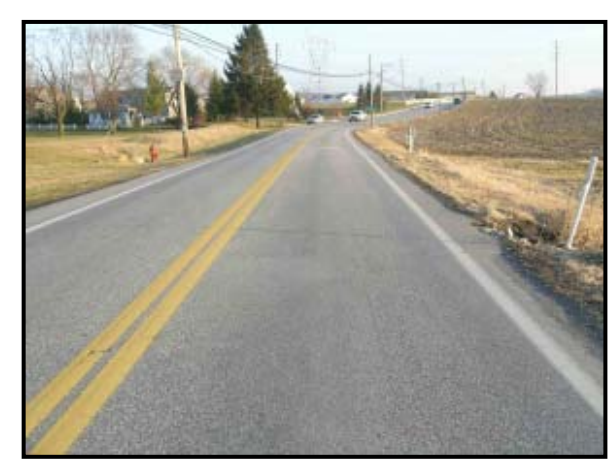
Figure 4: Trajectory view of the Ford 60 m (200 ft before impact.