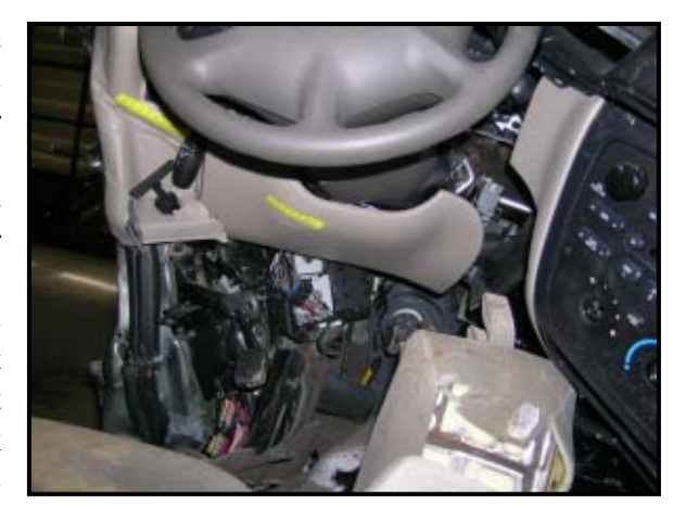
Figure 11: Knee bolster contacts.

The driver's lower extremities contacted the knee bolster Figure 11 . The driver's left knee contacted the outboard aspect of the bolster evidenced by pocketed deformation to the panel. This contact resulted in a left femur fracture. The right lower extremity contacted the bolster evidenced by a 6 cm (2.5 in) scuff mark. The mark was located 17 cm (6.5 in) left of the steering column centerline. This contact did not result in an injury. The interior surface of the left front door panel was contacted by the left flank of the driver evidenced by a 8 cm (3 in) wide scuff mark to the central aspect of the arm rest that extended up to the belt line.