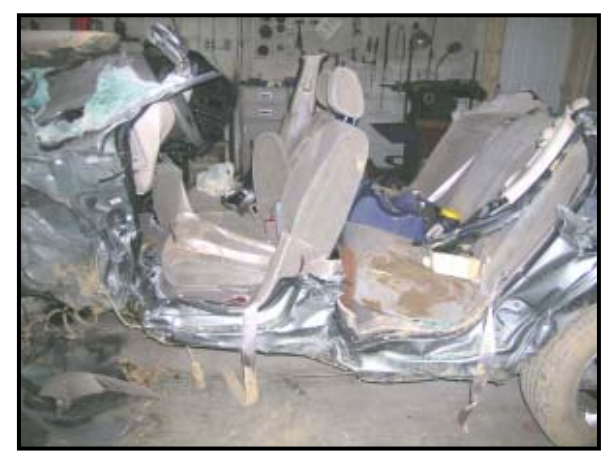
Figure 9 is a left side view of the occupant compartment. Figure 10 is an overhead view.