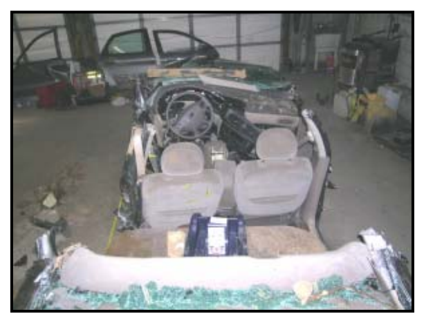
Figure 10: Overhead interior view.

The driver was in a full rear track position and could not be moved due to the floor pan deformation. This position was consistent with the driver's reported stature. The seat back was reclined 15 degrees. The horizontal distance from the seat back to the residual deformed location of the steering wheel hub/driver air bag module measured 66 cm (26 in). This horizontal distance was measured 48 cm (19 in) above the seat bight.