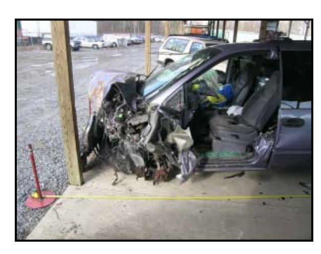
Figure 8: Left side view.