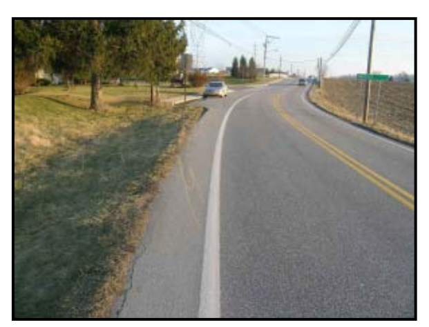
Figure 3: Southward look back view along the Dodge's trajectory.