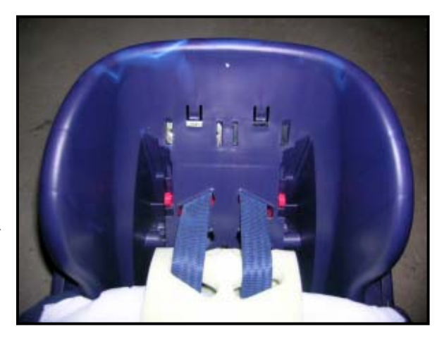
Figure 16: View of the stress marks to the RFCSS.

The shell was inspected for crash related physical evidence. The fabric covering was removed. The upper aspect of the shell exhibited stress marks that extended across the full width related to its contact with the driver seat back. Refer to Figure 16 . The stress marks appeared heavier on the right indicative of the direct contact. Additional stress marks were observed on the right arm of the carrier handle. The presence of these marks indicated the carrier handle had been rotated to the proper position (for use in a vehicle) at the time of the crash.