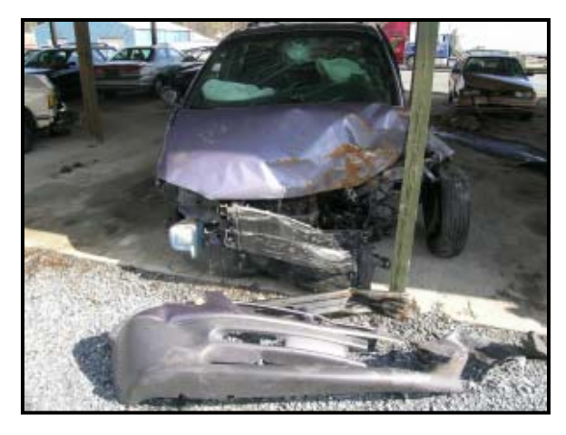
Figure 7: Front view of the Dodge.

in), C3 = 25 cm (9.9 in), C4 = 17 cm (6.5 in), C5 = 6 cm (1.8 in), C6 = 5 cm (2.0 in). The crush of the lower radiator support was: C1 = 66 cm (25.8 in), C2 = 39 cm (15.3 in), C3 = 17 cm (6.5 in), C4 = 9 cm (3.5 in), C5 = 6 cm (2.5 in), C6 = 0. The left front wheel assembly was directly involved in the impact. The left front wheel rim was deformed and the outer sidewall of the tire was cut. The left wheelbase was reduced 34 cm (13.3 in). The right wheelbase was unchanged. The left front door was jammed shut by impact damage. It was removed along with the left B-pillar was cut during the extrication of the driver. All other doors remained closed during the crash and were operational post-crash. The interior surface of the windshield exhibited a 4 cm (1.5 in) bulging fracture from an interior loose object. The fracture was located 2.5 in left of center and 13 in below the header. A baseball was found on the floor between the front seats of the Dodge and was the probable source of the fracture. The estimated delta V of the Dodge based on SCI field experience was 24 km/h to 32 km/h (15 mph to 20 mph). The CDC of the impact was 12-FYEW4.