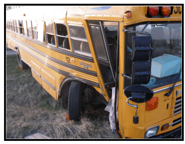
Figure 5 . Right side damage (Event 1)

The Blue Bird was equipped with Goodyear G149RSA 11R22.5 tires on the front and Kelly KDA Armorsteel 11R22.5 tires on the rear duals. The police reported that both the front and rear tires had a tread depth of approximately 10 mm (13/32 in).