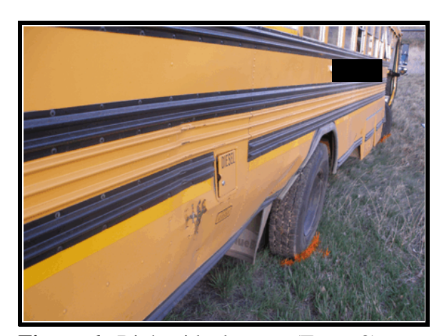
Figure 6 . Right side damage (Event 2)