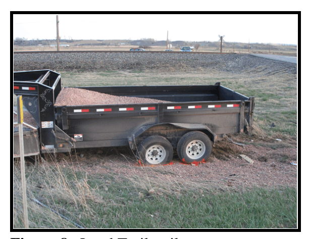
Figure 8. Load Trail trailer