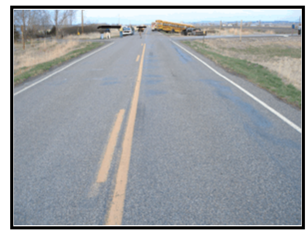
Figure 3 . Eastbound approach for 2004 Dodge Ram

( Figure 2 ). The roadway was controlled by stop signs in each direction. The southbound leg of the intersection was gravel covered and had a slight uphill grade of approximately 2 percent. The east/west roadway was configured with one lane in each direction that were separated by a solid yellow center line in the eastern direction and a dashed yellow center line in the western direction ( Figure 3 ). The roadway was level, and bordered on both sides by solid white fog lines, asphalt shoulders, and sloping grass covered embankments. There was no stop sign for eastbound traffic. The posted speed limit was 113 km/h (70 mph).