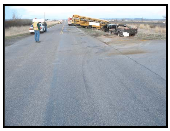
Figure 4 . Area of impact and final rest (east).

The driver of the Dodge braked but was unable to stop in time and the front of the pickup struck the right side of the school bus near the right front wheel. A 7-year-old female occupant of the school bus was ejected from the vehicle through a right side window and was fatally injured. She came to rest in the eastbound travel lane. The bus was displaced in a counterclockwise direction and began moving east. The left side of the Dodge's trailer moved in a clockwise direction and contacted the right rear of the bus. The Dodge was displaced in a southeast direction, left the roadway, and struck a small pole on its path to final rest. The bus continued moving east. Its steering had been damaged and the vehicle veered off the roadway