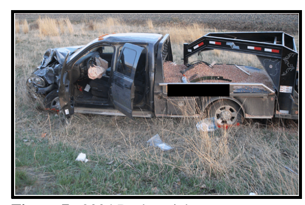
Figure 7. 2004 Dodge pickup

The Dodge was traveling eastbound with two