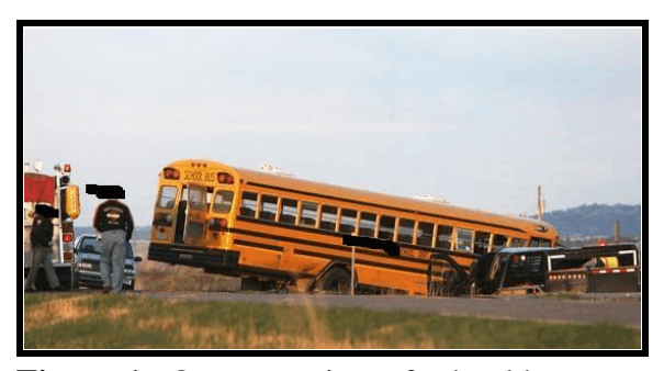
Figure 1. On scene view of school bus.

This remote investigation focused on the ejection of a child occupant of a Blue Bird school bus during a vehicle-to-vehicle crash. The crash occurred April 2008 at 1810 hours within a four-leg intersection. The subject vehicle was a 1999 Blue Bird full-size yellow school bus that was being driven by a restrained 44-year-old female ( Figure 1 ). There were 10 unrestrained children on board the bus at the time of the crash. The children were returning home from an after-school program. The other vehicle was 2004 Dodge pickup that was