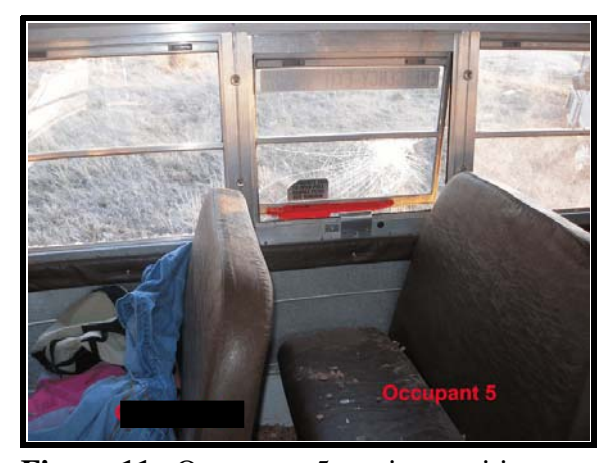
Figure 11 . Occupant 5 seating position

The 6-year-old female fourth row right occupant. She was 122 cm (48 in) in height and weighed 32