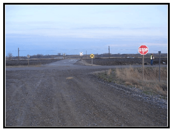
Figure 2 . Southbound approach for 1999 Bluebird bus

The crash occurred within a four-leg intersection in April 2008. At the time of the crash, there were no adverse weather conditions and the asphalt roadway surface was dry. The temperature was 5.5 degrees C (42 degrees F) with 50% humidity. The north/south roadway was configured with one lane in each direction