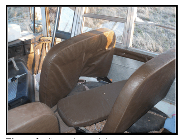
Figure 9 . Second row right occupant seating position

The 7-year-old female second row right occupant was seated in an unknown posture and was unrestrained (Figure 9). She was 135 cm (53 in) in height and weighed 39 kg (85 lbs). She was wearing a short-sleeve pullover shirt, lightweight sweat pants, and socks. She may have also been wearing a maroon jacket that was removed postcrash. At impact, she initiated a right lateral and slightly rearward trajectory and was ejected through the side window. The window sash was deformed outward (Figure 10). She sustained multiple contusions along the right side of her body from contact to the side interior surface and multiple abrasions from the side window frame as she was ejected. She impacted the ground and came to rest in the eastbound travel lane. She sustained left side rib fractures, a left lung contusion, a splenic laceration, and multiple