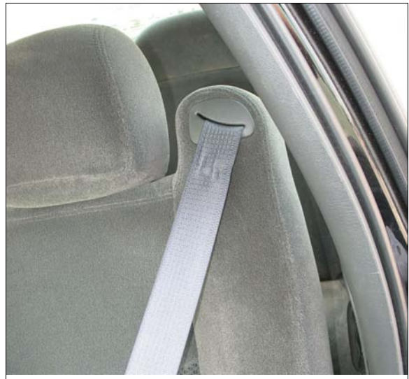
Figure 16: Chevrolet's driver safety belt webbing showing loading evidence (oblique pinch mark and stretching) near should belt guide

The Chevrolet's driver applied the brakes and probably steered, attempting to avoid the crash. As a result of these attempted avoidance maneuvers, the vehicle's counterclockwise rotation, and the use of his available safety belts, the driver probably moved slightly forward and to his right just prior to impact. The Chevrolet's frontal impact with the median barrier (event 1) enabled the driver to continue forward and slightly rightward along a path opposite the vehicle's 20 degree direction of principal force as the vehicle decelerated. The Chevrolet's initial impact displaced the driver forward and to the right as he loaded his Based on occupant kinematic safety belts. principles, when the vehicle rebounded off the median barrier and during its subsequent continued counterclockwise rotation, the driver probably moved backward toward his seat back and to his left toward the driver's door. The Chevrolet's back impact with the median barrier (event 2) displaced the driver backward and slightly rightward where he loaded his seat back.