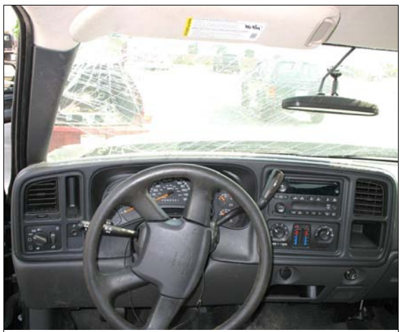
Figure 12: Chevrolet's driver seating area showing no apparent contact evidence on steering wheel, instrument panel, or greenhouse areas and nondeployment of driver's air bag

Damage Classification: The Chevrolet's Collision Deformation Classifications for the Chevrolet were: 01-FREW-1 ( 20 degrees) for the front impact with the median barrier (event 1), 05-BRLS-1 ( 160 degrees) for the back impact with the median barrier (event 2), and 00-TPDO-2 for the rollover (event 3). The WinSMASH reconstruction program, Barrier algorithm, was used to reconstruct the Chevrolet's Delta Vs for the front