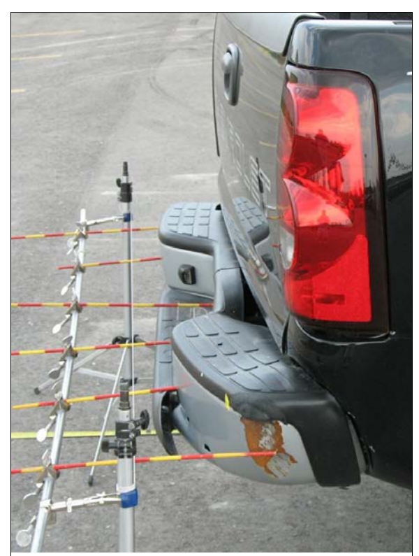
Figure 8: Damage to Chevrolet's back right bumper corner viewed from right