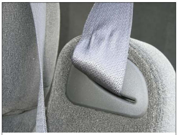
Figure 17: Stretch marks on underneath side Chevrolet's driver safety belt near shoulder belt guide