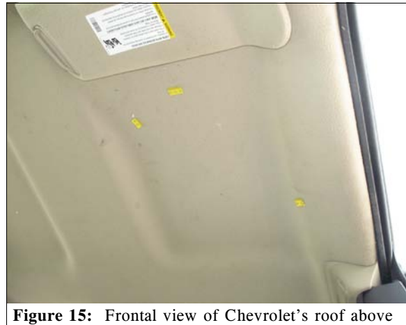
Figure 15: Frontal view of Chevrolet's roof above driver's seat with incremented tape showing area of hair and scuff mark on interior surface

The Chevrolet was equipped with driver and front right passenger CAC frontal air bags. The driver's air bag was located within the steering wheel hub. The front right passenger's air bag was located in the middle of the instrument panel. Neither air bag deployed in this crash.