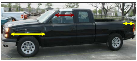
Figure 4: Arrows show areas of damage to the left side from the rollover