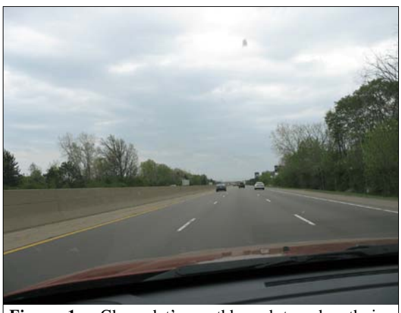
Figure 1: Chevrolet's southbound travel path in center lane of 7-lane, divided, trafficway

Crash Environment: The trafficway on which the Chevrolet was traveling was a 7-lane, divided interstate highway, traversing in a north-south direction. The southbound roadway had three through lanes while the northbound roadway had three through lanes and a lane leading to an exit ramp. The interstate highway was straight and level near the area of impact ( Figure 1 ). The pavement was bituminous, but traveled, and the width of the travel lanes was 3.7 meters (12 feet). The shoulders were improved on both the east and west sides, and there was a concrete longitudinal barrier that divided the north and south roadways