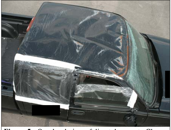
Figure 5: Overhead view of direct damage to Chevrolet's roof from the rollover and induced damage to windshield glazing

and emergency personnel were notified and responded to the crash scene. The driver called a friend, who arrived at the crash scene and transported the driver to a medical facility. Following the police investigation, the Chevrolet was towed due to damage.