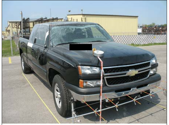
Figure 2: Damage to Chevrolet's front right corner from impact with median barrier

Post-Crash: The driver of the Chevrolet remained inside the vehicle at final rest. He was conscious and was able to exit the vehicle without any assistance through the driver's window. Police