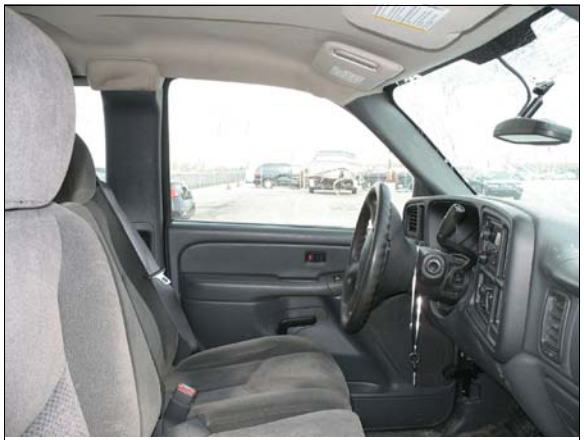
Figure 13: Chevrolet's driver seat area showing undeformed steering wheel rim and inside, windshield-mounted, rearview mirror broken off windshield by impact forces