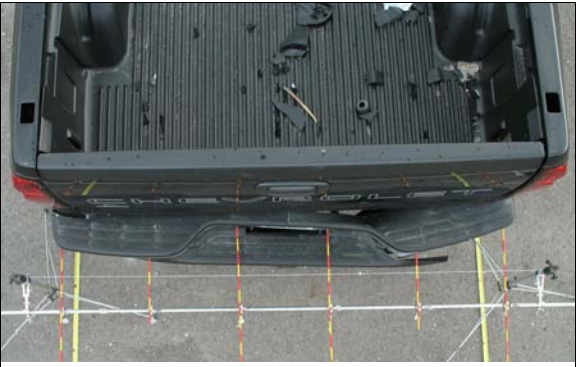
Figure 9: Overhead view of Chevrolet's back crush profile with contour gauge set a bumper level

residual maximum crush was 12 centimeters (4.7 inches) at C_6 (Figure 9). The table below shows the vehicle's crush profiles.