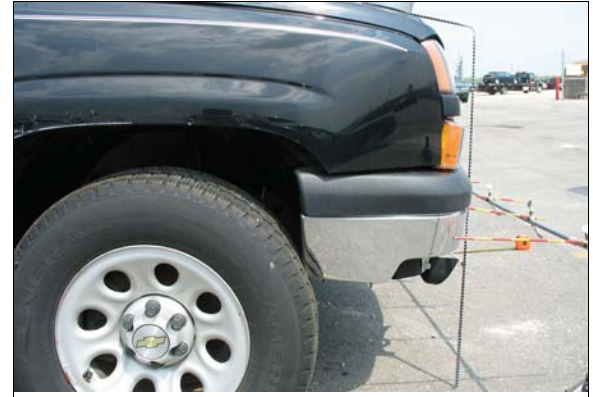
Figure 11: Chevrolet's right front tire restricted by damaged front right bumper corner

The wheelbase on the Chevrolet's left side was unaltered from the crash while the right side was extended 1 centimeter (0.4 inches). For the initial impact, the right portion of the front bumper and a small area of the right turn signal housing were directly damaged ( Figure 6 ). The front bumper fascia was crushed rearward, restricting the movement of the right front wheel ( Figure 11 ). For the second impact, the back right corner of the bumper fascia was directly damaged and crushed forward ( Figure 8 ). During