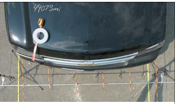
Figure 7: Overhead view of Chevrolet's front crush profile with contour gauge placed at bumper level

Exterior Damage : The Chevrolet's initial impact (event 1) with the median barrier involved the front bumper with the damage distributed on approximately the right portion ( Figure 6 ). Direct damage began at the front right bumper corner and extended 46 centimeters (18.1 inches) along the front bumper. Residual maximum crush was measured as 7 centimeters (2.8 inches) at C<sub>6</sub> ( Figure 7 ). The second impact (event 2) with the median barrier involved the vehicle's back bumper with the damage distributed on approximately the right portion. Direct damage began at the back right bumper corner and extended 6 centimeters