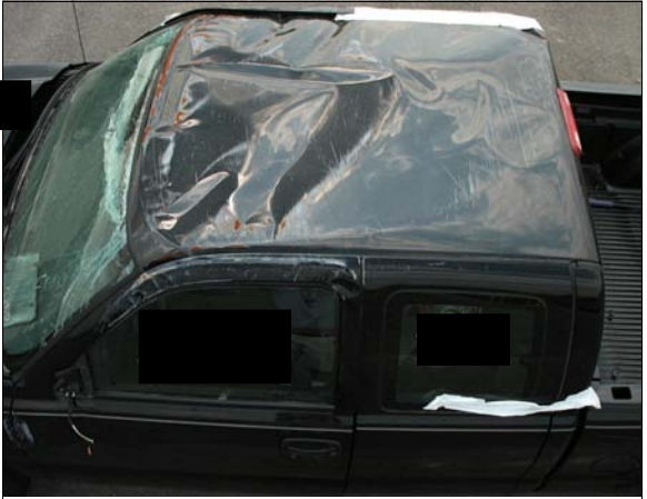
Figure 10: Overhead view from left of rollover damage to Chevrolet's extended cab and windshield; Note: damaged left outside rearview mirror