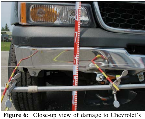
Figure 6: Close-up view of damage to Chevrolet's front right bumper area

Exterior Damage : The Chevrolet's initial impact (event 1) with the median barrier involved the front bumper with the damage distributed on approximately the right portion ( Figure 6 ). Direct damage began at the front right bumper corner and extended 46 centimeters (18.1 inches) along the front bumper. Residual maximum crush was measured as 7 centimeters (2.8 inches) at C<sub>6</sub> ( Figure 7 ). The second impact (event 2) with the median barrier involved the vehicle's back bumper with the damage distributed on approximately the right portion. Direct damage began at the back right bumper corner and extended 6 centimeters