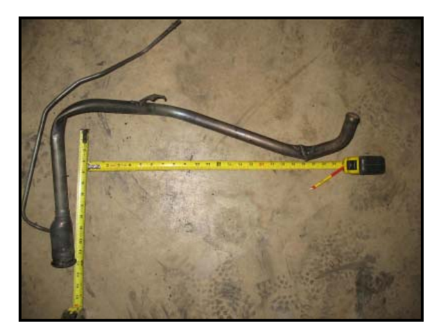
Figure 16: View of the deformed filler tube.

Figures 16 and 17 are views of the deformed filler neck and separated inlet. The filler neck was found dislodged within the rear left wheel opening. The tube was crushed full thickness 20 cm (8 in) from its downstream end. The mid-aspect of the tube was crushed and bent 90 degrees. The tube had separated from the filler door at its upper aspect and from the neoprene connector hose at its lower end. The band clamp fastening it to the connector hose fractured. The clamp was found along the curb line between the storm drain and final rest location. A cut 3 cm (1 in) in length was noted to the hose. The inlet valve completely separated from the tank. The check valve mounted within the inlet was not present and could not be found. There was no evidence of contact observed on the inlet or hose. The inlet was found in the grass beyond the sidewalk adjacent to the final rest area of the vehicle.