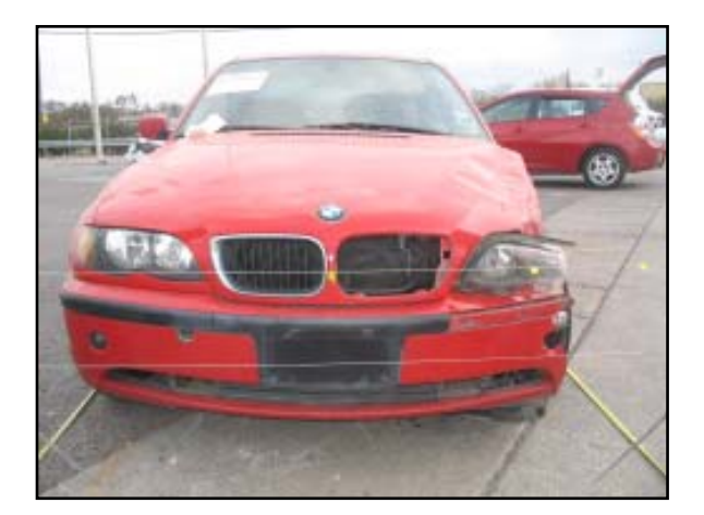
Figure 23 Front view of the BMW.

The 2004 BMW 325i sustained moderate severity damage to the front and left side planes, Figures 23 and 24 . The direct contact damage began 50 cm (19.5 in) left of the centerline and extended 32 (12.5 in) to the left bumper corner. Crush was noted to the extreme outboard end of the bumper beam and measured 3 cm (1 in). The remainder of the bumper system was undamaged. As the vehicles continued to engage, the Dodge contacted the left side of the BMW resulting in deformation and abrasions to this plane. The direct contact damage extended 212 cm (83.5 in) onto the left front door. During this engagement, the left rear wheel of the Dodge impacted the BMW's front left wheel. The wheel deformed rearward and upward into the wheel opening. Refer to Figure 24 . The left wheelbase was reduced 10 cm (4 in). The CDC for this impact was 12-FLEE-6.