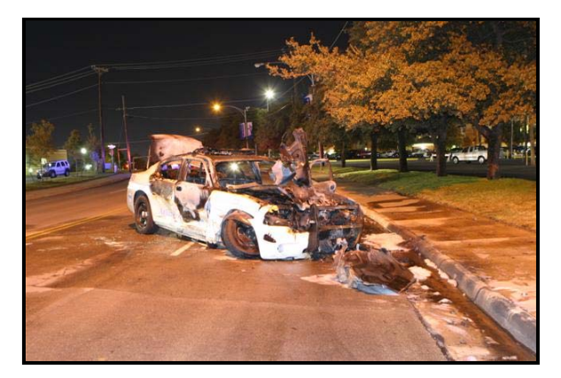
Figure 9: Final rest of the Dodge.

The police and fire personnel responded to the scene. The police officer driver exited his vehicle through the front left door. He was not injured in the crash. The driver and front right