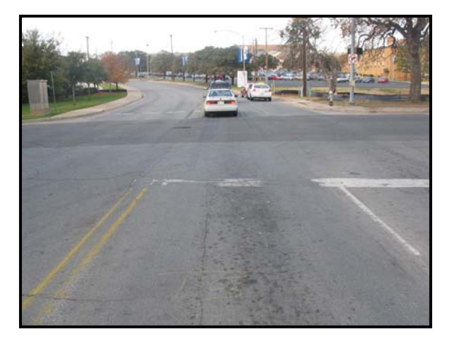
Figure 6: Westbound view at the mouth of the intersection.

The driver of the Honda reported that she observed the suspect vehicle pass through the intersection. She stated that she did hear a police siren; however, she thought the sound of the siren was coming from behind her. There were bushes and landscaping located to her left at the intersection that impeded her visibility to approaching westbound traffic, Figure 7 . The traffic light cycled to green for southbound traffic and the driver accelerated the Honda forward into the path of the approaching westbound Dodge. The eastbound BMW stopped in the inboard travel lane for the (now) red traffic signal. The Dodge Charger entered the intersection on a red traffic signal precipitating the crash.