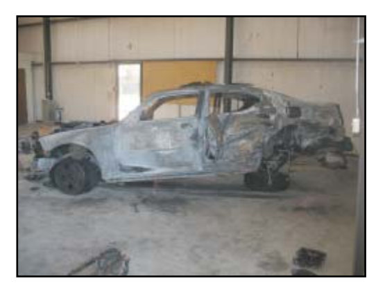
Figure 2: Left view of the Dodge Charger.

The 2007 Dodge Charger four-door sedan was equipped with the manufacturer's police equipment package and was identified by the Vehicle Identification Number (VIN) 2B3KA43H77H (production number deleted). Figure 2 is a left side view of the Dodge. The Dodge had been in-service approximately 33,795 km (21,000 miles). The vehicle was powered by a 5.7-liter, eight-cylinder engine linked to a five-speed automatic transmission with a steering column mounted shift lever. The service brakes were power-assisted front and rear disc with anti-lock and Brake Assist. The Dodge was equipped with a steering angle sensor, a yaw sensor, traction control, stability control, a Tire Pressure Monitoring