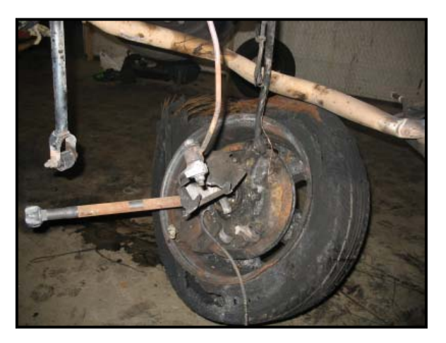
Figure 12: Damaged left rear wheel and suspension.

The Dodge impacted the curb in the storm drain with the front right tire. This force of this impact resulted in moderate damage to the wheel, completely fractured the suspension and altered the dynamics of the vehicle. The CDC of this impact was 12-FRWN3. Figure 13-14 are views of the fractured suspension and separated wheel. The mounting points of forward control arm link fractured and the control arm separated from the box frame retainer. The center control arm link fractured mid-shaft. The vertical strut separated at the upper aspect. There was minor body deformation in the aft aspect of the wheel opening from tire contact. The outer sidewall of the tire was cut during the impact. The outboard wheel rim was deformed over a 30 cm (12 in) region with a 6 cm (2.5 in) deflection of the bead. Directly opposite this deformation on the inboard side, the rim was deformed over a 20 cm (8 in) region with a 3 cm (1 in) bead deflection.