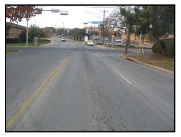
Figure 5: Westbound trajectory view 30 m (100 ft) from the intersection.

properly operating standard (green/amber/red) traffic signal. Leading into the intersection, the east/west road had an estimated negative three percent (-3%) grade for westbound traffic. At the intersection, the road transitioned to a level The opposing travel directions were grade. separated by double yellow lines. Concrete drainage gutters and curbs bordered the outboard road edges. West of the intersection, a 1.2 m (4 ft) wide sidewalk was located adjacent to the outboard travel lane. The speed limit in the area of the crash was 48 km/h (30 mph). Figure 5 is a trajectory view of the westbound Dodge leading into the intersection.