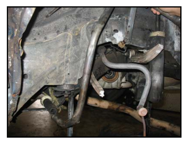
Figure 20: View of the separated inlet and filler tube reconstructed for reference.