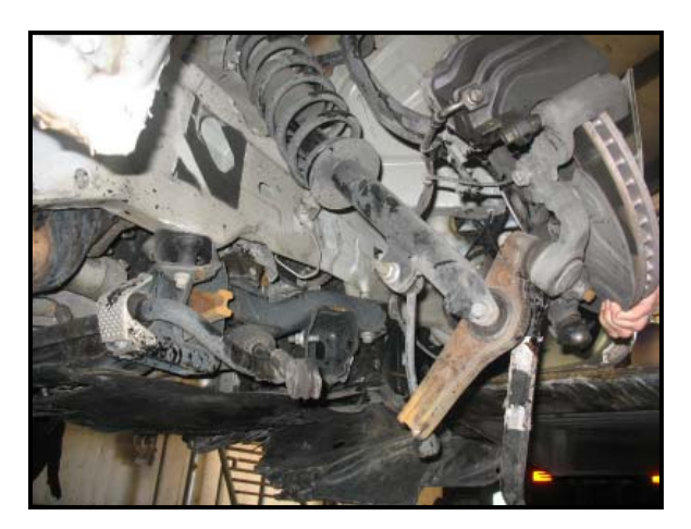
Figure 14: Front right suspension damage.

The Dodge impacted the curb in the storm drain with the front right tire. This force of this impact resulted in moderate damage to the wheel, completely fractured the suspension and altered the dynamics of the vehicle. The CDC of this impact was 12-FRWN3. Figure 13-14 are views of the fractured suspension and separated wheel. The mounting points of forward control arm link fractured and the control arm separated from the box frame retainer. The center control arm link fractured mid-shaft. The vertical strut separated at the upper aspect. There was minor body deformation in the aft aspect of the wheel opening from tire contact. The outer sidewall of the tire was cut during the impact. The outboard wheel rim was deformed over a 30 cm (12 in) region with a 6 cm (2.5 in) deflection of the bead. Directly opposite this deformation on the inboard side, the rim was deformed over a 20 cm (8 in) region with a 3 cm (1 in) bead deflection.