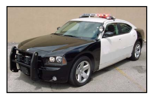
Figure 1: Exemplar 2007 Dodge Charger Police vehicle.

This on-site investigation focused on the cause of a fuel leak that resulted in a fuel-fed fire of a 2007 Dodge Charger Police Vehicle that was involved in a three vehicle multiple event crash. The Dodge Charger was equipped with a police package consisting of a 5.7 liter Hemi gasoline powered engine, Electronic Stability Program (ESP), advanced frontal air bags, and four-wheel anti-lock brakes. The vehicle was not equipped with inflatable side impact protection. The High Density Polyethylene (HDPE) fuel tank in the Charger was a saddle-bag design located forward of the rear axle spanning the drive shaft. The