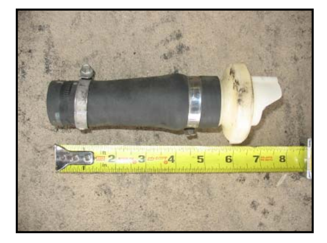
Figure 17: View of the separated inlet.

Figure 18 is a view of the burned fuel tank looking to the right. Figure 19 is a right view of the burned tank. The left third of the tank was consumed in the fire. The SCI inspection revealed that there was no deformation of the vehicle's sill, frame or undercarriage that would have