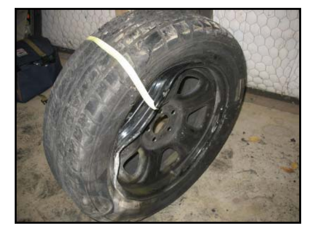
Figure 14: Front right wheel damage.