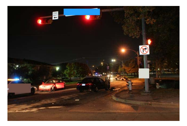
Figure 8: On-scene view of final rest.

The Dodge separated from the Honda with a clockwise rotation and was redirected to the southwest. The Dodge crossed the center line of the road and impacted the front left aspect of the stopped BMW with the center and rear aspects of its left plane. This impact involved significant contact between the left front tire/wheel of the BMW and the left rear tire/wheel of the Dodge. The force of the impact reduced the BMW's left wheelbase 10 cm (4 in) and displaced the vehicle rearward approximately 3 m (10 ft). Figure 8 is a view of the final rest positions of the vehicles taken during the police investigation.