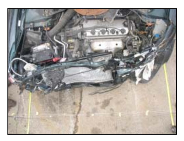
Figure 22: Overhead view of the frontal damage.