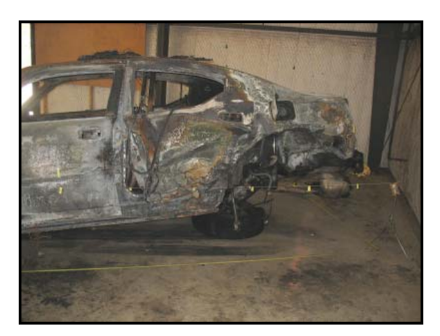
Figure 11: View of the left side damage.

impact resulted in a near complete fracture of the left rear suspension components. The forward stabilizer link, lower control arm, and shock absorber fractured at the mounting points. The upper control arm fractured mid-shaft. The wheel remained attached by only the rear stabilizer link. During the post-impact rotation away from the BMW, the left axle shaft separated from the differential. Figure 12 is a view of the left rear wheel and fractured suspension.