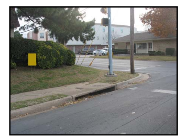
Figure 7: View of the Honda toward the westbound traffic.