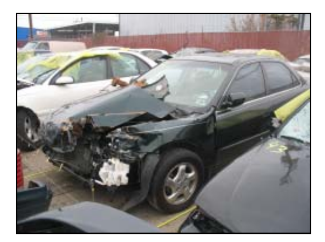
Figure 22: Front left view of the Honda.