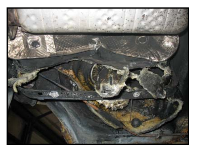
Figure 19: View of the burned tank looking to the left side of the Dodge.