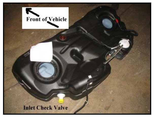
Figure 3: Exemplar fuel tank.

The top aspect of the tank contained two 11 cm (4.5 in) diameter ports for the electric fuel pumps/sending units. These units were retained within the tank with metal back rings. The fuel was supplied to the engine from the right side of the tank. Two plastic valves were mounted to the top of the tank and secured with rubber grommets. The fill inlet port was located at the lower left rear corner of the tank. A white plastic inlet valve was fused to the tank. This plastic inlet contained a spring loaded internal check valve and a 5 cm (2 in) neck for the attachment of the filler tube.