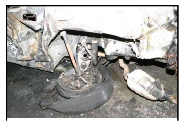
Figure 15: Rear left area of the Dodge at final rest.

The fuel tank inlet was located in the lower left rear aspect of the fuel tank immediately forward of the rear left wheel opening. This area of the tank was the source of the leak and origin of the fire. Figure 15 is a police image taken of the vehicle at final rest. As a direct consequence of the front right impact, the Dodge pitched down and rotated CW approximately 90 degrees. At ground contact, the separated rear left wheel and suspension was in the area of the fuel tank inlet. Due to the compression of the road impact, contact between the suspension/wheel and the fuel tank/inlet occurred at this time. That contact caused the separation of the fuel filler neck from