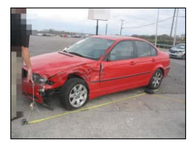
Figure 24: Front left view of the BMW.