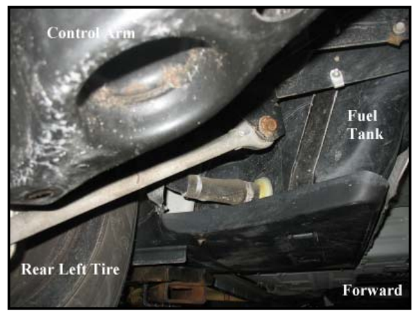
Figure 4: Exemplar mounted fuel tank.

The filler tube was secured to the quarter panel/filler door area with a rubber boot and a retainer clip. The filler tube was formed to the contour of the forward aspect of the inner fender and extended to the tank inboard of the inner fender and the wheel opening. Figure 4 is a view of an exemplar Dodge at the rear left wheel opening depicting the designed orientation of the fuel tank and inlet. The filler tube was steel and was 3 cm (1 in) in diameter and approximately 81 cm (32 in) in length.