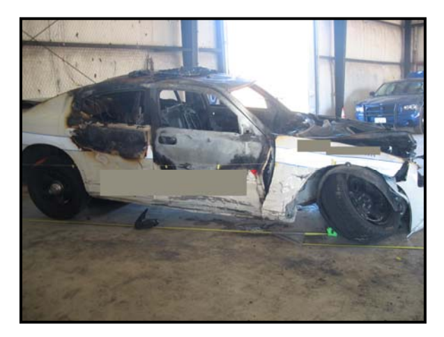
Figure 10: Right view of the Dodge.

The Dodge Charger sustained multiple regions or zones of damage resultant to the multiple event crash sequence. The damage to the right plane consisted of a 252 cm (99.2 in) long region of deformation to the right fender and right doors as a result of the lateral impact with the Honda. The direct contact began on the right fender 15 cm (5.9 in) aft of the right front axle and extended to the right rear wheel opening. Refer to Figure 10. The maximum crush occurred on the right front door 16 cm (6.3 in) aft of the base of the A-pillar. The maximum crush measured 14 cm (5.5 in). The residual crush measured at the mid-door elevation was as follows: C1 = 1 cm (0.4 in), C2 = 10 cm (3.9 in),