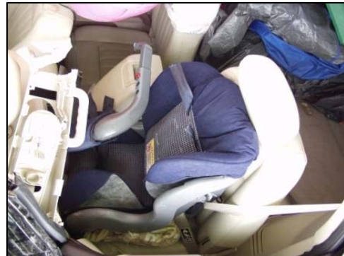
Figure 10. View of the CRS in the rear left position of the Lincoln.

The 3-year-old male rear left passenger was restrained in a forward facing child safety restraint system (CRS). The specific make and model of the CRS could not be determined from the available on-scene police images. The CRS was equipped with a tray shield and was restrained by the vehicle’s 3-point lap and shoulder belt system with the webbing routed through the proper forward facing belt path. The harness straps were routed through the top slots of the CRS. The shoulder belts of the harness system were cut post-crash by the first responders to facilitate the removal of the child passenger from the vehicle. Figure 10 is a post-crash view of the CRS secured in the rear left position of the Toyota.