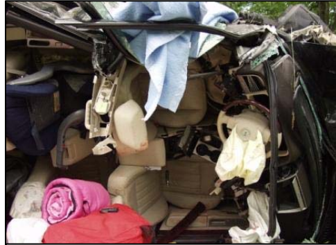
Figure 7. Interior view of the Lincoln at final rest.