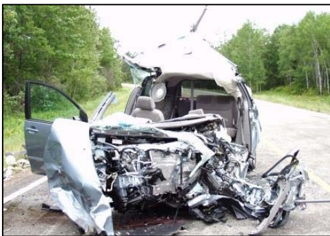
Figure 8. Frontal view of the Toyota Sienna.

Figures 8 and 9 are views of the frontal deformation to the Toyota.