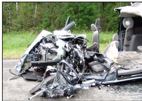
Figure 9. Left lateral view of the frontal deformation to the Toyota.