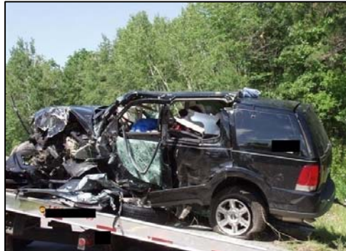
Figure 1. Left side view of the 2003 Lincoln Aviator.

This remote investigation focused on the rollover crash of a 2003 Lincoln Aviator. The Lincoln was equipped with frontal air bags, Inflatable Curtain (IC) air bags with rollover sensing, 4-wheel antilock brakes, and laminated front door glazing. A 2007 Toyota Sienna minivan crossed the centerline of a two-lane road and struck the Lincoln in an off-set, head-on configuration. The impact caused the Lincoln to rotate in a counterclockwise (CCW) direction onto the grass shoulder where it tripped into a left side leading rollover event. The Lincoln rolled down an embankment and came to rest on its right side.