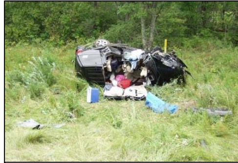
Figure 5. Final rest position of the Lincoln Aviator.