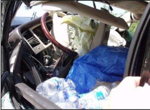
Figure 6. Intrusion into the driver's position.

Figure 6 and 7 are views of the Lincoln's interior.