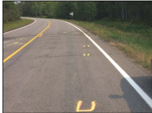
Figure 3. Pre-crash avoidance actions and resultant skid marks from the Lincoln.

The driver of the Lincoln was northbound in the appropriate travel lane at a speed consistent with the posted speed limit of 89 km/h (55 mph). The Lincoln driver maintained his lane of travel as he negotiated the left curve. The driver of the Toyota was traveling southbound as he entered the right curve for his direction of travel. For an unknown reason, the driver of the Toyota allowed the vehicle to drift to the left and cross the centerline into the northbound travel lane. There were no known avoidance actions initiated by the driver of the Toyota. The driver of the Lincoln braked and steered right onto the east shoulder in an attempt to avoid the impending crash. A right front skid mark from the Lincoln arced from the travel lane onto the asphalt shoulder, ending at the edge of the pavement. A subtle left front skid mark was present on the travel lane. This evidence marked the trajectory of the Lincoln and supported the pre-crash avoidance actions by the driver ( Figure 3 ).