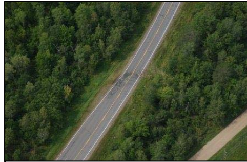
Figure 2. Aerial view of the crash site.

In the vicinity of the crash site, the roadway curved to the left for the Lincoln's northbound direction of travel. The southbound Toyota approached the crash site on a curve to the right. The roadway had a slight elevation change for both vehicles, but was less than two-percent. The north and southbound travel lanes were delineated by painted yellow centerlines that permitted passing in the northbound direction of travel. Solid white fog lines denoted the outboard edges of the travel lanes. Narrow asphalt shoulders were present beyond the fog lines and were bordered by grass and dirt shoulders in both directions. The shoulders had a gradual negative slope away from the travel lanes. Down sloped embankments extended outboard of the shoulders. Figure 2 is an aerial view of the crash site taken from the police helicopter. A schematic of the crash is attached as Figure 11 .