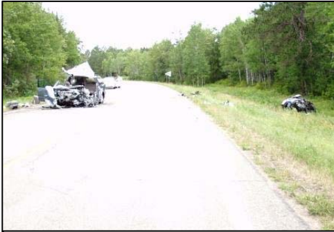
Figure 4. Final rest positions of the involved vehicles.

The investigating officer reported that all four occupants of the Lincoln sustained incapacitating injuries and were transported from the scene. None of the occupants were ejected. The driver of the Toyota sustained fatal injuries and expired at the scene. The five passengers of the Toyota sustained injuries of varying severity. Figures 4 and 5 are views of the vehicles at final rest.