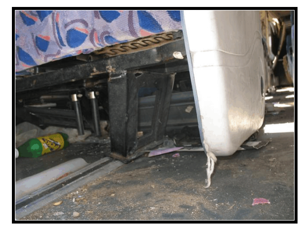
Figure 13 . Exemplar shifting of inboard seat leg

The seats were examined for seat back, seat cushion, armrest, and anchor damage. There were numerous instances of seat shifting, particularly at the inboard legs ( Figure 13 ). Outboard arm rests were deformed by intrusion on the right, as well as by occupant contact. The following table describes the damage at each seat position.