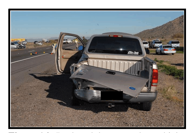
Figure 16 . Back end damage, other vehicle