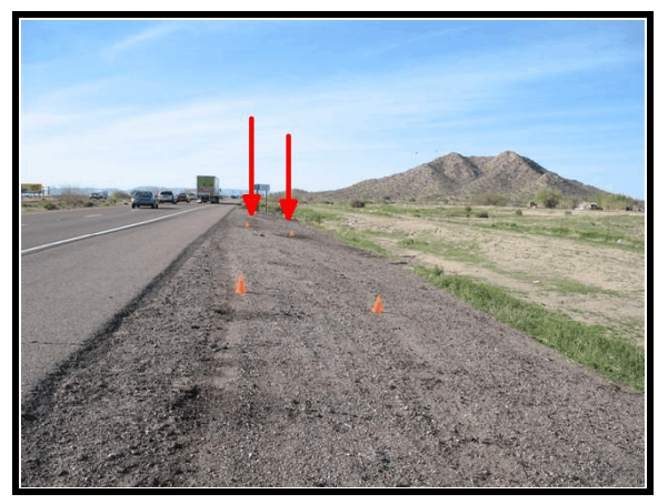
Figure 14 . Right side roadway departure. Arrows depict right rear tires trip point.

The driver was able to exit the vehicle under his own power. The vehicle was towed from the scene and placed into police evidence.