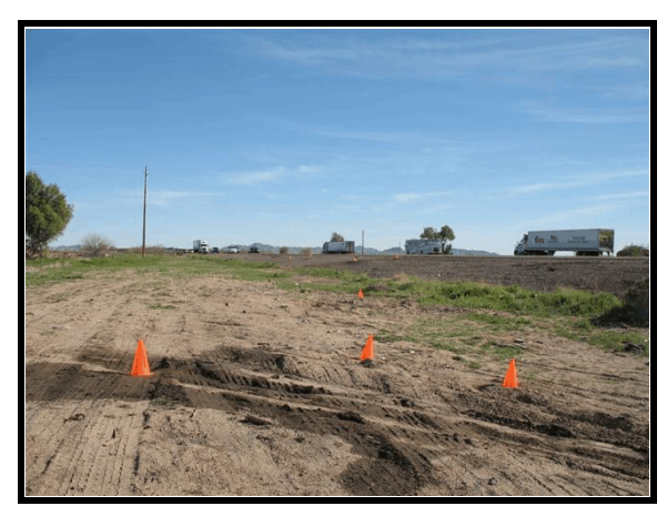
Figure 6 . Look back view of bus from beyond final rest