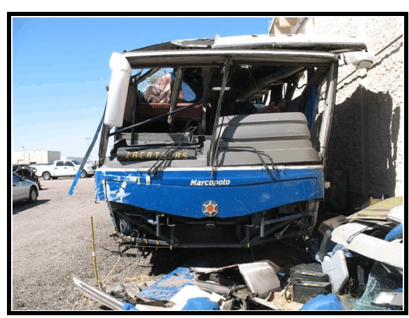
Figure 9. Frontal damage

The Dina sustained minor front end damage as a result of the impact with the Ford ( Figure 9 ). The direct damage began at the right front bumper corner area and extended 55.0 cm (21.6 in) to the left. The damage extended vertically 131.0 cm (51.5 in) from the ground. Six crush measurements were taken at the bumper level as follows: C_1 = 0 cm, C_2 = 6.0 cm (2.3 in), C_3 = 9.0 cm (3.5 in) C_4 = 13.0 cm (5.1 in), C_5 = 19.0 cm (7.4 in), C_6 = 35.0 cm (13.7 in). The maximum crush was located at C_6 . The bumper was torn away from the vehicle.