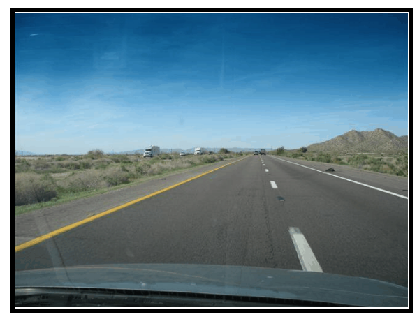
Figure 2 . Westbound approach for both vehicles