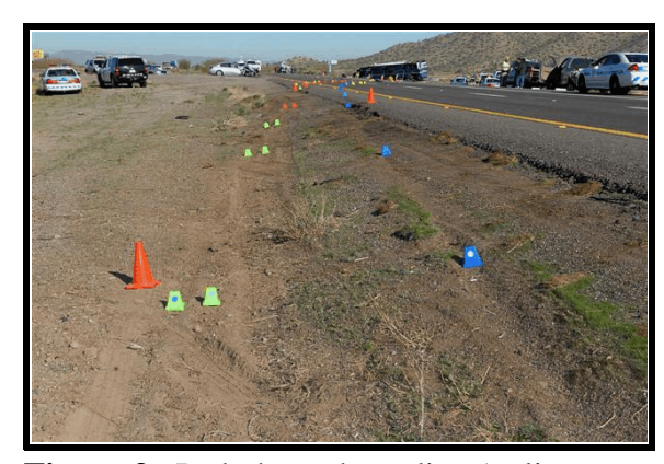
Figure 3 . Path through median

The right front of the Dina impacted the left rear of the Ford. The Ford was displaced forward but the driver remained in control of the vehicle and brought the vehicle to a controlled stop.