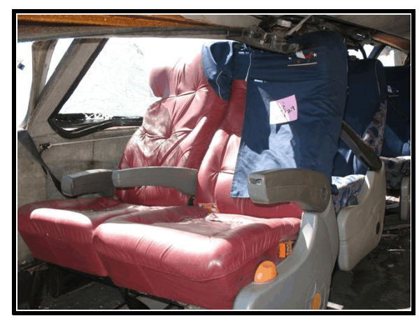
Figure 17 . Occupant 03 seating position, seat location 24

Occupant 03, a 67-year-old female, was seated in seat 24 ( Figure 17 ). During the first quarter-turn, she was displaced against the side window adjacent to her seat position. The window was fractured/displaced during the initial right side roll. She was ejected from the vehicle through the forward most side window during the fourth quarter-turn and came to rest to the right of the bus.