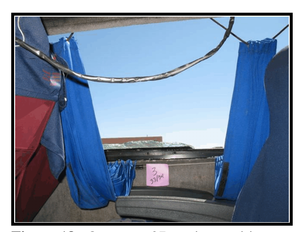
Figure 18 . Occupant 07 seating position, seat location 34

Occupant 07, an 81-year-old female, was seated in seat position 34 ( Figure 18 ). During initial right side roll, she was displaced from her seat forward and to the right against the adjacent side window. The window was displaced/fractured during the right side impact. She came out of her seat as the vehicle overturned and was then ejected through the side window during the fourth quarter-turn. She came to rest approximately 8.5 m (28.0 ft) to the right of the bus.