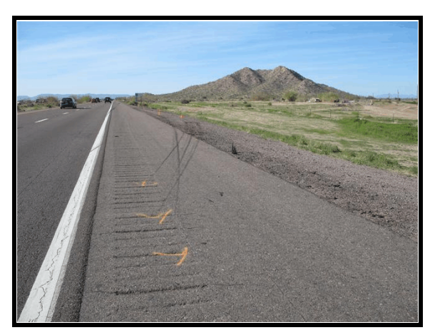
Figure 4 . Right side roadway departure for the bus

The Dina departed the roadway on the left side and entered the median ( Figure 3 ). The driver of the Dina steered to the right, reentered the roadway, and crossed the two travel lanes. The vehicle departed the roadway on the right, the driver steered left to return to the roadway, and the vehicle began a counterclockwise rotation. The rear tires crossed the shoulder onto the embankment ( Figure 4 ). The vehicle traveled approximately 51.8 m (170.0 ft) before the tires impacted the embankment surface and the vehicle tripped ( Figure 5 ). The bus began a right side leading rollover, rolled 4 quarter-turns, and traveled 34.1 m (112.0 ft) before coming to rest.