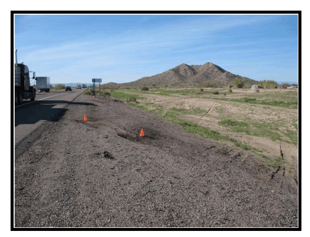
Figure 5 . Rear bus tire trip points. Right side road departure.