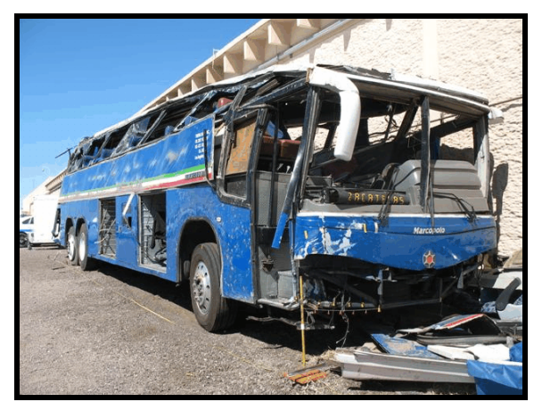
Figure 10. Right side damage

The Dina sustained severe interior damage due to intrusion, seat movement, loss of integrity, and occupant contacts. The right and left windshield glazing was displaced. Based on police photos, the side windows on the right were displaced/disintegrated at all locations except the 4th and 7th windows. The windows on the left were all displaced/disintegrated. The side windows were all sealed with none of them configured to be used as exits. It is not known which, if any, of the windows were originally intended to be used as exits. The vehicle was configured with two roof exits; the exit covers were missing at the time of the vehicle inspection but were present and closed at the time of the crash according to police photos.