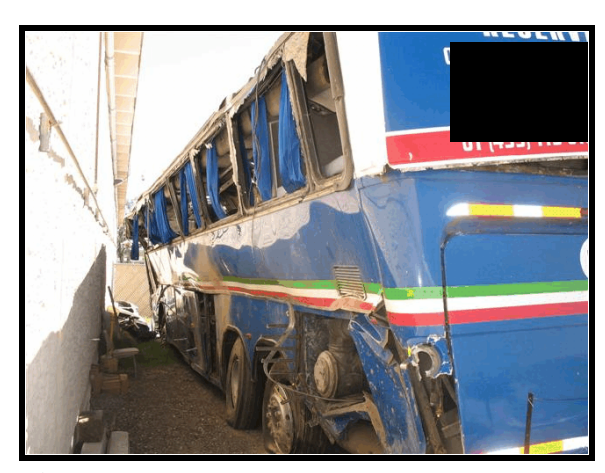
Figure 11. Left side damage