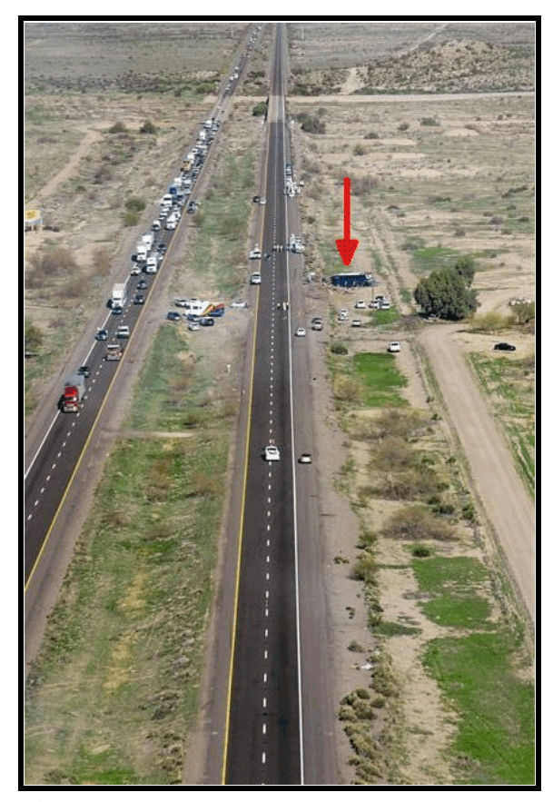
Figure 1 . Final rest location of bus - looking west

The crash occurred within the westbound lanes of an east/west interstate highway ( Figure 2 ). The highway was configured with two lanes that were separated by dashed white lines. The asphalt roadway was straight, level, and dry at the time of the crash. It was dark and there were no streetlights. The roadway was bordered on the north by a 3.0 m (10.0 ft) asphalt shoulder with a 1.2 m (4.0 ft) rumble strip, and a 21 percent gravel-covered