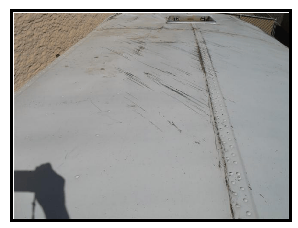
Figure 12 . Roof damage (looking toward front of bus)

Details regarding survival space measurements, seat damage, and roof crush and intrusions are discussed in the sections that follow.