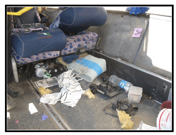
Figure 19 . Occupant 08 seating position, seat location 41

Occupant 15, a 58-year-old female was seated in seat position 71. During initial right side roll, she was displaced from her seat forward and to the right and was probably near the second set of