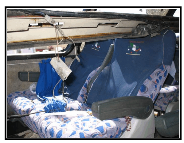
Figure 20 . Occupant 12 seating position, seat location 53

There was one additional non-fatal ejected occupant but the identification of this occupant is not known.