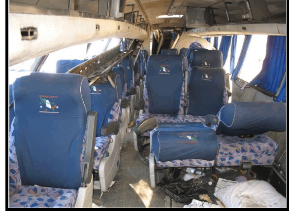
Figure 8 . Overview of seating, view from front