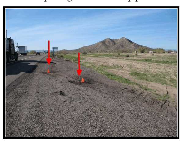
Figure 15. Rear tires trip points