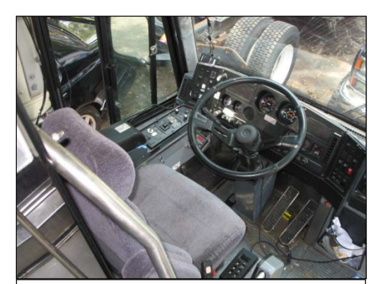
Figure 4: Driver's location and instrument panel/controls of the motorcoach.

The interior of the motorcoach was configured for a driver and 55 passengers. The driver's seat and the forward controls were conventionally mounted to the left side of the unit, left of the center aisle, directly opposite of the loading door and entrance staircase. The driver's fully adjustable seat was equipped with a manual lap belt restraint. Typical vehicle controls and gauges were mounted within the vinyl and polymer instrument panel, as depicted in Figure 4 . The brake air pressure gauge measured 690 kPa (100 PSI) at the time of the SCI inspection. Based on the gauge reading, there were no air leaks in the system.