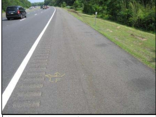
Figure 6: Departure of the motorcoach onto the west shoulder.

The left side tires began to mark on the asphalt road surface approximately 50 m (164 ft) south of the initial point of departure from the travel lane ( Figure 6 ). The vehicle traveled another 25 m (82 ft) prior to exiting the outboard edge of the shoulder onto the grass roadside. The combination of the steering input, brake application, and negative slope of the roadside induced a counterclockwise (CCW) yaw to the motorcoach approximately 37 m (121 ft) from the point of departure from the shoulder. The vehicle's trajectory and travel distance was evidenced by deep tire marks in the soft grass surface. The motorcoach's center of gravity (CG) continued in a southerly direction as it yawed approximately 30 degrees CCW over a distance of 54 m (177 ft) to impact with the small diameter trees. Figure 7 is an off-road view of the motorcoach's trajectory across the roadside.