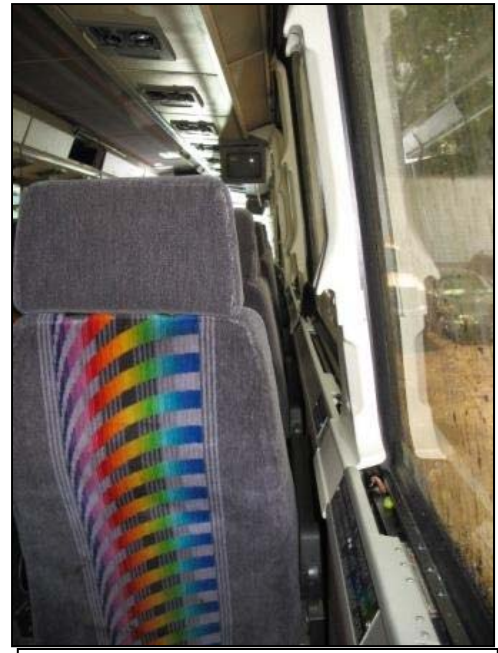
Figure 14: Interior view of the right lateral intrusions looking forward.