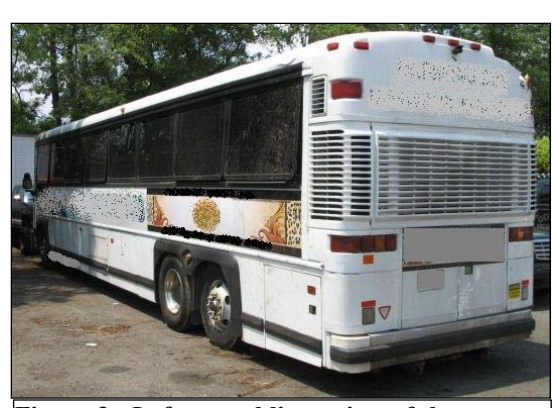
Figure 3: Left rear oblique view of the involved motorcoach.

The 1997 MCI Model 102-DL3 motorcoach was manufactured by Motor Coach Industries, Inc. in March 1997. This motorcoach had a 55-passenger capacity, exclusive of the driver. Depicted in Figure 3 , the motorcoach was identified by the Vehicle Identification Number (VIN): 1M8PDMTA7VP (production sequence deleted). The instrument panel-mounted odometer reading was 365,858.4 km (227,333.9 mi). A Veeder-Root Series 7777 Hubodomoter manufactured by Danaher was installed on the right drive axle and