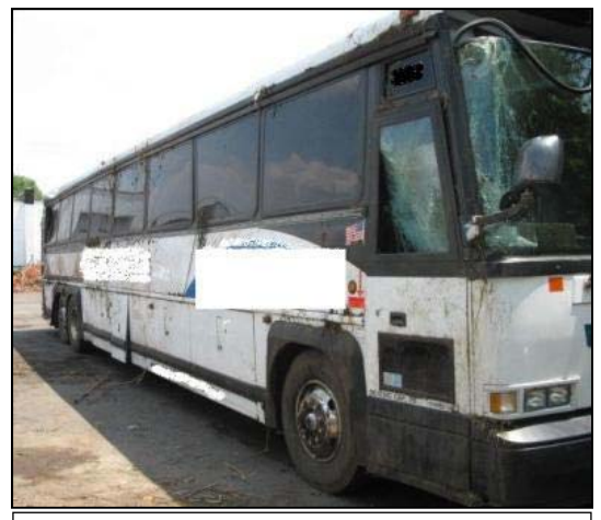
Figure 10: View of right side plane rollover damage.

The exterior of the motorcoach sustained damage to its right, front, and back planes as a result of the side impacts and subsequent rollover. Minor severity damage was located on the right side (Figure 10) from the initial small diameter tree impacts. The damage consisted of isolated minor crush and inward buckling of the lower body-panel fascia, sill, and rear-axle area polymer fender flare. The tree impact damage was overlapped by the subsequent rollover; however, based on scene evidence and vehicle damage patterns, the three tree impacts were located as follows: (Event 1) immediately aft of the rear tag axle area with corresponding damage to the sill; (Event 2) immediately forward of the right drive axle with corresponding sill and lower body-paneling damage; (Event 3) within the right rear axle area with corresponding polymer fender flare damage above the tag axle location. The rollover damage was distributed across the entire right side of the motorcoach, with induced damage to the front and back planes.