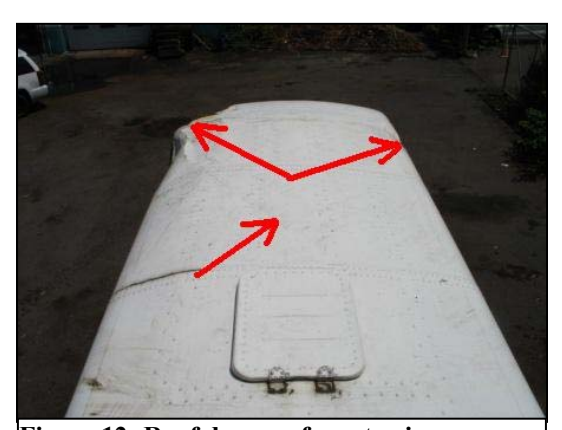
Figure 12: Roof damage from towing activities.

The roof of the motorcoach was constructed of aluminum body panels riveted to the lateral and vertical members of the roof structure. Figure 12 is a view of the roof looking aft from the rear roof exit area. The roof panels remained intact with no separation or crash related damage. The roof at the back of the motorcoach was compressed laterally on each side from tow straps used during the recovery efforts of the vehicle. The tow straps were attached to the right sill area and extended over the roof of the motorcoach. A diagonally oriented crease from a tow strap began at the midline of the roof aft of the rear