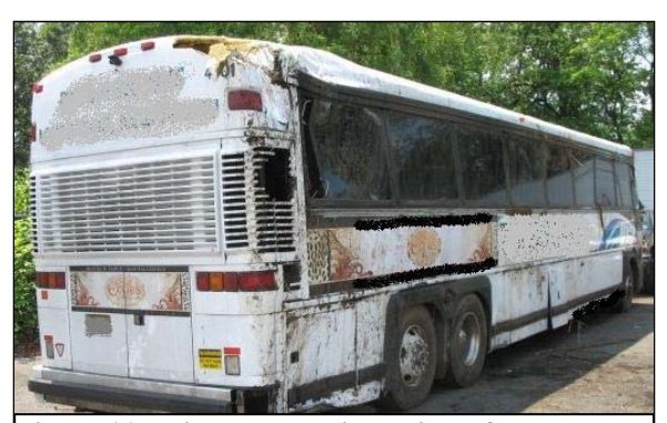
Figure 11: Right rear oblique view of the motorcoach.