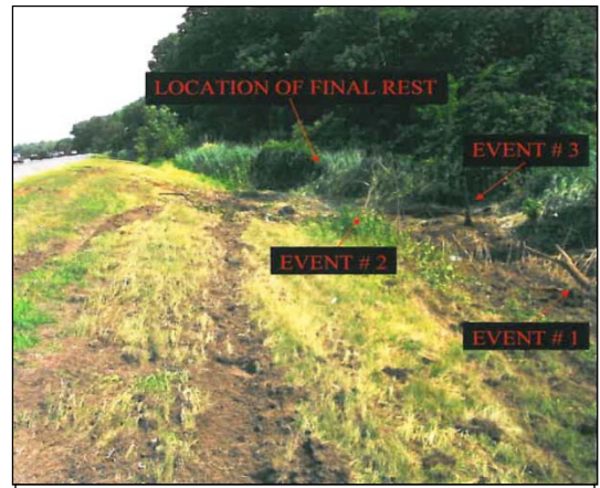
Figure 8: Motorcoach crash site.

The right rear area of the motorcoach impacted, fractured, and uprooted the three trees ( Figure 8 ) that were located at the bottom of the slope over a longitudinal distance of (5.5 m (18 ft). The tree impacts did not alter the trajectory of the motorcoach as it continued to yaw approximately 10 degrees CCW. The right side tires furrowed deep into the soft dirt of the roadside which tripped the vehicle into a right side leading rollover event. The motorcoach yawed approximately 40 degrees CCW and traveled 171.5 m (563 ft) from the point of lane departure to the trip point. The motorcoach overturned into tall cattails and vegetation, which resulted in a soft rollover event ( Figure 9 ). The vehicle completed one-quarter turn onto its right side and slid approximately 8 m (26 ft) to final rest.