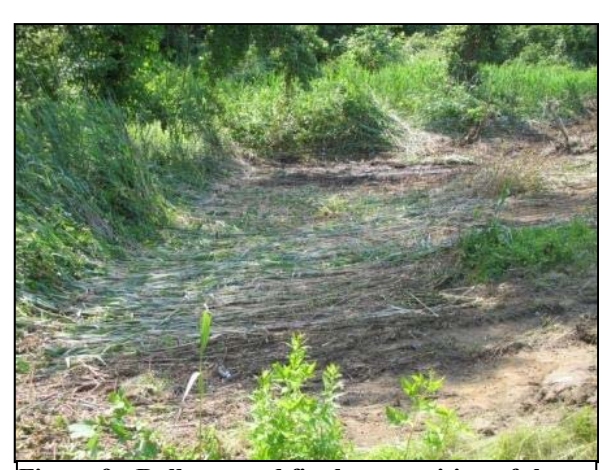
Figure 9: Rollover and final rest position of the motorcoach.