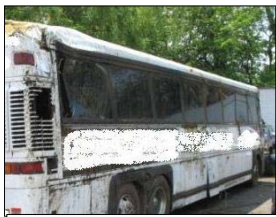
Figure 16: Forward view of the right glazing status.