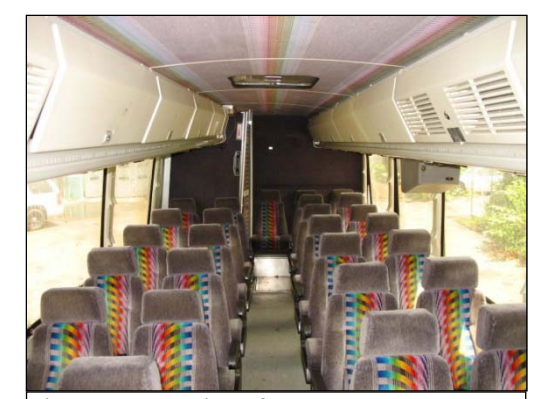
Figure 5: Interior of the motorcoach looking rearward.

All seats were of tubular steel construction with foam padding, and covered with a synthetic blend fabric. Each seat was also equipped with a reclining seatback, adjustable head restraint, and a metal footrest. Armrests were mounted to the outboard aspects of the seatbacks. Adjacent to the rear row was a typical small lavatory, constructed of plywood walls incorporated into the right rear corner of the motorcoach. These walls, as well as the ceiling structure and all other similar areas of the motorcoach, were covered in a synthetic carpet material similar to the fabric covering the seats.