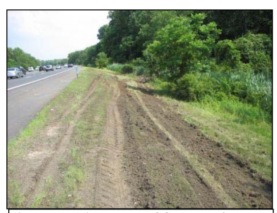
Figure 7: Trajectory and CCW yaw of the motorcoach across the roadside slope.