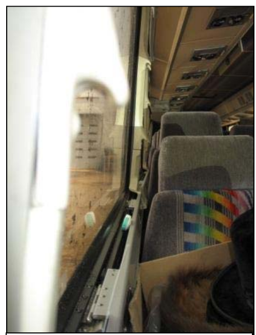
Figure 13: Rear view of the lateral intrusions along the right side of the interior.