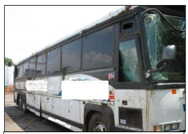
Figure 15: Rear view of the right side glazing status.

The left side glazing consisted of two small driver's panels and eight large rectangular passenger compartment panels. Both of the driver's glazing panels were intact and undamaged. The eight large rectangular passenger compartment glazing panels were manufactured of the same glazing material and construction as the aforementioned right side panels, and were the same size. All eight left side panels remained intact and were undamaged.