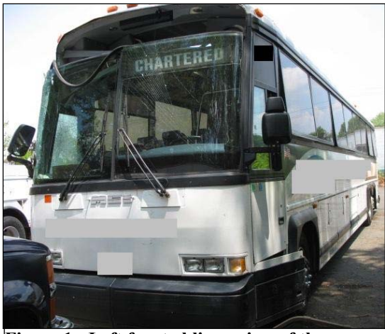
Figure 1: Left front oblique view of the involved motorcoach.

This on-site investigation focused on the rollover of a 1997 MCI Model 102-DL3 motorcoach ( Figure 1 ). The motorcoach was occupied by a 35-year-old male driver and 20 adolescent to adult age passengers. It was traveling southbound at highway speeds on an interstate when it departed the right side of the roadway onto the grass roadside. The vehicle initiated a counterclockwise (CCW) yaw on the grassy slope, impacted three small-diameter trees, and tripped into a one-quarter turn rollover onto its right side. As a result of the crash, six passengers were transported by ground ambulance to local area hospitals for treatment of their injuries.