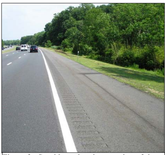
Figure 2: Southbound trajectory view of the motorcoach.

The motorcoach crash occurred on a divided interstate highway with a posted speed limit of 105 km/h (65 mph). The interstate consisted of three lanes in both directions, divided by a depressed grass median. Paved shoulders bordered the travel lanes with rumbles strips cut into the shoulders adjacent to the edge lines. In the area of the crash, the southbound travel lanes curved to the left and were level. To the west of the roadway, outboard of the shoulder, was a grass swale area with negative 9.8 percent grade that transitioned into a ditch bordered by a line of deciduous trees. The daytime weather conditions were clear with a temperature of 30 Celsius (86 Fahrenheit) degrees,