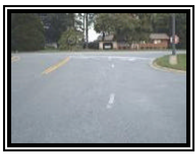
Figure 1. Eastbound approach for the 1998 Ford Taurus SE.

as she attempted to turn left (north) at a police reported speed of 16 km/h (10 mph). The 30 year old male driver of the 1992 Yamaha motorcycle was operating the vehicle southbound ( Figure 2 ) at a police reported speed of 72 km/h (45 mph). There were no brake marks within either vehicle's trajectory indicative of driver avoidance maneuvers.