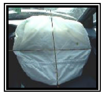
Figure 6. 1998 Ford Taurus SE redesigned passenger air bag.

The front right passenger air bag deployed from the right top instrument panel area with a single cover flap design hinged at the top aspect. The cover flap was asymmetrical in shape and measured 40.0 cm (15.7 in) in width and 23.0 cm (9.1 in) in height along the left edge and 21.0 cm (8.3 in) in height along the right edge. The windshield was fractured by the module cover flap. Although no contact evidence was identified on the exterior surface of the module cover flap, gray powder marks were documented to the upper right quadrant of the air bag. The NASS researcher measured the passenger air bag at 60.0 cm (23.6 in) in width and 52.0 cm (20.5 in) in height in its deflated state ( Figure 6 ). The bag was tethered by two internal straps. No vent ports were present. No cutoff switch was reported for the front right redesigned passenger air bag.