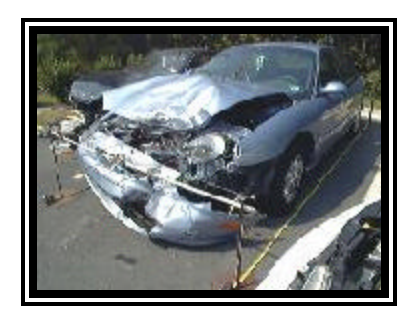
Figure 3. Frontal damage to the 1998 Ford Taurus SE.

Interior damage to the Ford Taurus identified through the NASS vehicle inspection was minimal and was attributed to occupant contact. The lap belt webbing was stretched. A scuff mark was noted to the left knee bolster. The rear-view mirror was displaced forward (not fractured). No intrusions were found in the vehicle. No deformation was documented to