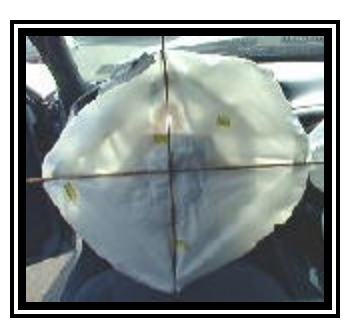
Figure 5. 1998 Ford Taurus SE redesigned driver air bag.

The 1998 Ford Taurus SE was equipped with redesigned frontal air bags for the driver and front right passenger positions. The air bags had deployed as a result of the crash. The driver air bag was housed in the center of the steering wheel with a single cover flap design hinged at the top aspect. The flap measured 12.5 cm (4.9 in) in width along the top portion, 9.5 cm (3.7 in) along the lower portion and 5.0 cm (2.0 in) height. Although no contact evidence was identified on the exterior surface of the module cover flap, brown spots were documented to the upper and lower portions of the air bag along with black vinyl transfers from expansion within the module. The NASS researcher measured the diameter of the driver air bag at 62.0 cm (24.4 in) in its deflated state (Figure 5). The bag