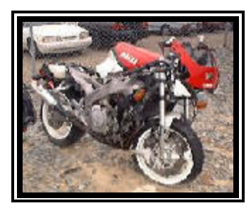
Figure 4. Frontal damage to the 1992 Yamaha FZR1000 motorcycle.

the knee bolsters (rigid plastic type) or steering wheel rim/column (tilt column set to the full down position).