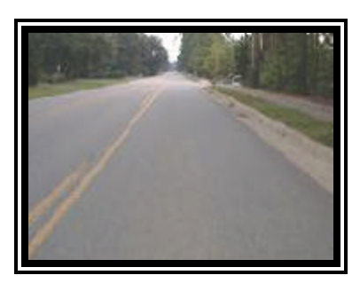
Figure 2. Southbound approach for the 1992 Yamaha motorcycle.