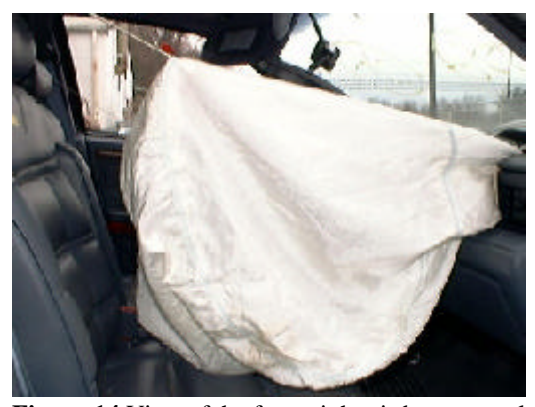
Figure 14 View of the front right air bag manual expanded to illustrate bag excursion

The face of the passenger side air bag exhibited a linear artifact field of small dark brown transfers which were associated with tissue from the front right occupant's neck and facial areas. This area measured 21.6 cm (8.5") in length and 7.6 cm (3.0") in width. It began 15.2 cm (6.0") below the inflator unit and was 22.9 cm (9.0") in-board of the right vertical seam. There was a faint yellow/tan color transfer which measured 26.7 cm (10.5") laterally and 11.4 cm (4.5") vertically and was located 58.4 cm (23.0") below the inflator unit. A 10.2 cm (4.0") dark area on the right side panel of the air bag was located 49.5 cm (19.5") below the inflator unit.