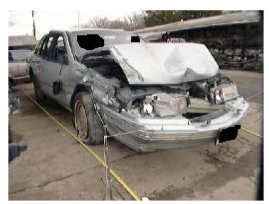
Figure 9 Right front corner view