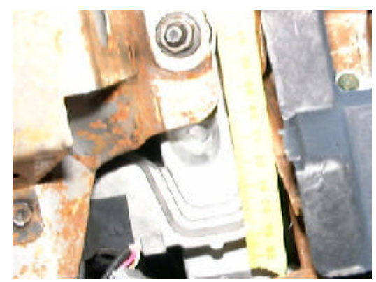
Figure 10 View of the shear capsule displacement

The rearview mirror was detached from its windshield attachment point by the deploying passenger side air bag and contacted the left side of the windshield 15.9 cm (6.25") left of the vehicle centerline and 19.7 cm (7.75") below the windshield header. This contact resulted in a fracture pattern of the windshield which had a focal origin with an overlaying vinyl transfer from the vinyl mirror housing.