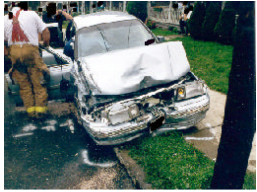
Figure 5 View of the Lincoln at the final rest position

Vehicle #1 continued across the lawn of a second residence and impacted another wrought iron fence with the frontal plane. It then raked across a second concrete stairway with the engine oil pan and the right front tire. The vehicle's trajectory arced back toward the roadway ( Figure 4 ) where on-scene police photographs indicated the left front tire produced an acceleration tire mark in the lawn. Vehicle #1 struck a 23.2 cm (9.2") diameter wood utility pole with the center frontal plane ( Figure 5 ) which initiated the deployment sequence of the supplemental restraint system (SRS). The vehicle then rotated in a counterclockwise direction and rebounded 1.2 m (4.0") to the FRP. During the rebound trajectory, it sideswiped the right side of a 1995 Saturn SL which was parked in the road