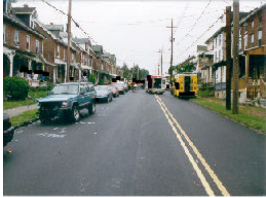
Figure 1 On-scene view of the Lincoln Continental's trajectory prior to impact with the first parked vehicle

Prior to the crash, Vehicle #1 traveled through a 90 degree left curve and was heading west in a posted speed limit zone of 40 km/h (25 mph). The vehicle traveled approximately 152 m (500') from the curve on a two lane undivided, positive 3.5 percent slope, straight, dry asphalt roadway when it crossed the opposing travel lane and struck the front of an unoccupied 1995 Jeep Cherokee with its right front bumper corner ( Figure 1 ). The Jeep which was parked on the south side of the roadway adjacent to a 10.2 cm