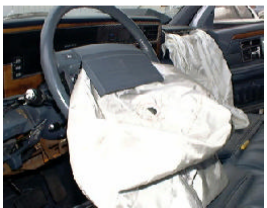
Figure 11 View of the front left air bag module cover flap and air bag

The front left driver side air bag had four tethers and two vent ports which measured 2.2 cm (0.875") in diameter. The module cover was a rectangular design which opened in the prescribed asymmetrical pattern ( Figure 11 ) where the upper flap measured 12.7 cm (5.0") vertically and the lower flap was 4.4 cm (1.75"). There were no apparent occupant contact points on the cover surface.