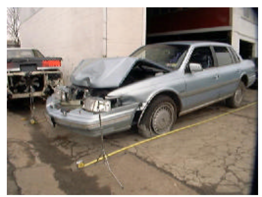
Figure 8 Left front corner view of the Lincoln