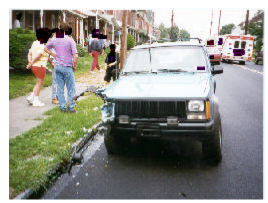
Figure 2 View of the Jeep at the final rest position and the Lincoln's continued trajectory onto the adjacent sidewalk