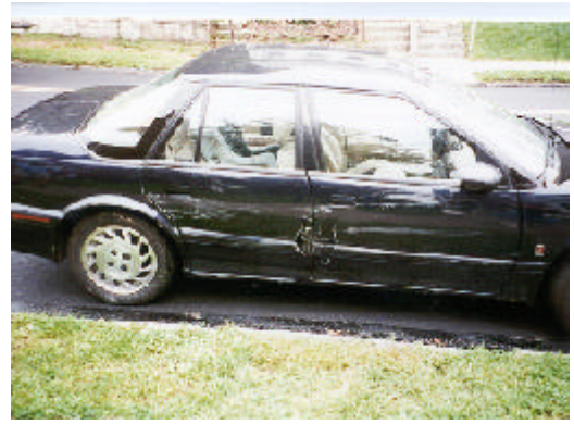
Figure 6 View of the damage along the right side plane of the Saturn which was parked in the vicinity of the Lincoln's impact with the pole