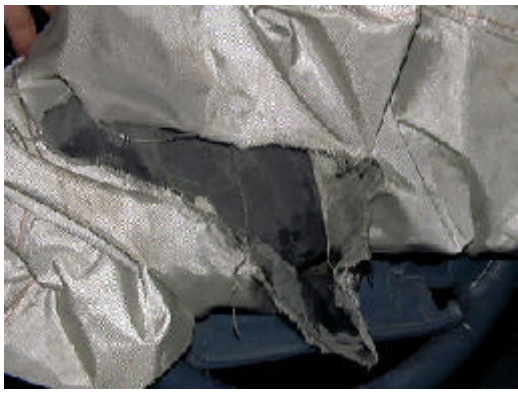
surface of the front left air bag

The front right passenger air bag module was a mid mount design which incorporated a top horizontal flap and a bottom vertical flap ( Figure 13 ). The top flap measured 7.9 cm (3.125") longitudinally for the upper flap and 33.3 cm Figure 12 View of the rip in the bottom rear (13.125") laterally along the common separation seam. The