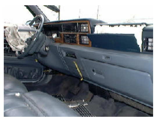
Figure 13 Angular view of the instrument panel showing the front right air bag module cover

The air bag was nontethered and did not have any visible vent ports. The air bag material was a white course nylon which had a small square weave pattern. The longitudinal excursion of the air bag measured 61.0 cm (24.0") from the air bag module cover toward the seat back rest ( Figure 14 ). The seat back rest measured 72.4 cm (28.5") from the air bag module cover at a height of 43.2 cm (17.0") above the junction of the seat cushion. The lateral dimension of the air bag measured 68.6 cm (27.0").