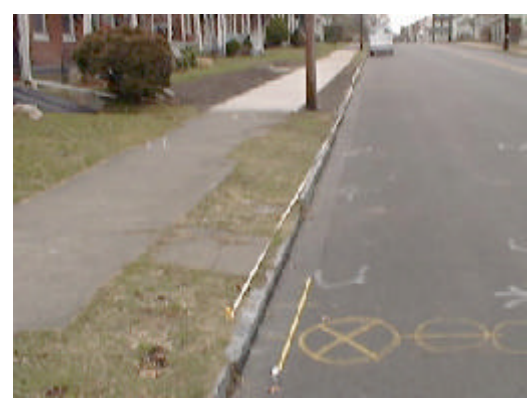
Figure 3 Trajectory of the Lincoln which traversed the side walk and continued along the lawn area

(4.0") barrier curb was pushed rearward 2.4 m (8.0') where it came to the final rest position (FRP) rotated in a counterclockwise direction with the front end angled slightly into the eastbound travel lane ( Figure 2 ). The Lincoln Continental mounted the adjacent south curb, traveled across a 0.9 m (3.0') wide grass area and a 1.8 m (6.0') wide concrete sidewalk before traversing a 38.1 cm (15.0") vertical rise grass lawn ( Figure 3 ). It struck a wrought iron hand railing which was attached to a two step concrete stairway with the left front bumper corner. As the vehicle continued, the left front tire impacted the top step resulting in deformation of the wheel.