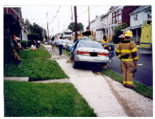
Figure 4 View of the Lincoln's trajectory as it returned toward the roadway edge

Vehicle #1 continued across the lawn of a second residence and impacted another wrought iron fence with the frontal plane. It then raked across a second concrete stairway with the engine oil pan and the right front tire. The vehicle's trajectory arced back toward the roadway ( Figure 4 ) where on-scene police photographs indicated the left front tire produced an acceleration tire mark in the lawn. Vehicle #1 struck a 23.2 cm (9.2") diameter wood utility pole with the center frontal plane ( Figure 5 ) which initiated the deployment sequence of the supplemental restraint system (SRS). The vehicle then rotated in a counterclockwise direction and rebounded 1.2 m (4.0") to the FRP. During the rebound trajectory, it sideswiped the right side of a 1995 Saturn SL which was parked in the road