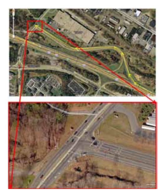
Figure 1: Case 15 Scene Overview

One incident (Case 15) turned out to be entrapment of an accelerator pedal by an all weather floor mat. This case was reported to NHTSA by an insurance company and involved a 2007 Lexus ES350 that was on an interstate highway approaching a long exit ramp (Figure 1). According to the driver, some jockeying for position was necessary that included a passing maneuver (accelerator application). The driver further indicated that after releasing the accelerator at the end of the passing