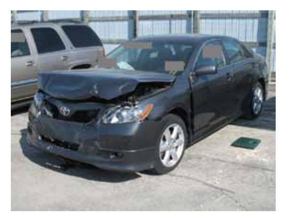
Figure 4: Case 30 Subject Vehicle

Case 30 involved a 2007 Camry operated by a female in her fifties striking vehicles stopped in traffic ahead of her during the first half of 2010. The incident took place during daylight hours on a local road with a posted speed limit of 25 mph and on an ascending grade. The driver reported depressing the brake to decelerate and feeling the vehicle accelerate. She reported pressing the pedal harder, causing the Camry to accelerate harder and then strike vehicles stopped ahead of her. The impact was strong enough