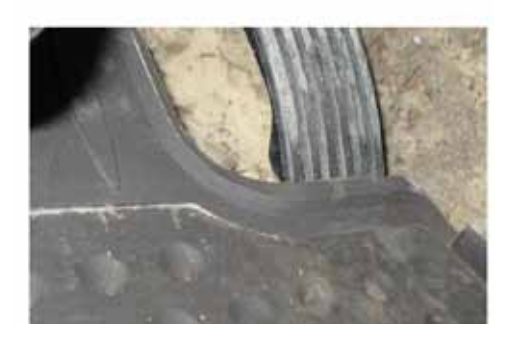
It was possible to recreate the confined accelerator pedal. Figure 2: Case 15 Floor Mats Examination of the vehicle showed no other indications of accelerator pedal, throttle body restriction or malfunction. Electronic outputs from the brake light switch and accelerator pedal were verified as within range.