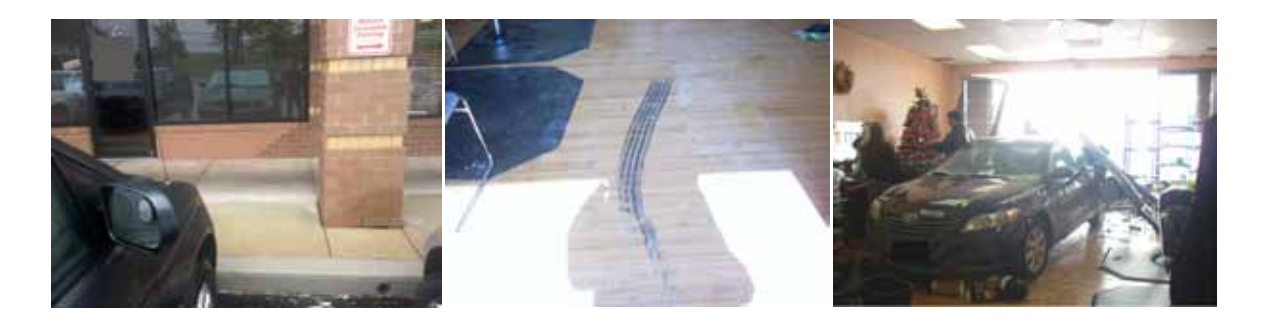
Figure 3: Case 33 Incident Scene

The vehicle had received normal maintenance throughout its service life and had accumulated approximately 14,000 miles at the time of the incident. Neither the driver nor the vehicle's service history indicated prior engine control or brake concerns with the vehicle and it did not appear to have been involved in any prior crashes. Physical examination of the vehicle shortly after the incident showed no apparent concerns with the brakes, throttle, or accelerator pedal.