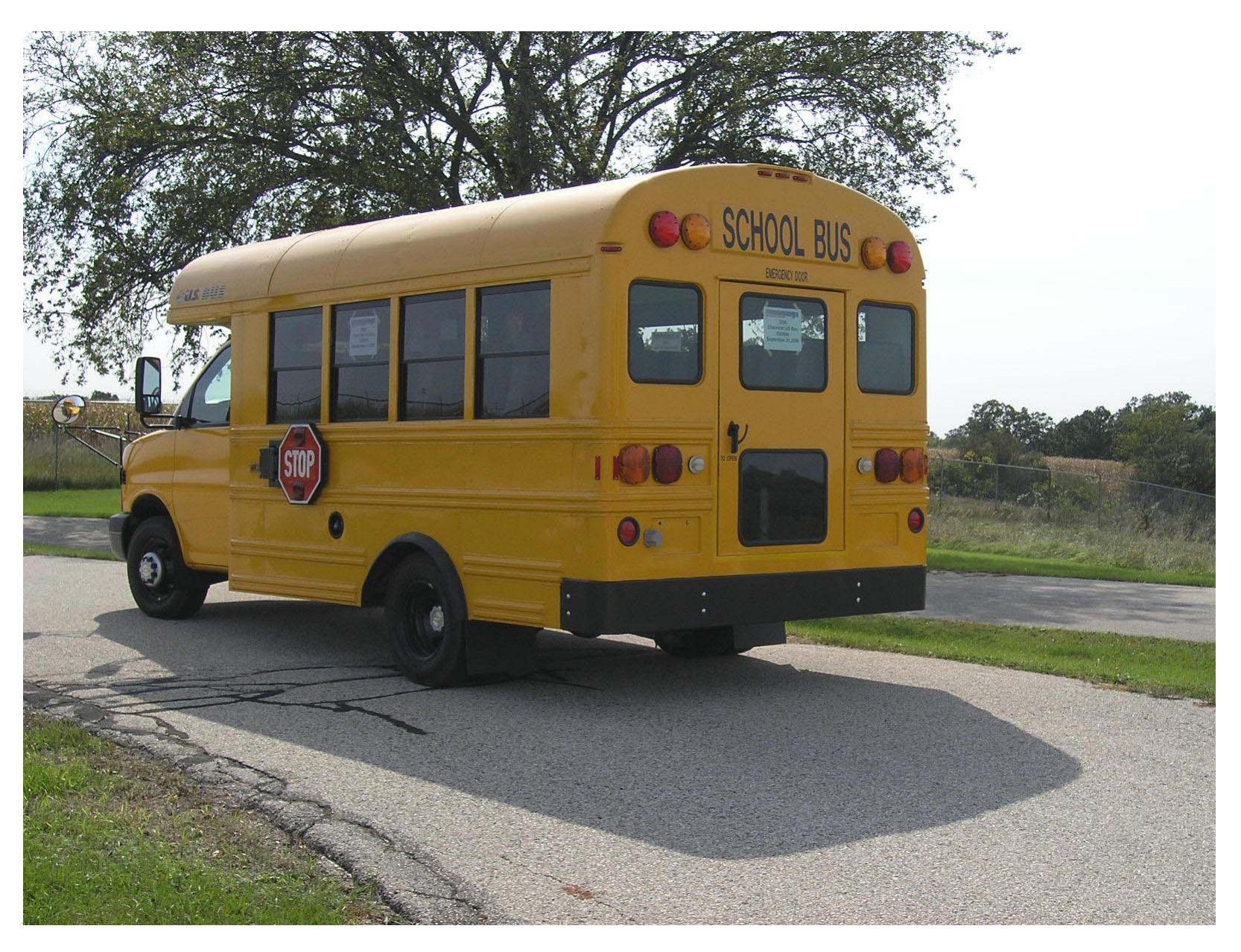
Three-Quarter Rear View of Left Side of Vehicle