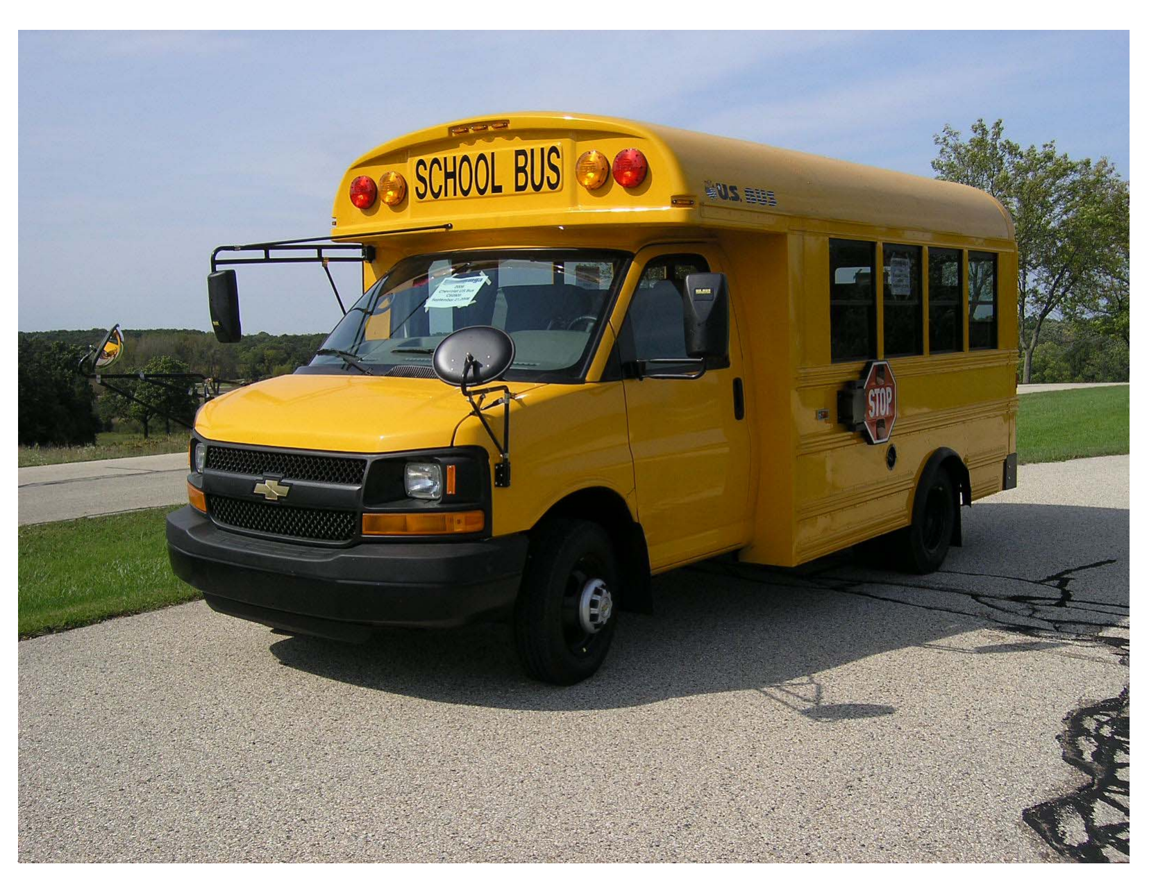
Three-Quarter Frontal View of Left Side of Vehicle