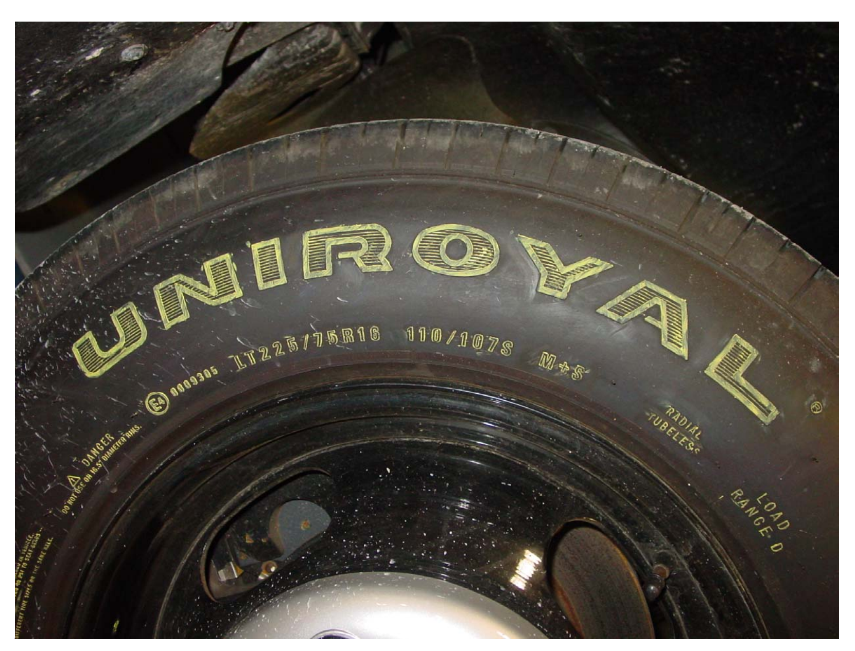
Right Front Tire Manufacturer