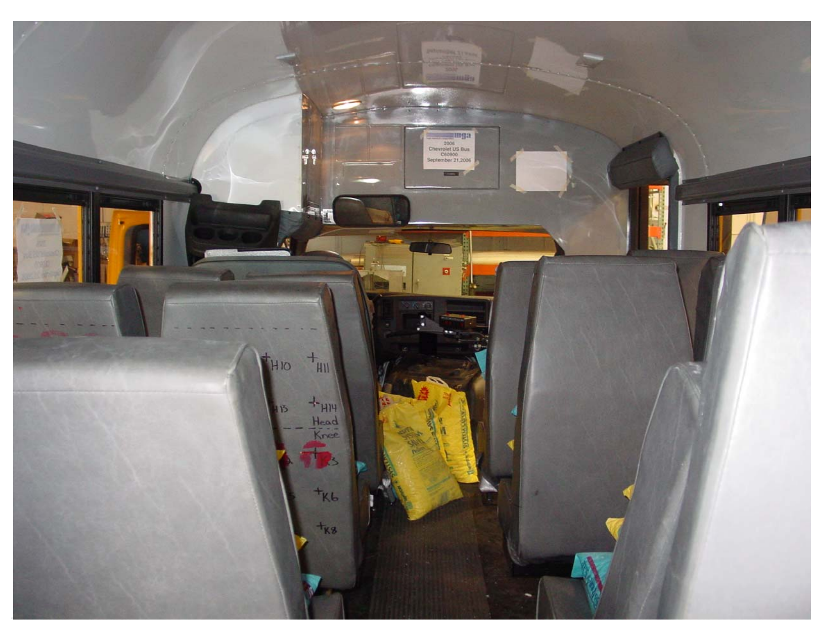
Simulated Cargo Loading