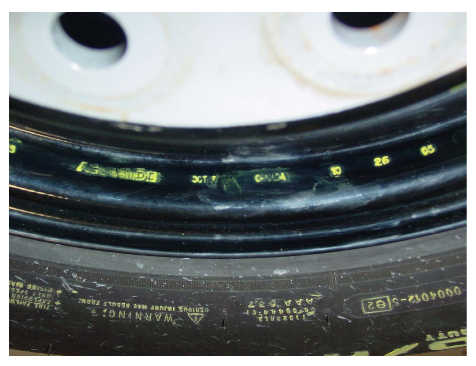
DOT, Source of Published Information, and Date of Manufacture Markings