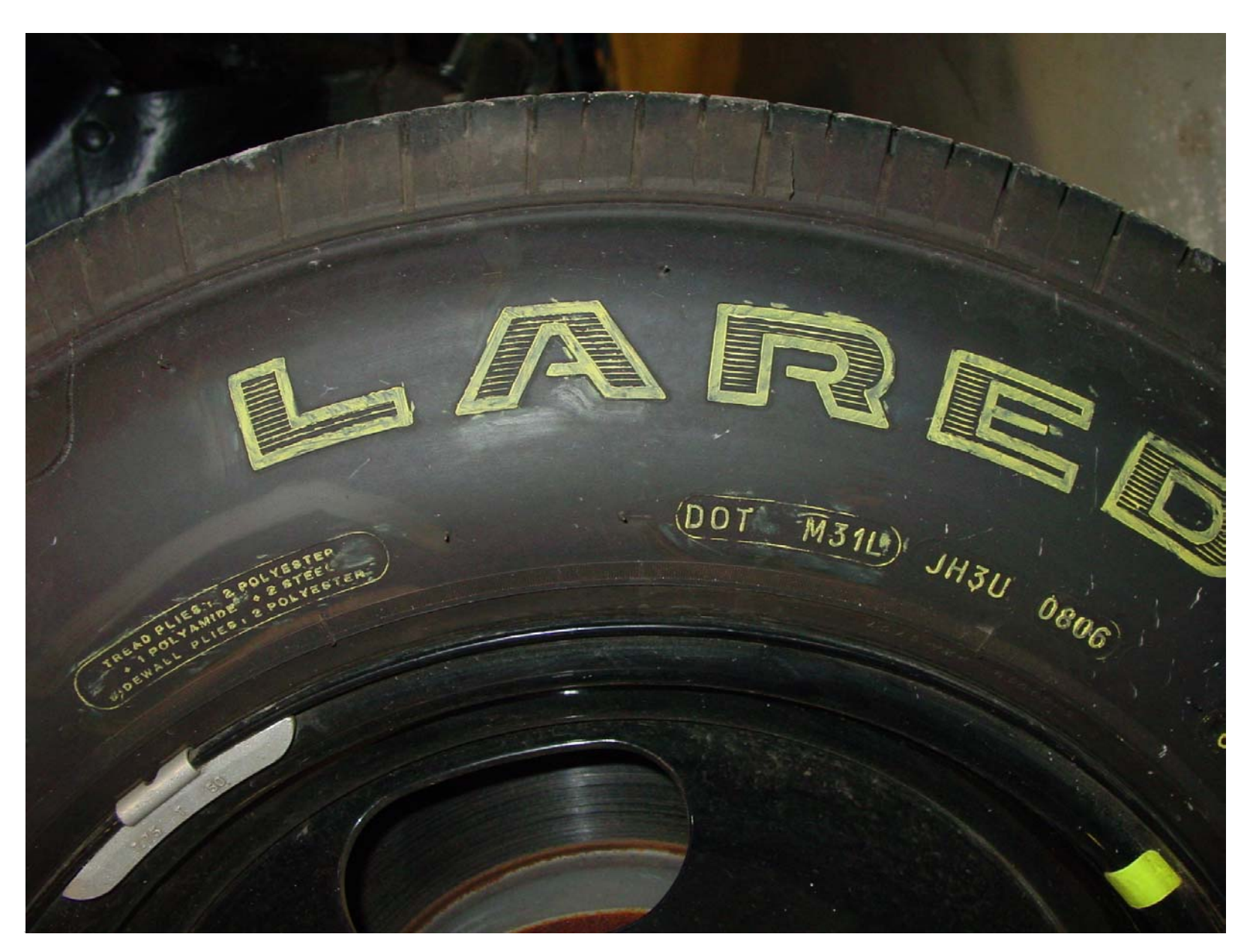
Right Front Tire DOT Serial Number