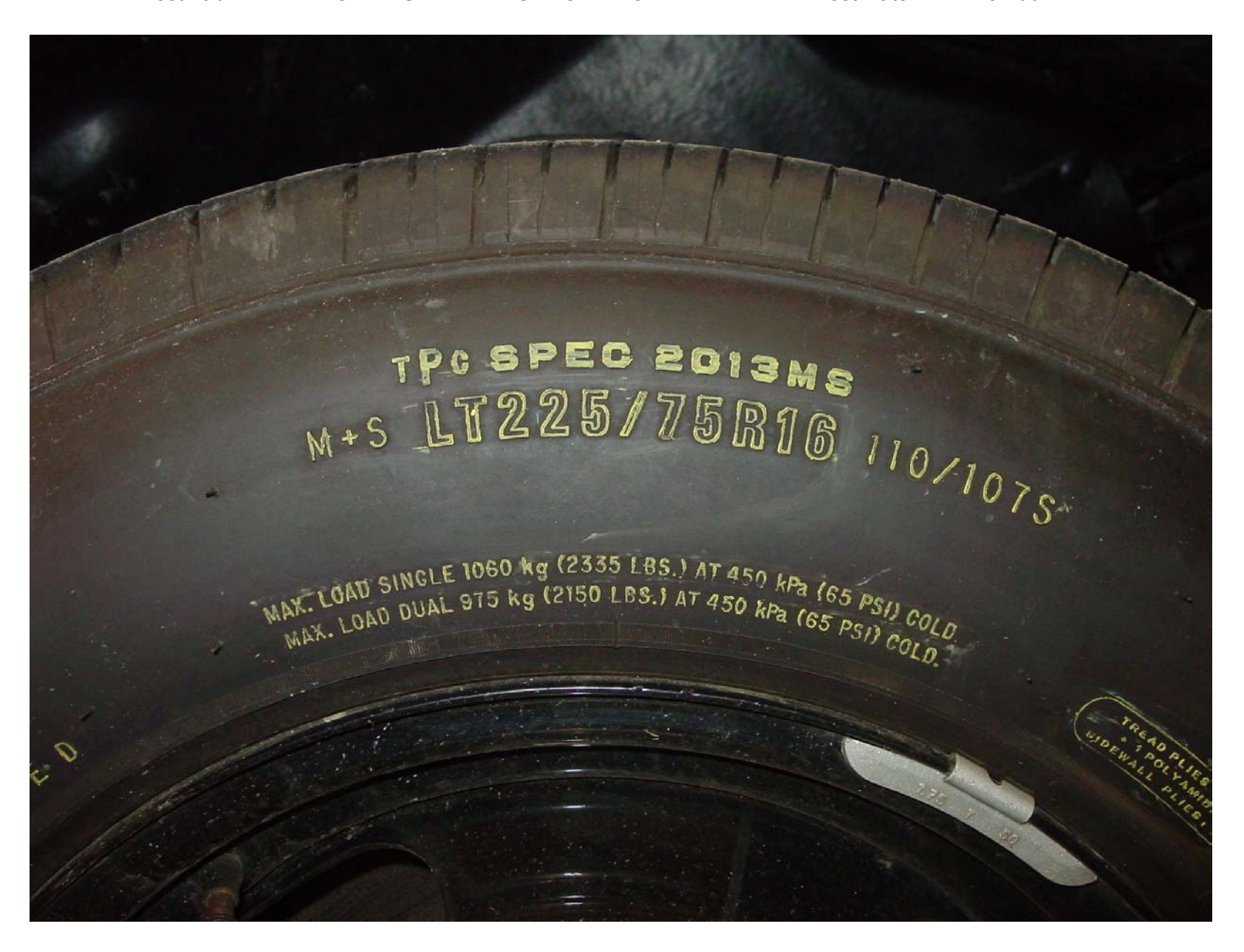
Right Front Tire Load Ratings