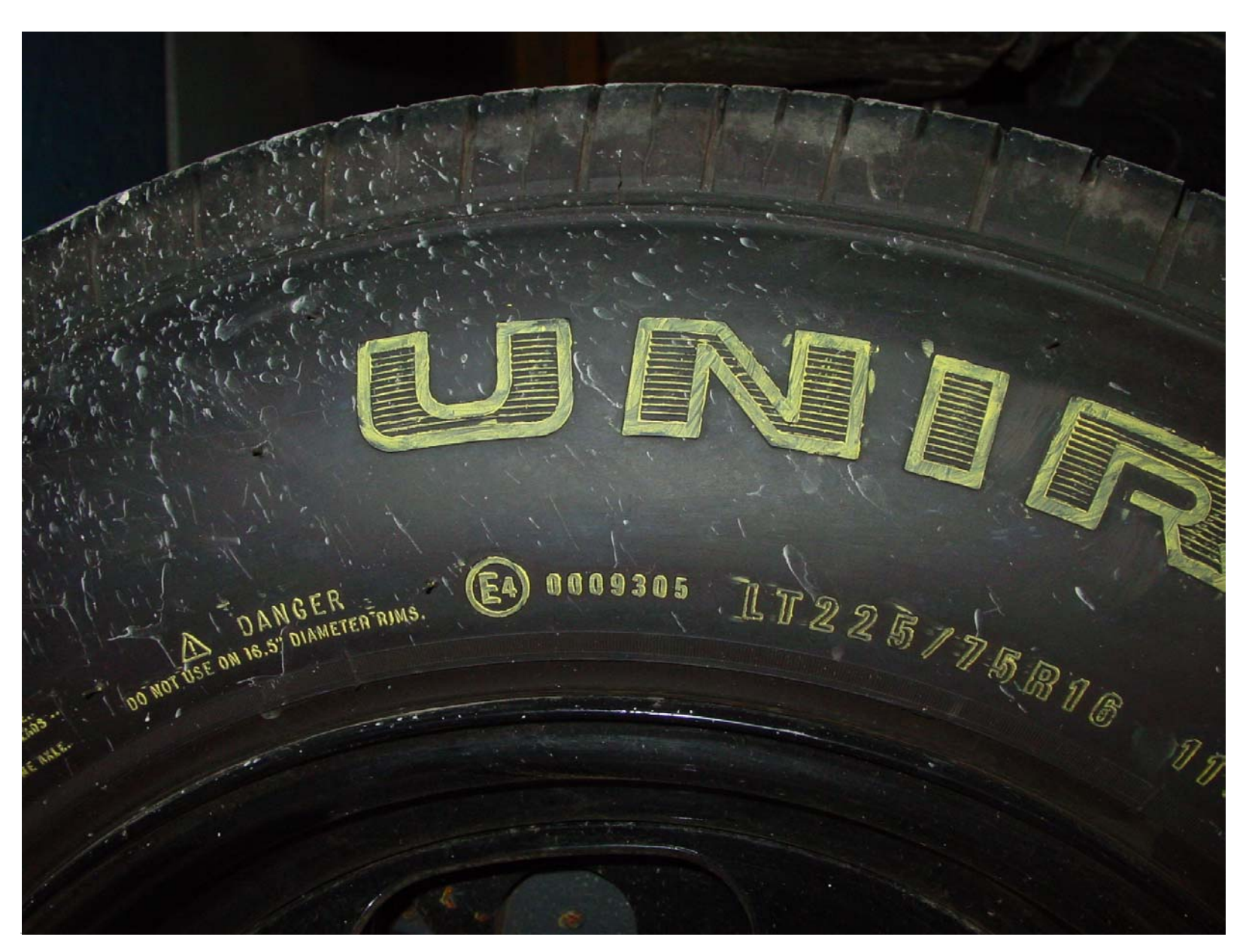
Right Front Tire Size Designation