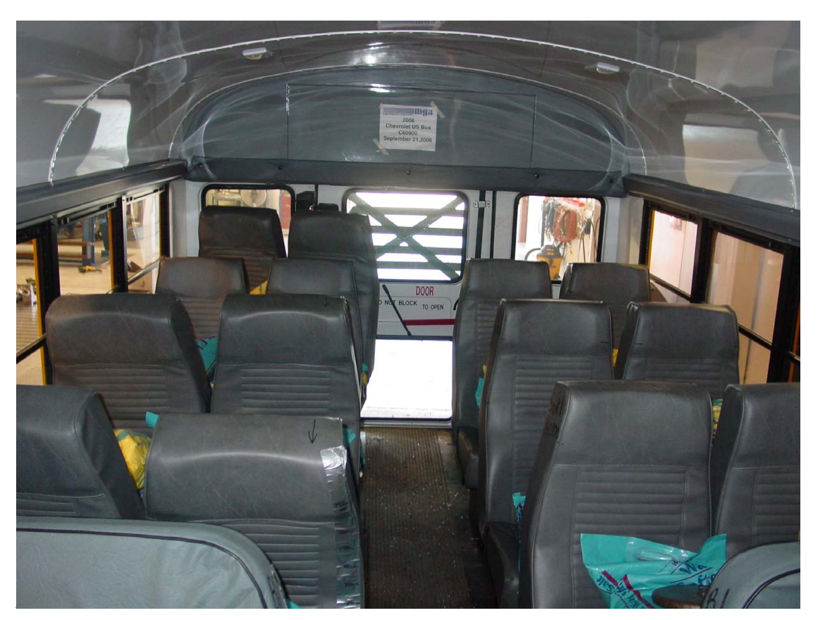
Simulated Occupant Loading