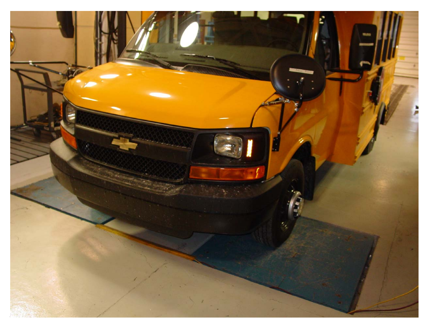
Vehicle on Scales Doing Measurement of Front Axle Loads