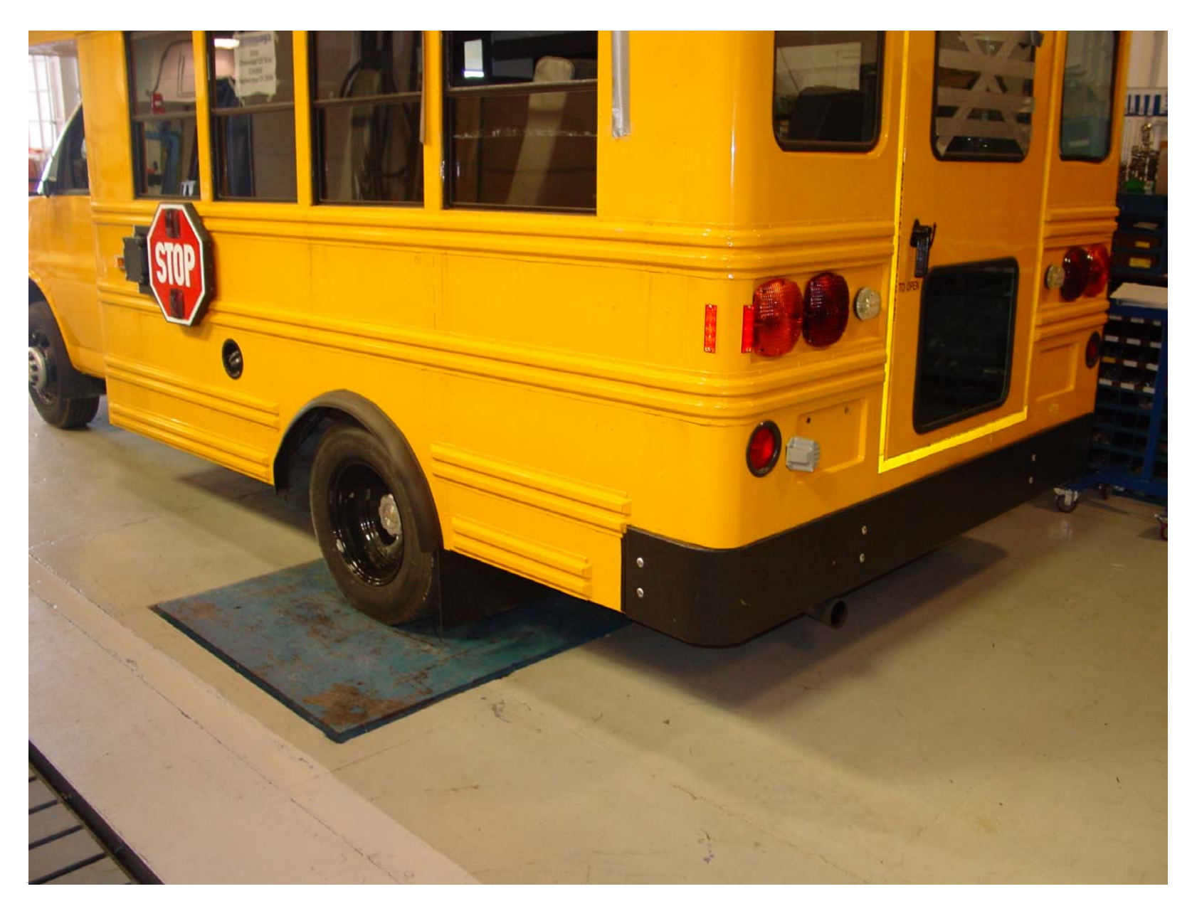
Vehicle on Scales Doing Measurement of Rear Axle Loads