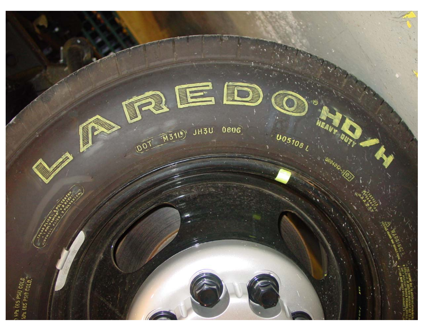
Right Front Tire Model Number