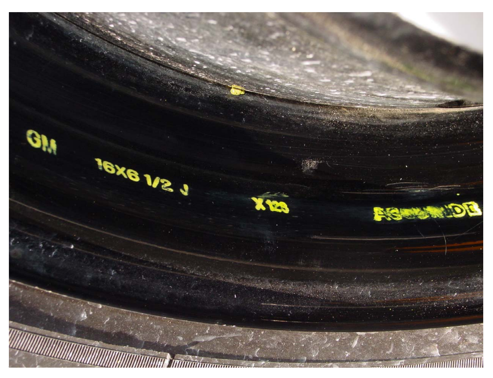
Right Front Rim Manufacturer