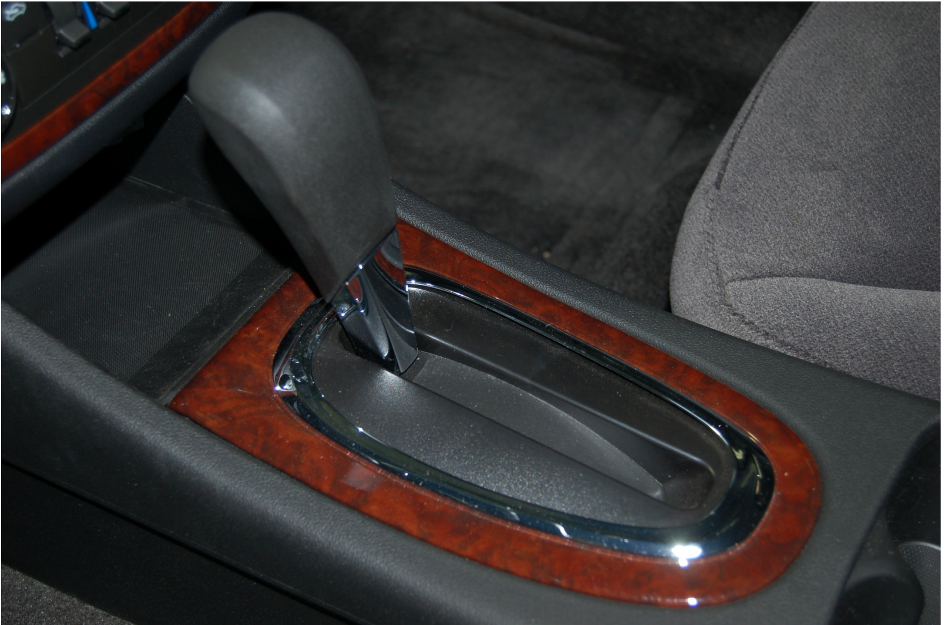
2009 CHEVROLET IMPALA LS NHTSA NO. C90100 FMVSS NO. 114