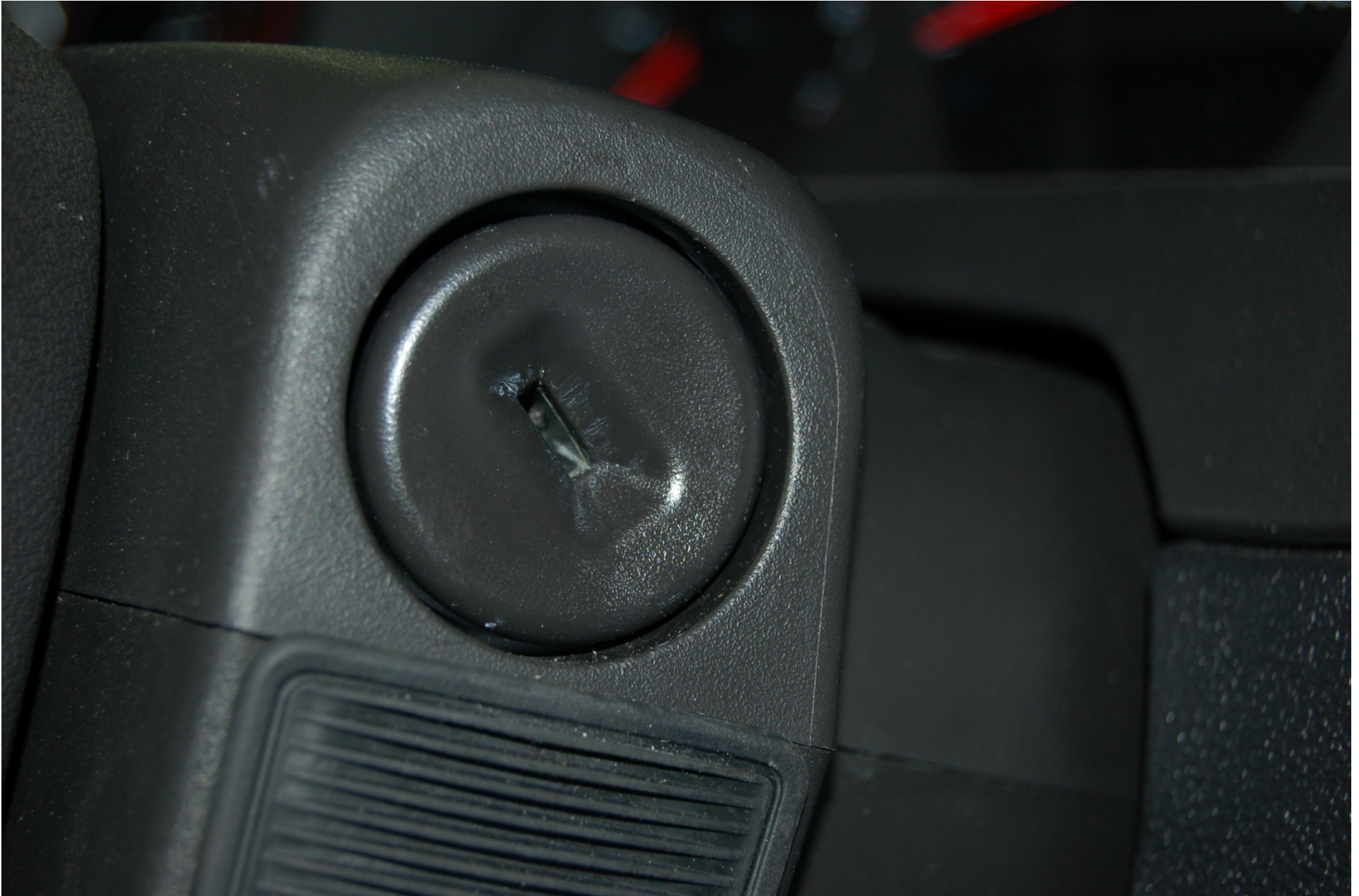
2009 CHEVROLET IMPALA LS NHTSA NO. C90100 FMVSS NO. 114