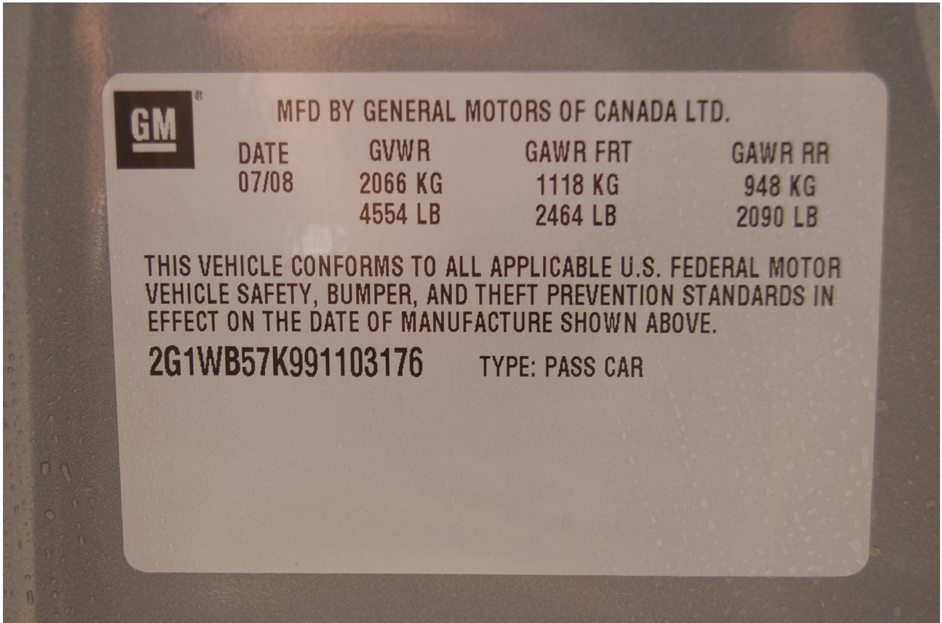
2009 CHEVROLET IMPALA LS NHTSA NO. C90100 FMVSS NO. 114