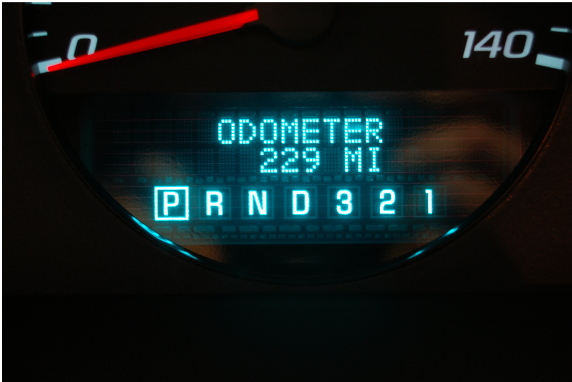
2009 CHEVROLET IMPALA LS NHTSA NO. C90100 FMVSS NO. 114