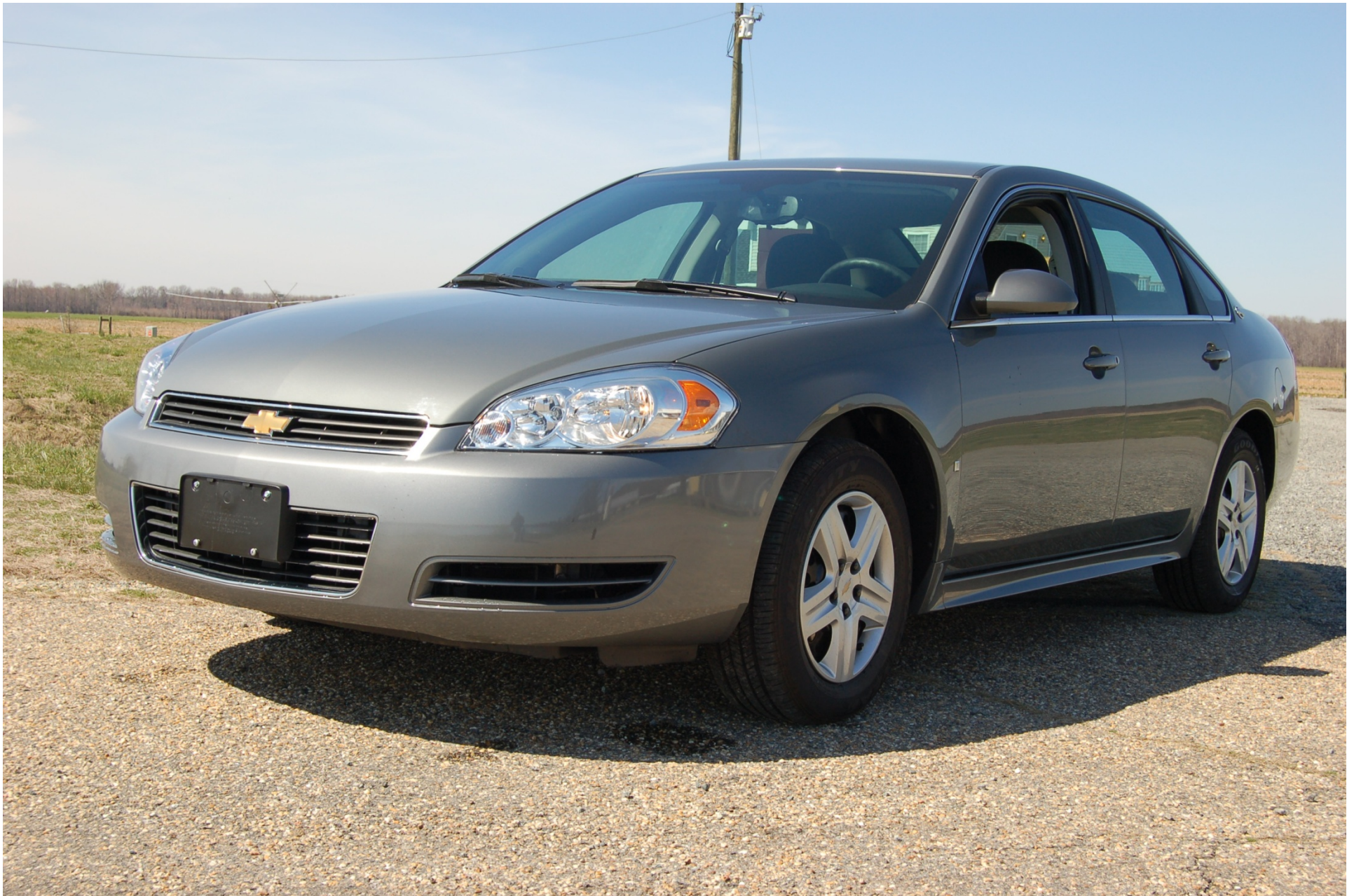
2009 CHEVROLET IMPALA LS NHTSA NO. C90100 FMVSS NO. 114