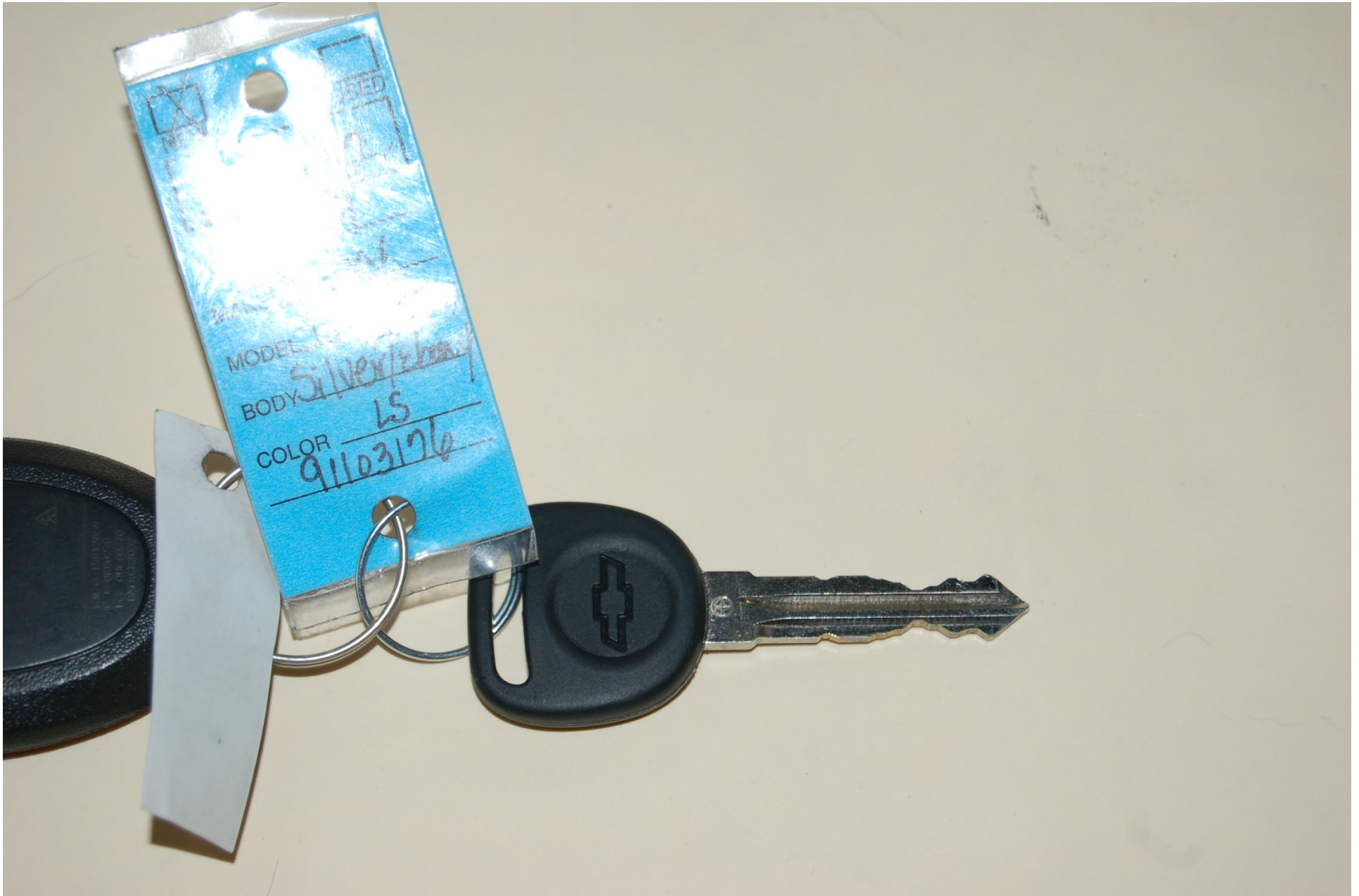
2009 CHEVROLET IMPALA LS NHTSA NO. C90100 FMVSS NO. 114