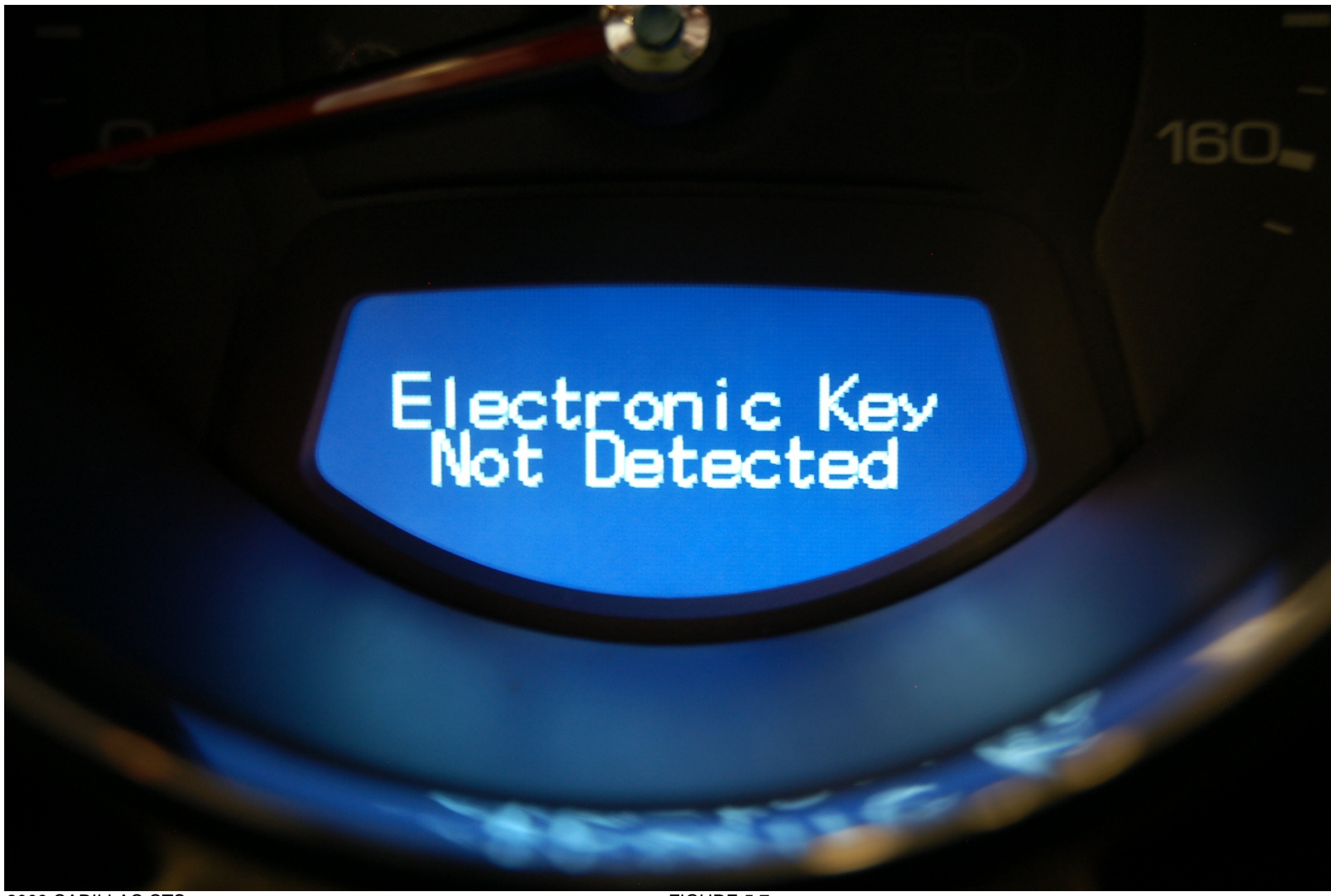
FIGURE 5.7 ELECTRONIC DISPLAY WITH KEY REMOVED