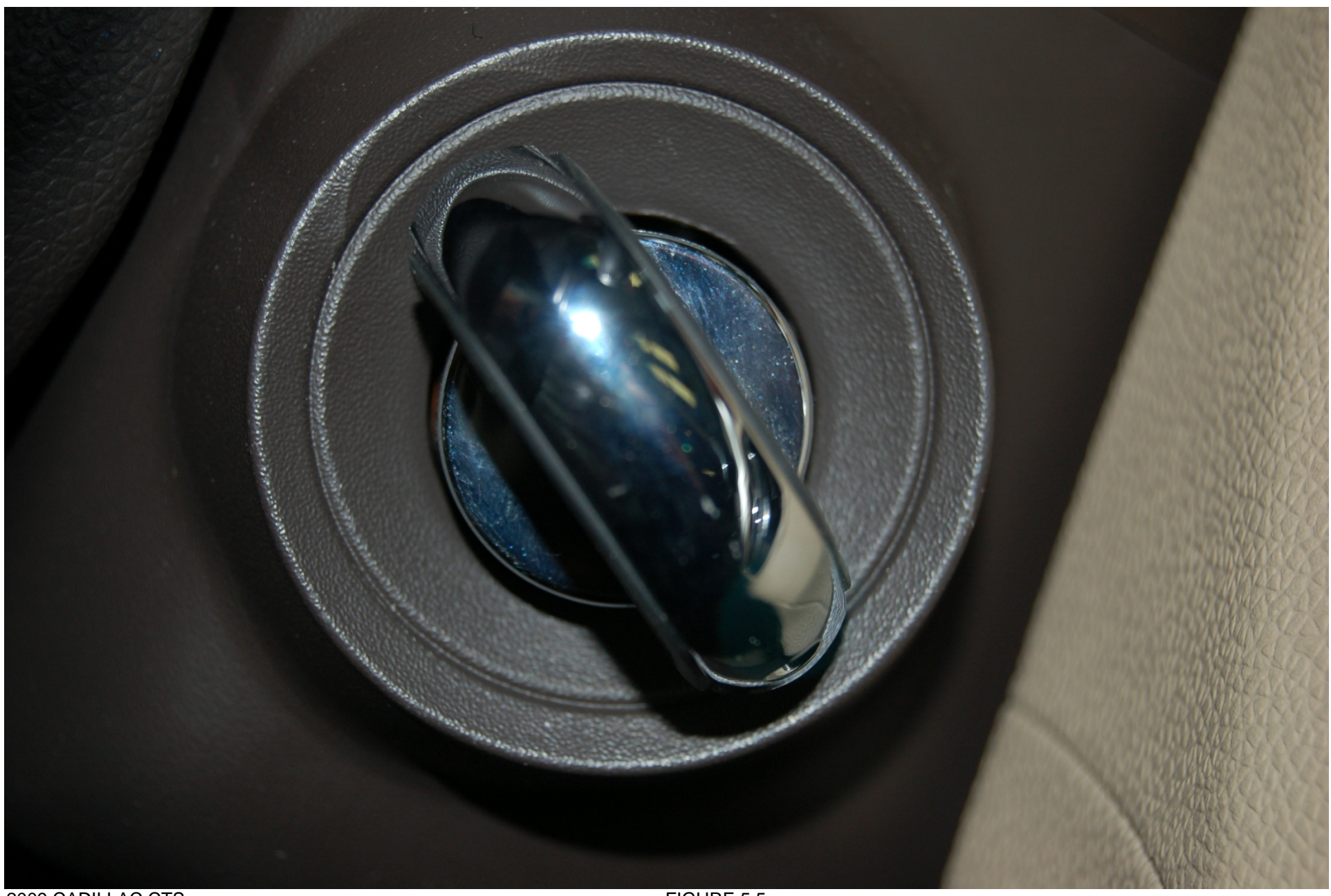
FIGURE 5.5 STARTING SYSTEM CONTROL