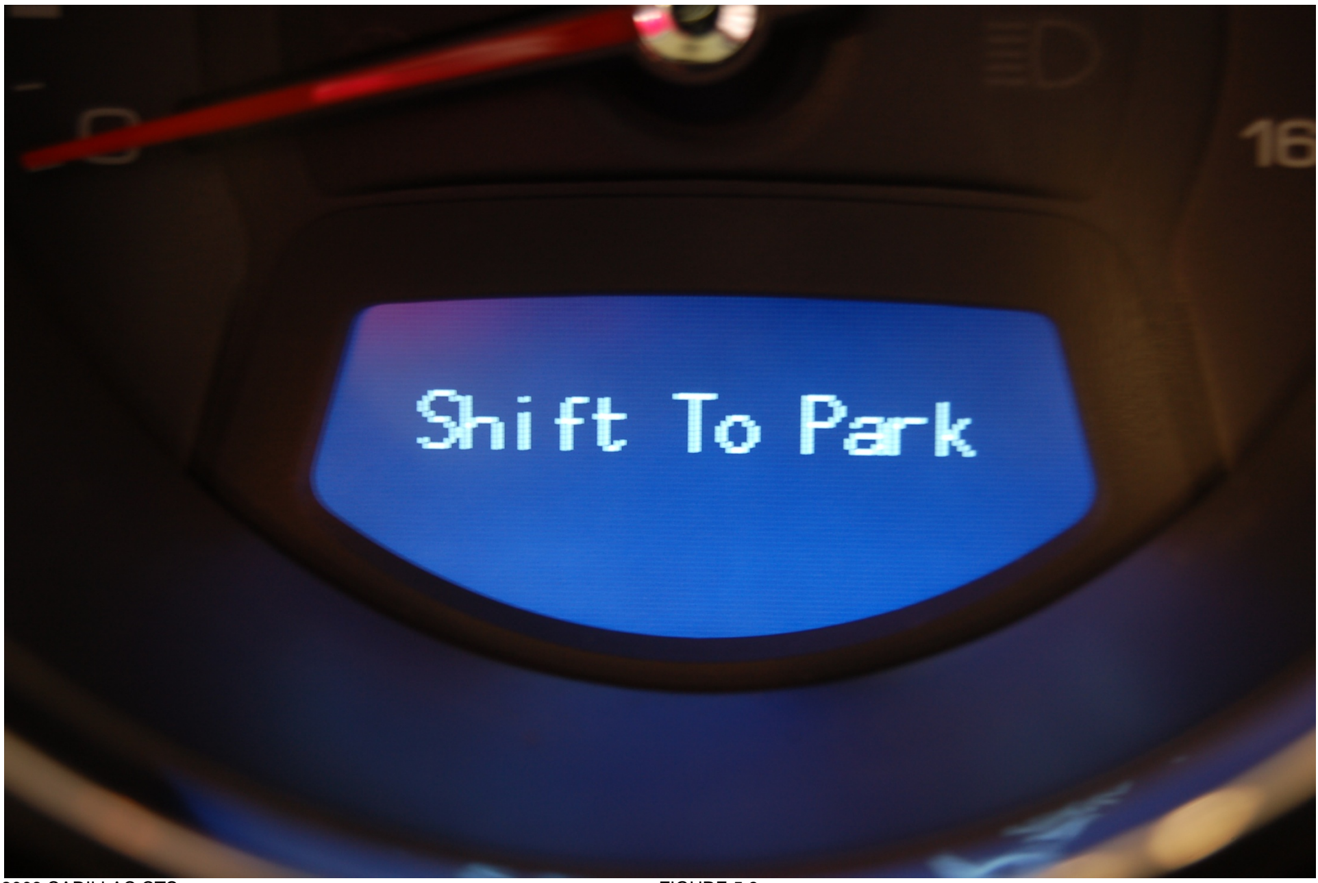
FIGURE 5.8 ELECTRONIC DISPLAY WITH ENGINE OFF AND GEAR SELECTOR OUT OF PARK