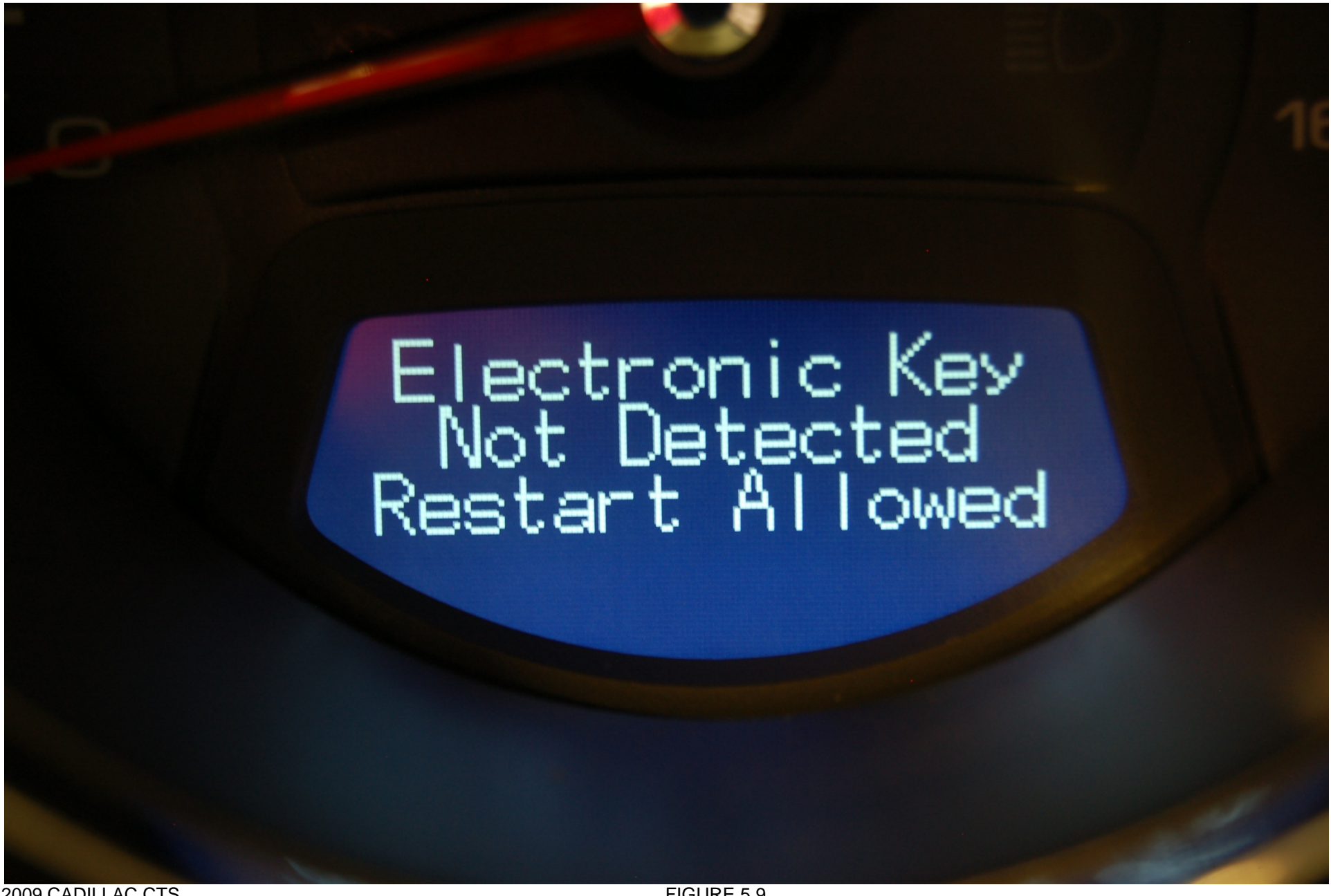
FIGURE 5.9 ELECTRONIC DISPLAY WITH KEY REMOVED FROM VEHICLE WHILE RUNNING