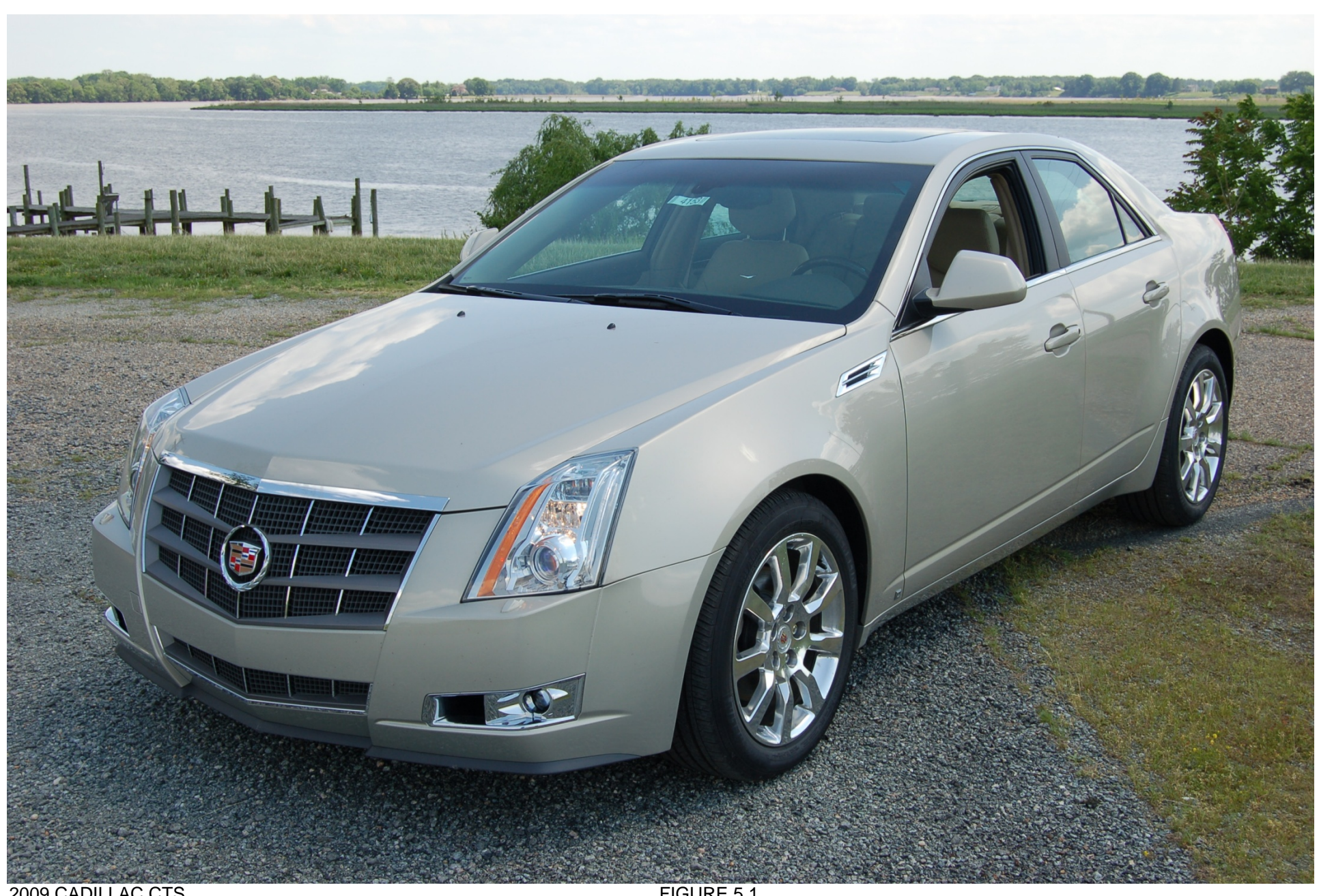
FIGURE 5.1 3/4 FRONTAL VIEW FROM LEFT SIDE OF VEHICLE