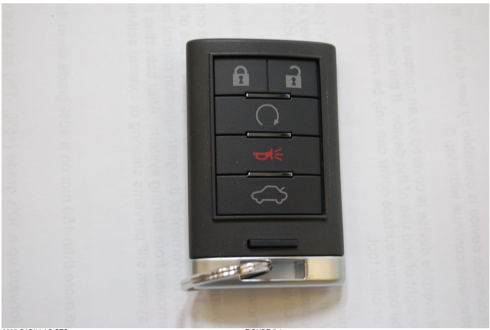
FIGURE 5.4 CLOSE-UP VIEW OF IGNITION KEY