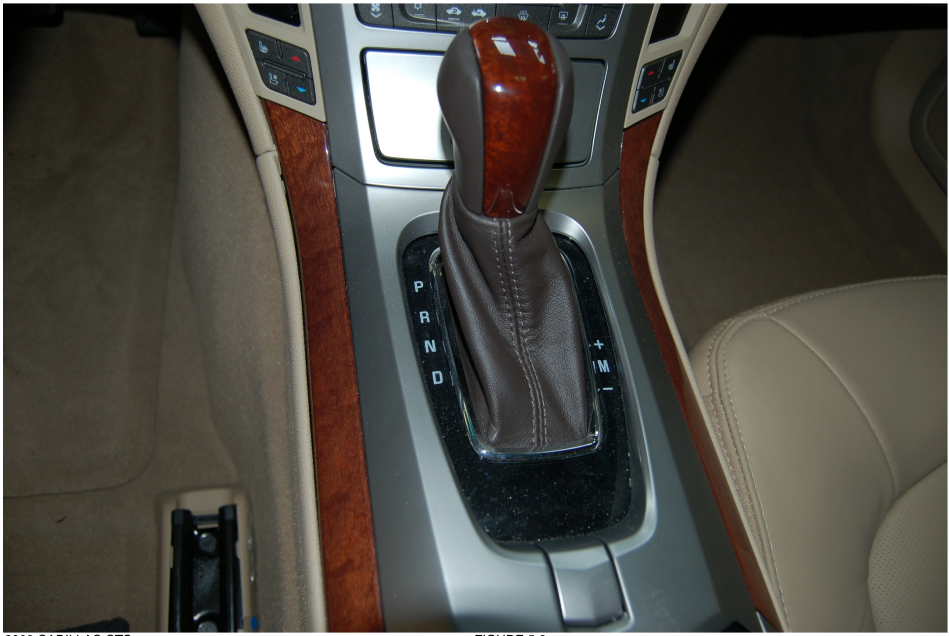
FIGURE 5.6 TRANSMISSION GEAR SELECTION CONTROL