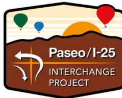
Paseo Del Norte/I-25 Interchange RECONSTRUCTION PROJECT