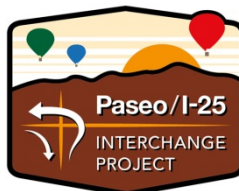
Paseo Del Norte/I-25 Interchange RECONSTRUCTION PROJECT