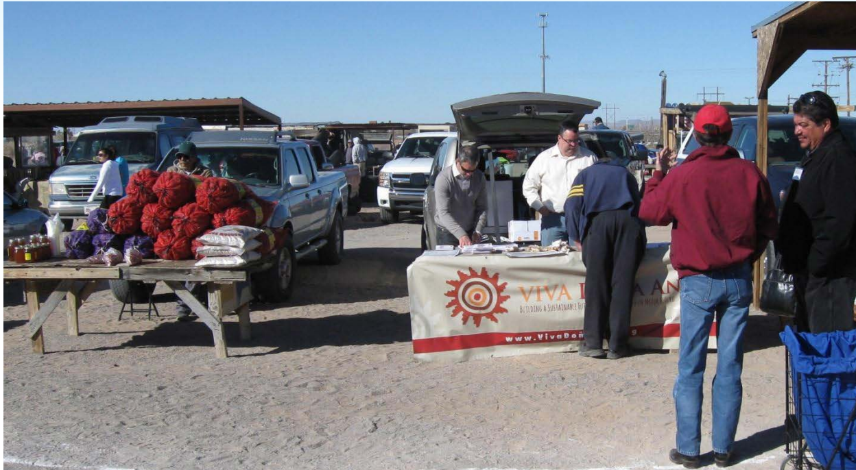
Figure 8: The Viva Dona Ana team set up mobile workshops at a variety of locations throughout the county, including an outdoor market.