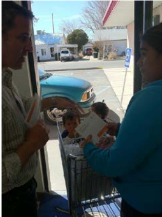
Figure 6: Residents voiced their opinions at mobile workshops.

An ongoing challenge in the transportation community is how to engage the public, obtain feedback, and incorporate responses into planning documents. Dona Ana County, located in southern New Mexico, has an innovative method for educating the public about livability principles and soliciting feedback from residents who are not typically involved in the planning process. Through a series of mobile workshops, the Viva Dona Ana team met with approximately 250 people to discuss issues such as jobs, housing, education, and transportation.