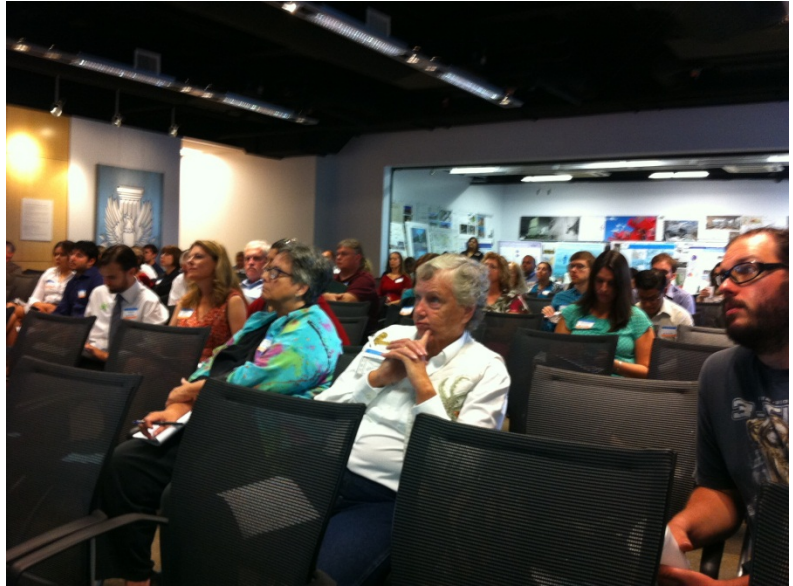
Figure 5: Participants at the Alamo Region Livability Summit.

The Pearl Development, the site of the summit, is itself an architectural and planning showpiece, with Leadership in Energy and Environmental Design (LEED) -certified buildings and adaptive reuse of historic buildings visible throughout the development. Trendy restaurants, coffee shops, and antique stores now dot the walkable landscape that was once a bustling downtown brew house and distribution facility established in the 1880s during the horse and buggy days. The Pearl Development is also famous for its farmer's market, which showcases locally grown fresh fruits and vegetables. For additional information regarding the Alamo Region Livability Summit, please contact Kirk Fauver of the FHWA Texas Division at (512) 536-5952 or by e-mail at kirk.fauver@dot.gov . For more information about the Pearl Development, please visit http://atpearl.com/ .