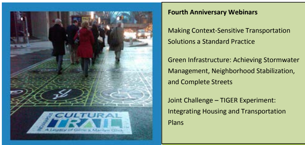
Figure 3: Synopsis of PSC webinars conducted in July 2013.

In July, the PSC hosted a webinar series about three of the topics on which EPA, HUD, and DOT offer support: investing in green infrastructure, creating context-sensitive streets, and integrating housing and transportation planning. Figure 3 provides a snapshot of the three PSC webinars.