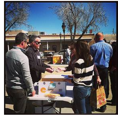
Figure 7: The Viva Dona Ana team distributes materials at a mobile workshop.

funding for the Viva Dona Ana Initiative. The mobile workshops focused on the Comprehensive and Corridor Plans and included distribution of printed materials and conversations with residents about the planning efforts. A complete summary of the feedback received can be found at www.vivadonaana.org/mobileworkshops . Many of the comments focused on jobs; the need for more transportation options, particularly in the rural areas; concerns about groundwater availability and water rights; and agriculture. Since the Viva Dona Ana project is still in the very early stages of development, it is yet to be determined how the comments received will be worked into the planning documents; however, this form of public outreach has proven to be effective in engaging residents.