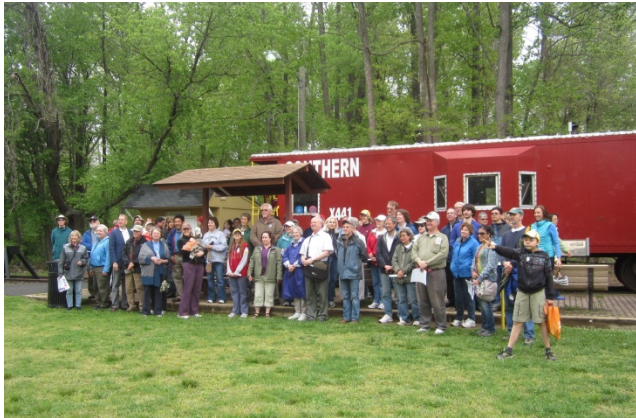
Figure 4: Walkers gather in front of the Bluemont Junction caboose, one of nine stops on the Bluemont/Bon Air Walk Friendly Community Walkabout, which debuted in April 2013.

In Cary, North Carolina, the town's Bronze-level WFC status helped spread awareness and support for its efforts to grow the pedestrian network in a connected and comprehensive manner. Last November, voters approved a transportation bond package that included $750,000 for sidewalk construction and funding for the development of a mobile application that will make Cary's "hike and bike" map more user friendly.