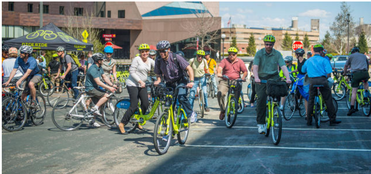
Figure 2: Midwest Regional Bicycle Safety Summit attendees try NiceRide bicycle share on a guided tour of innovative bicycle facilities.

The work to improve bicycle safety is part of a long-term effort to change the culture of American roadways, to recognize that bicycling is an important part of expanding capacity—particularly on constrained urban streets—and that roads must be designed and managed in a way that accommodates nonmotorized transportation uses.