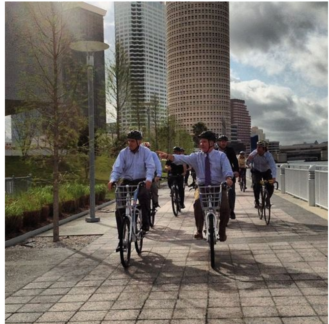
Figure 1: Secretary Ray LaHood tours the TIGER-funded Tampa Riverwalk project with Mayor Bob Buckhorn.

The Regional Bicycle Safety Summits reaffirmed the importance of bicycle safety and highlighted the need to better communicate the flexibilities that are already available under current design regulations and guidelines, as described on page 12. Discussions in both Minneapolis and Tampa also identified certain gaps in the design guidance, such as intersections that include vehicular, streetcar, and bicycle modes.