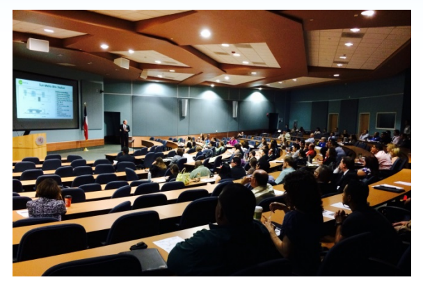
Figure 4: Photo of the El Paso Livability Summit at the TecH20 Center

Other participants included the city of El Paso, Sun Metro regional transit authority, University of Texas–El Paso researchers and students, Texas Transportation Institute at Texas A&M, private consultants, bicycle and pedestrian advocates, the Regional Mobility Authority for El Paso, Housing Authority of the City of El Paso, and the Chihuahan Desert Chapter of the U.S. Green Building Council.