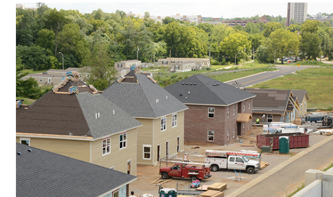
Figure 3: Construction of housing in Davis Park

The most important element of the redevelopment plan is the Community Land Trust (CLT). An evaluation team concluded that a CLT land stewardship model was the best way to ensure