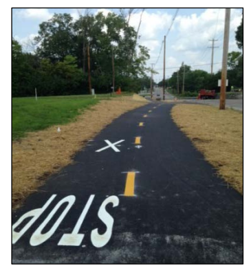
Figure 5: Walking trail.

Township. In 2015, the township will have exercise stations and benches added to the trail, and the exercise stations will be incorporated into Springfield Township students' physical education classes.