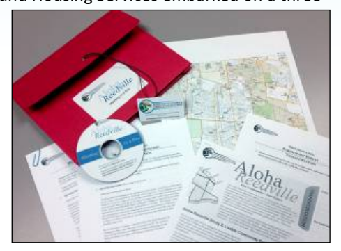
Figure 7: Materials from meeting in a box.

The population in the Aloha-Reedville region, which totals more than 50,000 residents, is younger, earns less, has a higher poverty rate, and is more costburdened for housing and transportation on average than the rest of the county. To address these trends, the study focused on strategies that would enhance and improve housing conditions, redevelopment opportunities (both public and private), and transportation facilities.