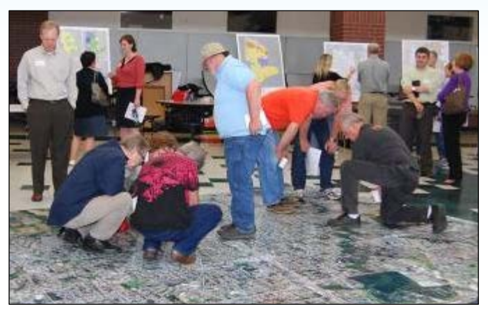
Figure 10: Community members discuss plans using a study area floor map.

The planning effort placed a great deal of emphasis on involvement by historically underrepresented communities. The <u>Center for Intercultural Organizing</u> (CIO), a regional advocacy firm, created a cohort of nonprofits that serve many immigrants and communities of color in the county and region. The cohort, called <u>Aloha</u> <u>Unite</u>, comprised five nonprofits that contacted more than 1,200 community members and collected more than 600 surveys. The work of CIO and Aloha Unite provided county organizations, including recently elected leadership, insight into the perspectives of traditionally underrepresented communities.