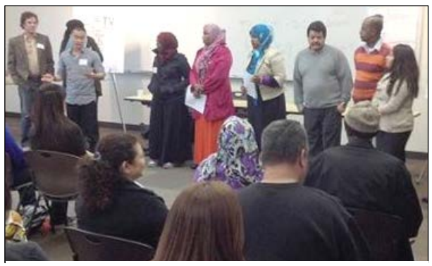
Figure 11: Aloha Unite meeting presentation.

The CAC and community members ensured the benefits and burdens of the study's final recommendations were shared equitably, to the extent possible. The project team coordinated project outcomes with other local, county-wide, and regional planning efforts by communicating, planning, and implementing efforts together. The result is a final plan that describes the goals,