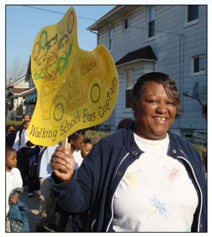
Figure 6: Walking school bus at Louisa May Alcott Elementary School in Cleveland.

The <u>Creating Healthy Communities Program</u> (CHC) at ODH funds active living strategies to increase physical activity and reduce the risk of chronic disease for Ohioans in 23 counties. These strategies include HIAs, Safe Routes to School, multiuse trails, active transportation plans, and Complete Streets policy development. The Summit County CHC program, for example, partnered with local transportation officials and the school district to install a community walking trail in Springfield