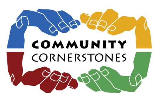
Figure 4: Community Cornerstones logo.

Inclusive and culturally competent engagement forms the foundation for strong lines of communication and trust between the program's institutional partners and historically underrepresented communities. Trusted leaders in these communities engaged with their constituents to form the Multicultural Coalition, which is comprised of twelve immigrant- and refugeeserving community organizations. The Coalition is planning for a shared multi-cultural center. Over 700 participants engaged in five large community events in nine different languages to plan for the <u>multicultural center</u>. The coalition is committed to staying together to formalize its structure and to share programming, resources, and space.