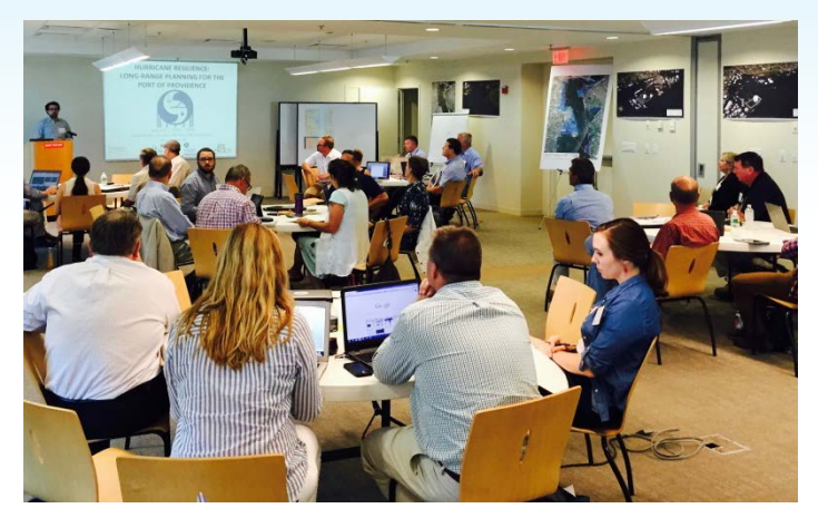
Figure 9: Private, industrial, governmental, and environmental stakeholders listened to presentations at the August 2015 workshop.

economic benefits for the region and over 2,400 jobs were attributed to port activities. Hurricanes pose a significant threat to these areas, along with the