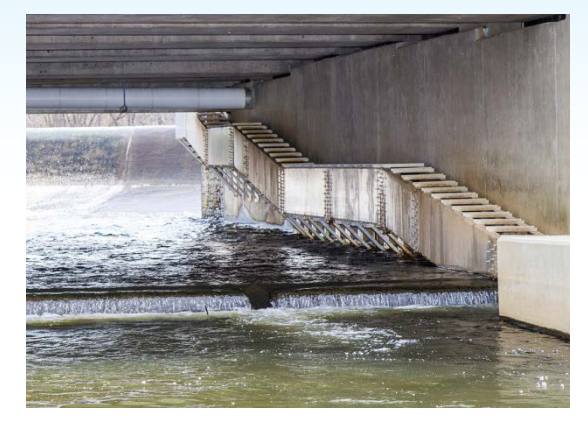
Figure 2: Prior to Tropical Storm Irene, fish could not properly migrate upstream. The US 322 Bridge Project provided NJDOT with an opportunity to correct this design error.

While the dam created fishing opportunities prior to Irene, it also prevented the migration of certain fish species. The project corrected this longstanding deficiency by including a fish ladder designed in coordination with the New Jersey Department of Environmental Protection (NJDEP) Division of Fish and Wildlife. Previously, there was no space to cast a fishing line from the old bridge; now there are ramps extending from the sidewalk to the edges of the spillway.