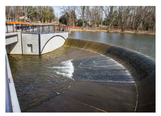
Figure 1: The newly designed bridge, dam, and spillway provide safety and resiliency while allowing for new recreational opportunities for local residents.

Flood waters from Irene overtopped the bridge and severely damaged the dam and spillway that create Mullica Hill Pond, spurring an $8.1-million investment by the Federal Highway Administration in the US 322 Bridge/Mullica Hill Pond Dam over Raccoon Creek project (US 322 Bridge Project). Following the storm, engineers determined the aging bridge to be structurally deficient, requiring imminent replacement. A full replacement allowed the New Jersey Department of Transportation (NJDOT) to address not only structural issues, but also potential safety issues, longstanding environmental concerns, and new or improved recreational opportunities.