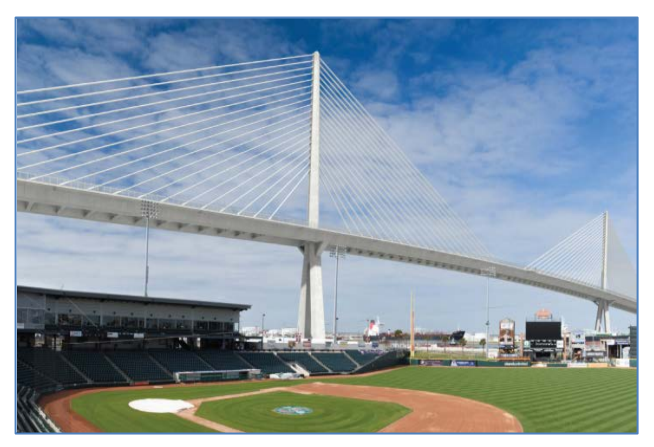
Figure 10: Rendering of the new sustainable Harbor Bridge Replacement in Corpus Christi, Texas.

On June 24, 2015, the Federal Highway Administration (FHWA) Texas Division hosted an interagency meeting at the Central Texas Council of Governments (CTCOG) in Belton, Texas, in conjunction with the Region 6 staff from the <u>Interagency</u> <u>Partnership for Sustainable Communities</u> (PSC). The purpose of this interagency meeting was to engage Federal, State, and local metropolitan planning organization (MPO) agencies involved in livability and sustainability programs and projects within Texas and the surrounding Region 6 areas.