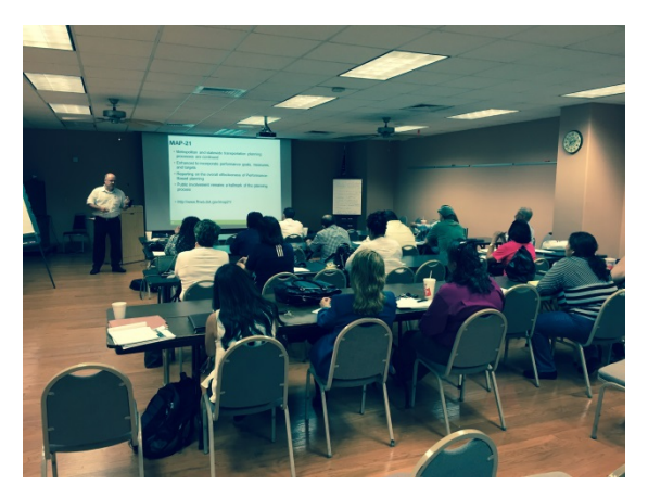
Figure 13: Participants at the August FHWA Texas Division Livability Workshop learned how to better align transportation, housing, and environmental goals to meet community needs.

Participants also included private businesses, university representatives, and transportation consultants. Presentations from EPA, HUD, DOL, and FTA, focused on the PSC and intergovernmental efforts to better align livability goals with the transportation, housing, and environmental needs of communities in the Laredo region. The course garnered several hours of continuing maintenance credits for certified planners affiliated with the American Institute for Community Planners through the American Planning Association.