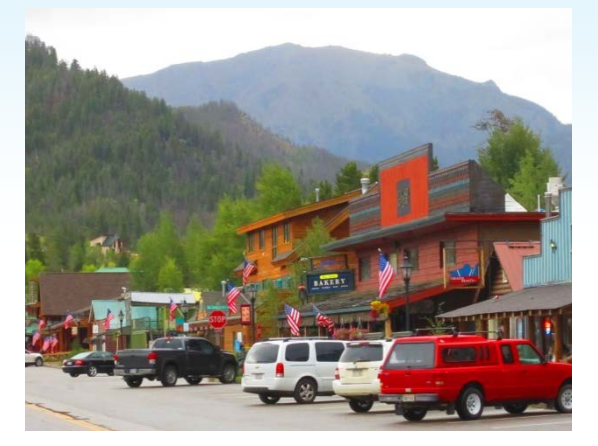
Figure 6: Though a hub for summer tourists, Grand Lake has less than 500 full-time residents. The Federal Lands Livability Initiative helped the town find ways to expand its off-season economy.

Readiness is a key to success . The process of improving livability requires willing partners. Communities and public land agencies identified common interests for moving forward and engaged others who were also champions of these interests. To start and sustain livability efforts, stakeholders must be willing and ready to contribute.