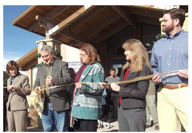
Figure 3: Former Colorado Governor Bill Ritter ties a ribbon during the dedication of the city of Monte Vista's SMSI. The ribbon tying, rather than cutting, symbolized the planning and funding partnerships among CDOT, DOLA, and the city.

To ensure the city's objectives were being met, CDOT engaged the community in a creative design process. US Highway 160 served as Monte Vista's main street, so the city wanted to slow down traffic, widen sidewalks, and preserve some on-street, storefront parking to revitalize the downtown area. To achieve this, CDOT completed the following: