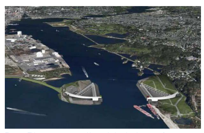
Figure 8: This computer-generated image depicts the placement of a new hurricane barrier design concept that would protect the Port of Providence from a 21-foot storm surge.

In Providence, Rhode Island, researchers from the University of Rhode Island (URI) are partnering with FHWA and State and local officials to develop new methods for assessing storm resilience and vulnerability of coastal infrastructure. Sea-level rise and higher storm surges, due to increasing storm intensity and frequency, threaten the sustainability of maritime transportation infrastructure in coastal areas. In Rhode Island, major storms impacting the State's maritime infrastructure damage the economy, the environment, and residents' quality of life. In the coming decades, tough decisions will need to be made about resilience investment measures, and a pilot project in the Port of Providence is exploring new ways to facilitate a dialogue around these challenging issues.