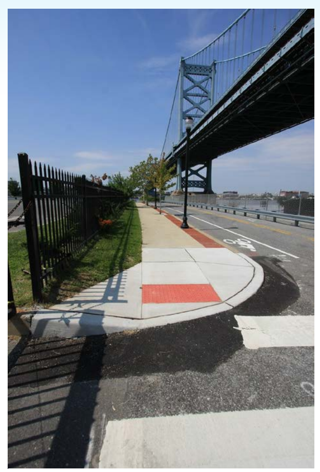
Figure 10: Streetscape improvements in the city of Camden.

Since project completion, economic recovery has continued in Camden with significant construction projects as companies like Campbell's Soup, Subaru, and American Water have relocated to the city. The Philadelphia 76ers basketball team training facility was also recently built in Camden. The streetscape improvements and trail connection project has been so successful that it received an award in 2014 from the American Council of Engineering Companies as a Distinguished Transportation Project.