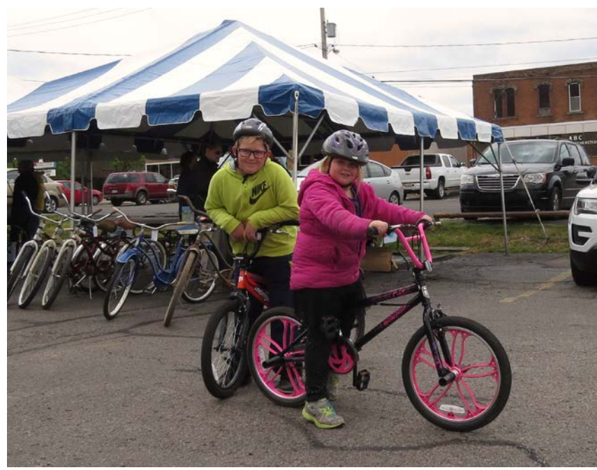
Figure 8: Children enjoying a recent Walkable Communities Coalition bicycle rally.

Due to its focus on supporting physical activity, the WCC was recently designated as the Active Living Health Action Team for the Health Improvement Organization. WCC partners work together to assist with planning and coordination of events focusing on physical activity and health. For example, the Step by Step social marketing campaign used collaborative grant funds to encourage area residents to be more active by using the local network of trails, with suggestions of scenic walking routes. Discussions at WCC meetings led to the creation of events at which the YMCA teaches stretching and warm-up exercises to prepare for sidewalk and walkway snow removal and hiking.