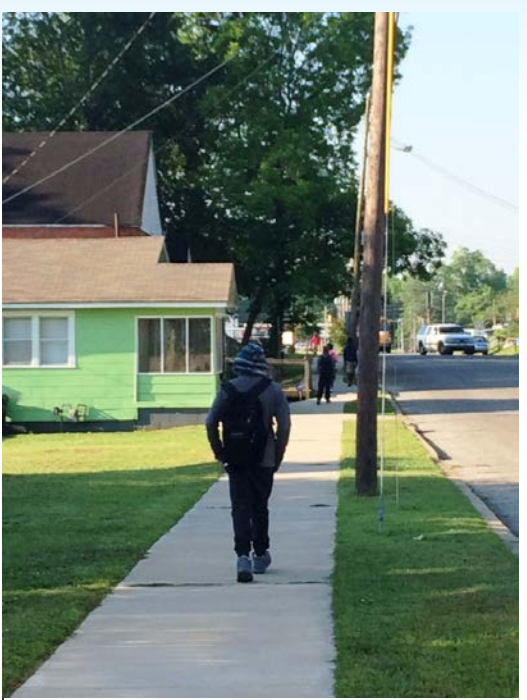
Figure 2: After project completion, children can walk on sidewalks, here seen looking south on 44<sup>th</sup> Avenue near 8<sup>th</sup> Street.

The city considers this project a success, as it increases safety not just for school children but for all residents. During the final inspection, the public works director shared that homeowners who initially were not supportive of the sidewalks began telling him how pleased they were and the benefits they were realizing. This included access to many businesses and amenities such as pharmacies, the post office, discount stores, financial institutions, and churches. The new sidewalks carry pedestrians to 8th Street, a major arterial and the southern border of the school campuses. The project has not just increased safety for young and older residents, it has also improved quality of life and supported the city's economic development. The Meridian SRTS project shows how modest, multimodal transportation infrastructure improvements can have wide-ranging positive impacts for communities.