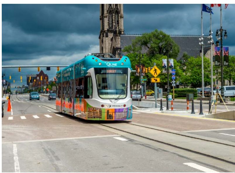
Figure 11: The M-1 RAIL in Detroit, MI. (Image courtesy of Michigan DOT).

The project is an example of a successful public-private partnership, raising funds for the development of the QLINE required collaboration between private entities and government agencies at the local, State, and Federal levels. The Michigan Department of Transportation (MDOT) partnered with M-1 RAIL to plan, design, and construct the streetcar. The project included a $140 million capital investment, in conjunction with a $65 million investment to reconstruct over 2.5 miles of State trunk line arterial, and its bridges over I-75 and I-94. In addition to a large philanthropic donation, M-1 RAIL used innovative financing including selling naming rights, station sponsorship, New Market Tax Credits, and received both FHWA and Federal Transit Administration (FTA) grants to fully fund the project. FHWA and FTA showed tremendous support executing a "One DOT" agreement to clarify a cooperative oversight approach between the two Federal agencies to address the various statutory, regulatory, and administrative procedures.