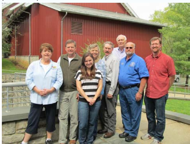
Figure 3: Members of the Fort Oglethorpe team at the Balancing Nature and Commerce workshop.

Representatives of these entities formed a team to attend <u>The Conservation Fund's Balancing Nature and Commerce</u> annual national workshop in Shepherdstown, West Virginia, which ultimately became the defining catalyst for transformation.