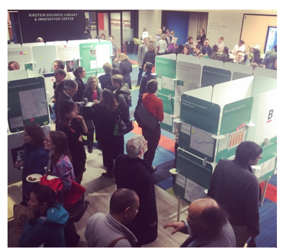
Figure 7: Exhibit of projects and polices at the Boston Public Library in March.

This phase of the process also meaningfully connected BTD staff with constituents by pairing 10 city officials with 10 residents who demonstrated their unique transportation needs--with children, limited mobility, or vision impairment. While accompanied by the city officials during a regular trip, these residents shared their ideas for safer bike connections, street festivals, and better pedestrian signals.