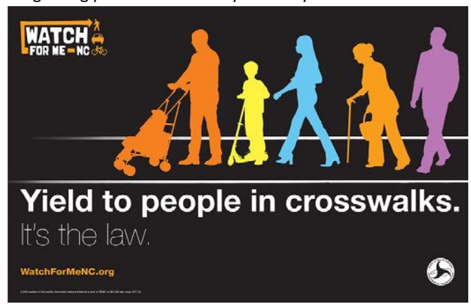
Figure 5: Watch for Me NC poster, one of several program outreach materials.

approaches rely heavily on coordination and communication between program partners, as well as interaction with the public. Participating Watch for Me NC communities receive advanced trainings on pedestrian and bicycle law enforcement and other best practices related to context-based approaches to improve safety for vulnerable road users. The law enforcement training course delves into laws and regulations and includes field exercises for officers to practice targeted operations aimed at improving driver compliance with pedestrian yielding laws. Participating communities also receive technical assistance, paid advertisements, and educational materials to help support their community engagement activities.