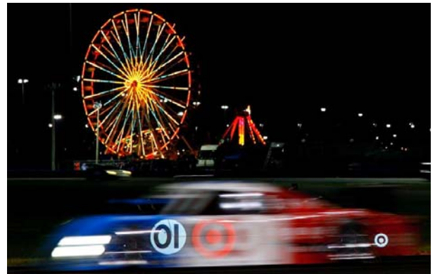
Scott Pruett, Juan Pablo Montoya and Salvador Duran won the Rolex 24 at Daytona last month.