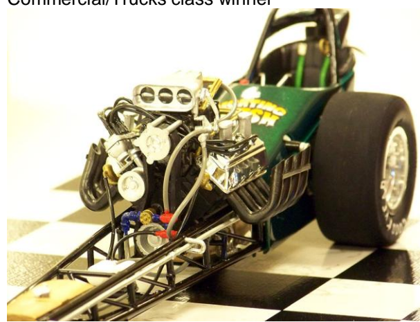
Large Scale class winner

One interesting aspect of these IPMS shows is the variety of models. While most of the readers of this are car guys, there is a lot to admire in other modeling genres. I especially like the figures and dioramas since I occasionally dabble in these and I can pick up some ideas and techniques. Fine Scale Modeler was on hand to take some photos.