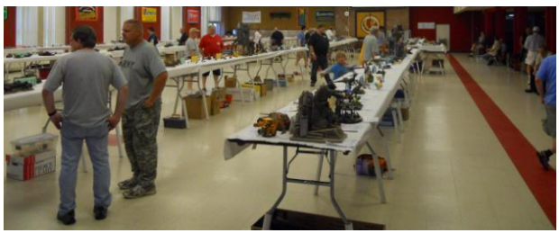
The contest room was large and well lit.