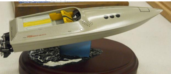
A Porsche speed boat