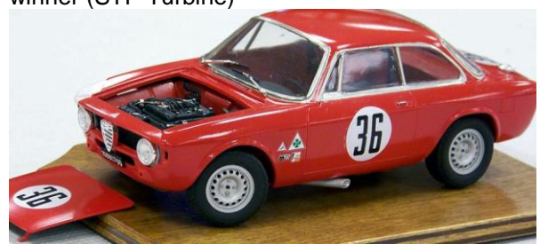
Closed Wheel Comp class winner (1966 Alfa)