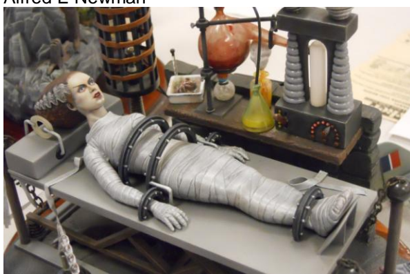
Bride of Frankenstein