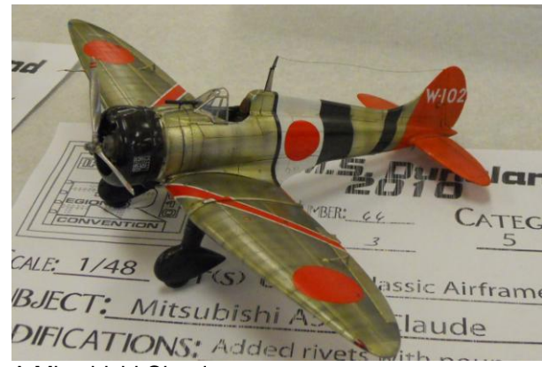
A Mitsubishi Claude