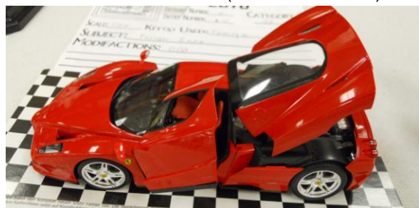
Out of the Box Class winner (Ferrari Enzo)