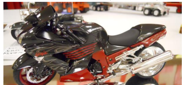
Motorcycle class winner