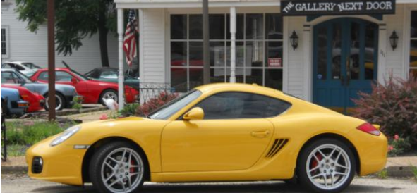
And many more were parked throughout the shopping area. So while my wife browsed the shops I checked out the cars, a real win-win situation!