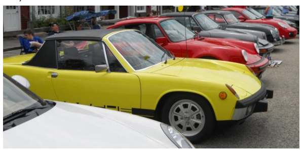
About 30 Porsches were parked in the show area for judging.

Long Grove, IL, northwest of Chicago, is a little town which is known for it's vintage shopping area, with art and jewelry galleries along with clothing and gift shops, kind of a "ladies outing" destination. But on Fathers Day, Sunday June 20, it hosted a Porsche Concours event.