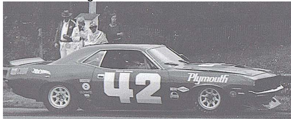
1970 at Road America