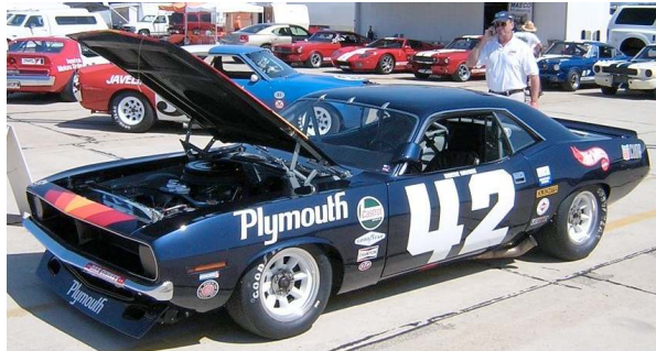
The restored car on the vintage circuit.