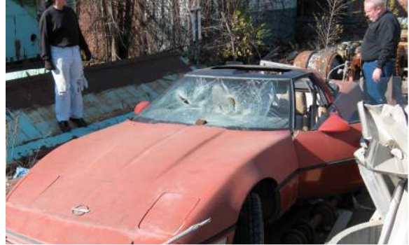
The before picture.....

all this money to race in the Barber Series. So, we decided to find a car, convert it to a race car and go racing economically and have fun while doing it. The result was a Corvette that we got for peanuts, and found another one for a donor car and went to work.