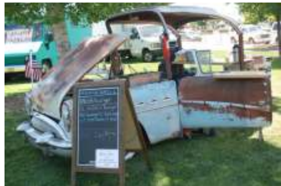
This Buick grill was on hand, an old Buick getting a second life as a food stand!