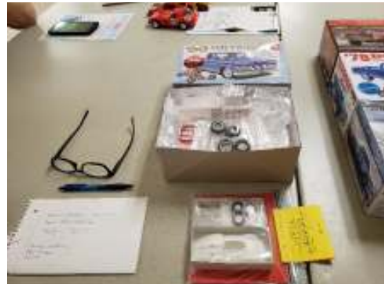
Ed Sexton '60 Chevy pickup with Go Kart using Replicas in Miniatures streamliner body and kit for go kart wheels and tires