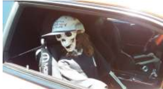
It's a dry heat!