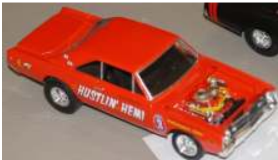
First Place People's Choice Winner

The winners are shown here, a 1968 Dart, a 1968 Charger and a 70 Cuda all featured lots of added details.