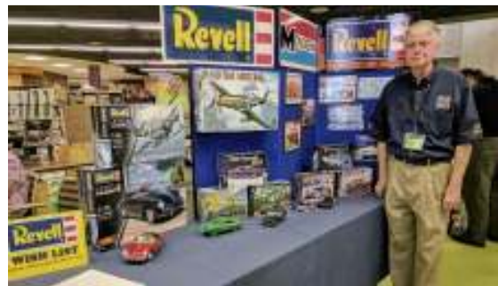
Revell was on hand with a display of current and upcoming product.