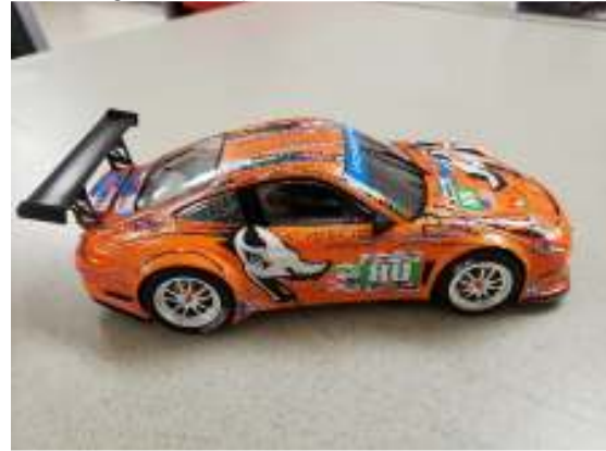
Doug Fisher had a Porsche 911 GT3 in Flying Lizard livery from Scale Motorsports