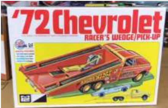
Reissue of the Chevy hauler kit for getting your race cars to the track.