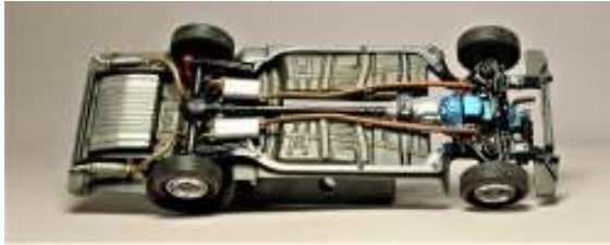
Chassis sub assembly

This was an easy build up that represents a model that was never produced.