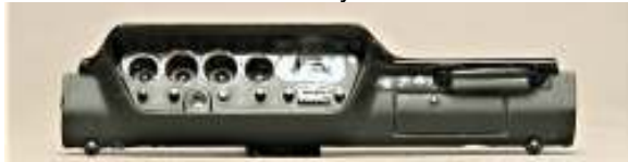
Dash sub assembly