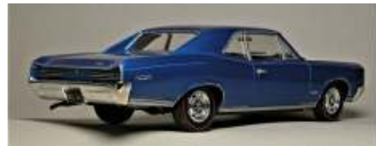
1966 Pontiac Tempest 2 door post with GTO options