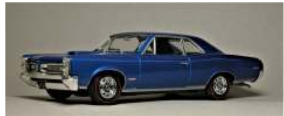
1966 Pontiac Tempest 2 door post with GTO options