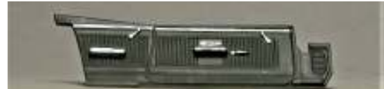
Door panel – semi gloss black and Molochrome trim