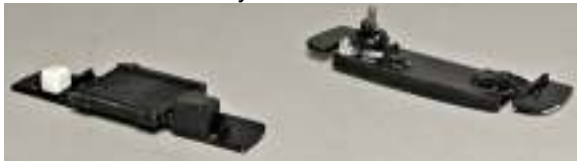
Radiator bulkhead assembly