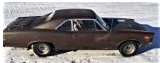
An old Pontiac Tempest two door post