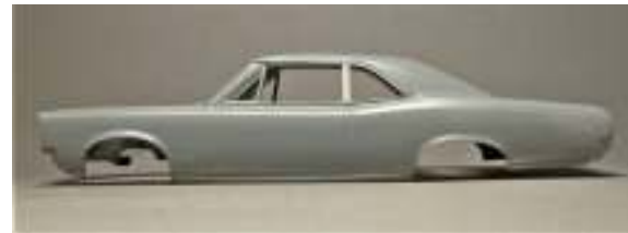
Body in primer with "posts" added