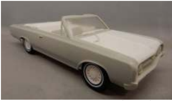
Another vintage model, the stock/custom/racing AMT 3-in-1 1964 Oldsmobile Cutlass F-85 Convertible is coming back soon! Wonder how much of his will be retooled?