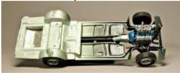
Chassis sub assembly