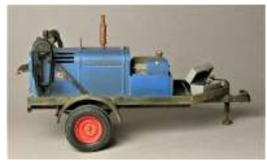
Welding cables and early Miller Logo

Once I had finished the trailer and welder I decided to add one more small detail. I used four AMT 1949 Ford custom accessories that were old reel to reel tape decks. I cut them in half and shortened them to a tool box length, then glued them back together and made a hinge from .004" sheet lead. I added a handle on top and a latch strap. Last but not least, I added the welder guy who is 1/24<sup>th</sup> scale. I won him as an attendance prize.