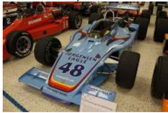
1975 Indy 500 Winner