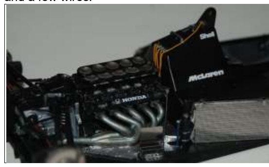
"Closing in on the finish line. Polish, assemble and decal left."

Progress - added the heat shield under the engine (cigarette paper), more photoetch stuff and a few wires.