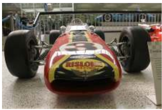
1968 Indy 500 Winner