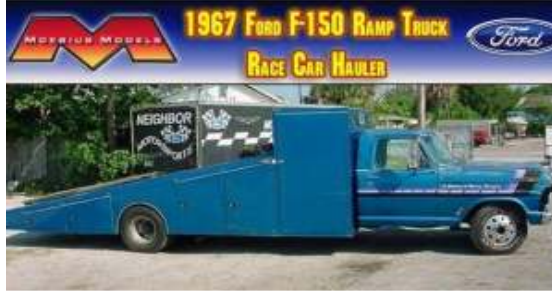
I also saw this in another club newsletter.