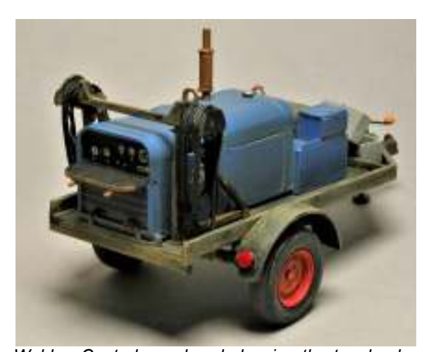
Welder: Control panel end showing the two lead sockets at the very bottom of the control panel end. The gauges and control switches are hand painted.

I built a 1/28<sup>th</sup> scale Renwal Lacrosse Rocket Launcher Truck kit and converted it into a cargo bed US Forest service truck. Part of the rocket launch bed included the generator which powered the hydraulics for the launcher. I decided to turn the generator into a 1955 version of a pipeline welder. Since it was 1/28<sup>th</sup> scale, it looked just right for a 1/25<sup>th</sup> scale model.