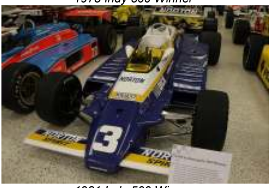
1981 Indy 500 Winner