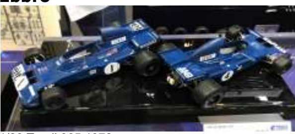
1/20 Tyrell 005 1972