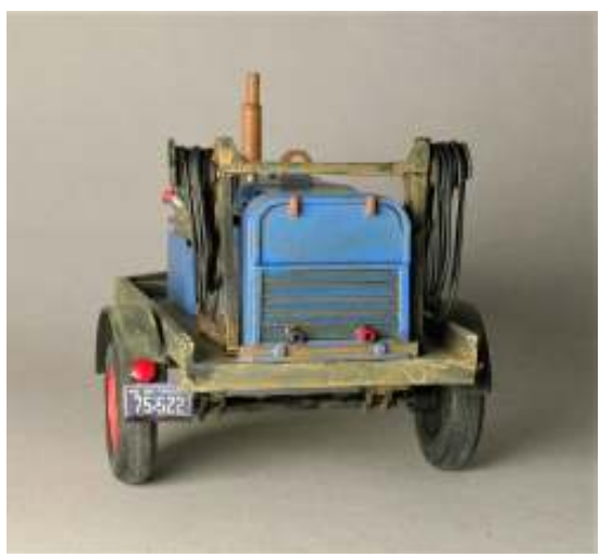
Rear view of trailer with control panel closed

The finished model will be a good entry for the miscellaneous class at contests.