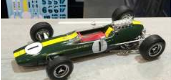
1/20 Lotus 33 F1 1966