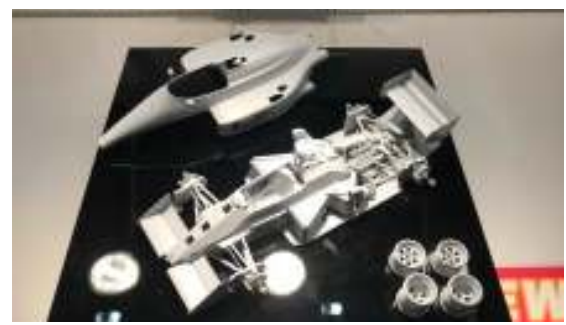
NuNu Lotus 99T 1/12

No word on the availability of the previously released LeMans Porsche 911 RSR kits.