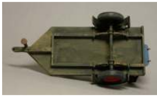
Welder control panel and welding cable sockets Trailer bottom view