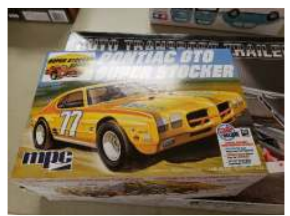
Round 2 Pontiac Superstocker from Dave. Great car to drive as the exhaust goes right through the cockpit to the side door

David had a '66 Cobra from Revel which was a poorly built kit and stripped the kit to bare plastic. Repainted and used Spastik chrome for most of the shiny bits. Paint was Burgundy Red Metallic over a Krylon gold leaf short cuts undercoat.