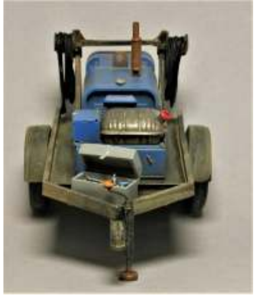
Scratch built tool box and trailer jack