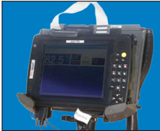
Haskell Lemon Construction Co.