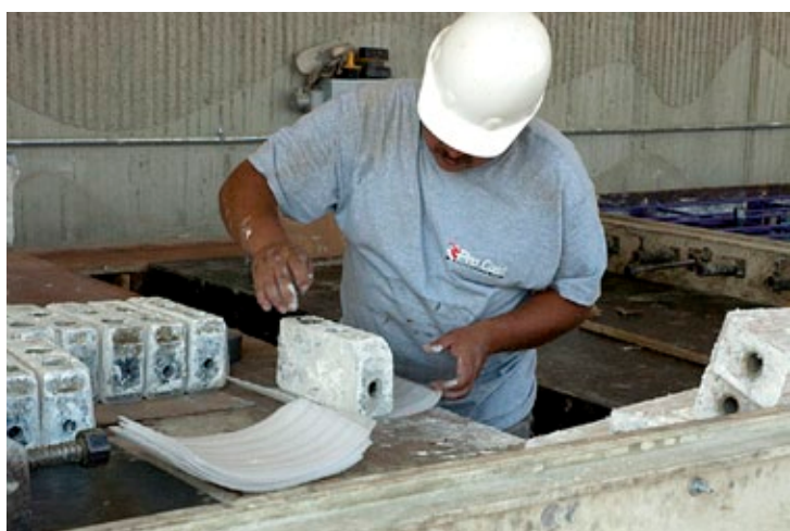
Showcase participants visited a plant to see how concrete panels are made.