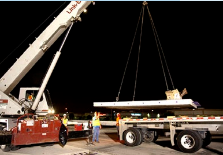
Participants in a Highways for LIFE showcase in California watched the nighttime installation of precast concrete pavement panels.

project in California overwhelmingly rated it a valuable experience, according to a follow-up survey. Sixty-four percent said they will use or consider using the technology as a result of seeing it in action at the showcase.