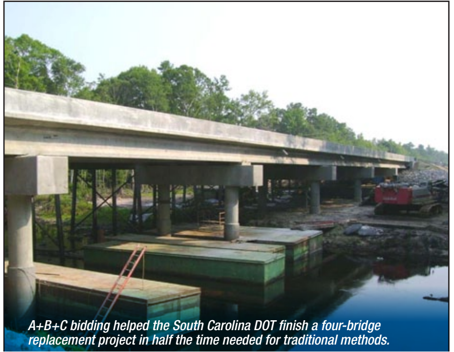
A+B+C bidding helped the South Carolina DOT finish a four-bridge replacement project in half the time needed for traditional methods.

Two work zone-related crashes occurred during construction, below the preconstruction crash rate of 19