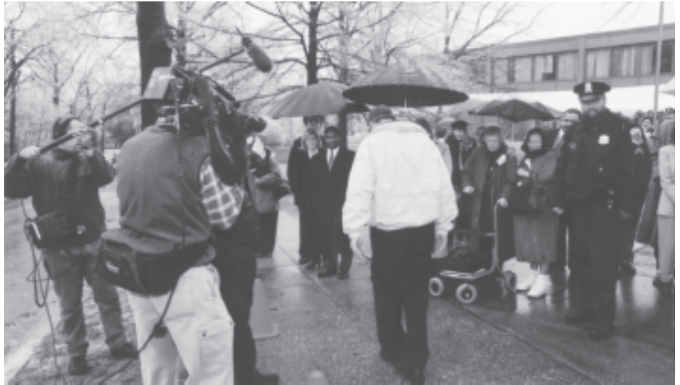
Secretary Slater and Administrator Bailey watch as news photographers record a "mock" sobriety checkpoint outside the Second District Police Station in Washington, DC.

The You Drink & Drive. You Lose. campaign is a collaborative effort led by the U.S. Department of Transportation and is endorsed by national organizations such as the National 3D Prevention Month Coalition, MADD, IACP, the National Sheriffs' Association, the National Organization of Black Law Enforcement Executives (NOBLE), Operation C.A.R.E., the National Commission Against Drunk Driving, the National Association of Governors' Highway Traffic Safety Representatives, and the National Association of Broadcasters. ■