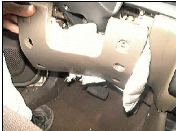
Figure 6: Knee bolster air bag cover flap held in place