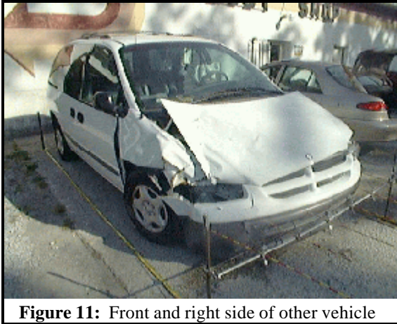
Figure 11: Front and right side of other vehicle

The Caravan sustained direct contact at the front right corner ( Figure 11 ). The CDC was determined to be 12-FZEW-2 (10) . The WinSMASH reconstruction program, damage only algorithm based on measured crush profiles from both vehicles, indicated Total, Longitudinal and Lateral Delta Vs, respectively: 20 km.p.h. [12.4 m.p.h.], -19 km.p.h. [-11.8 m.p.h.] and -3 km.p.h. [-1.9 m.p.h.].