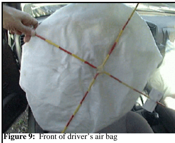
Figure 9: Front of driver's air bag

The driver's front air bag was mounted in the steering wheel hub ( Figure 9 ). The deployed air bag was round with diameter 62 centimeters [24.4 inches]. There was one vent port at the 12 o'clock position on the back of the air bag, and no tethers. The module cover flaps opened at the designated tear points and there was no damage to the air bag or the cover flaps. There was no physical evidence of contact on the driver's air bag, except a smudge of dirt on the lower edge of the front.