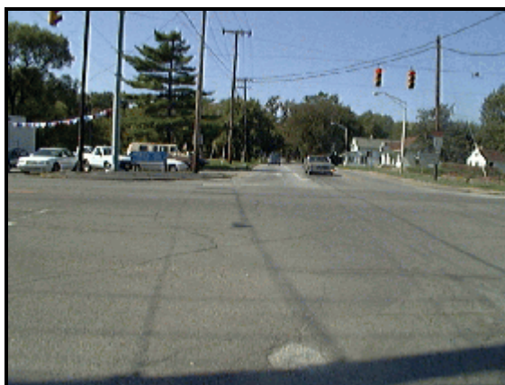
Figure 2: Area of impact approximately at the center of the intersection, looking west (lookback view of other vehicle's eastbound approach)