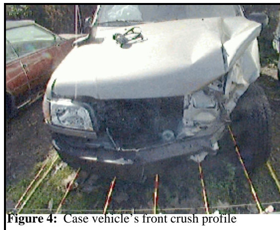
Figure 4: Case vehicle's front crush profile