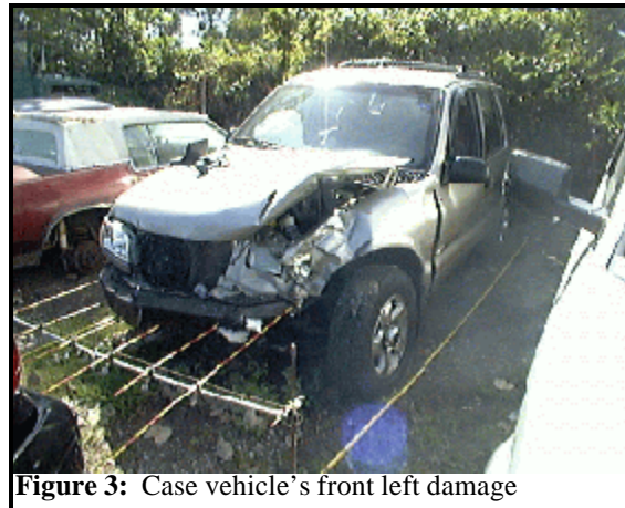
Figure 3: Case vehicle's front left damage

The case vehicle sustained direct contact damage beginning at the front left corner and extending 72 centimeters [28.3 inches] inward across the front, with maximum crush of 36 centimeters [14.2 inches] at the front left bumper corner ( Figures 3 and 4 ). Direct damaged was confined to the area forward of the front axle: the bumper cover was torn off; the forward area of the left fender, the headlight assembly and the bumper were crushed rearward and inward; the front left corner of the engine hood was bent under and folded double; the grille was shattered; and the radiator and fan were displaced rearward. The NASS researcher indicated that the front left wheel was restricted by the bending of the left fender, but this is not apparent in the photographs. No tires were deflated and the wheelbase was essentially unchanged on both sides. There was no glazing damage, and no intrusions into the passenger compartment. The CDC was determined to be 10-FYEW-2 (310) . The WinSMASH reconstruction program, damage only algorithm based on the measured crush profiles of the two vehicles, indicated Total, Longitudinal and Lateral Delta V's, respectively: 20 km.p.h. [12.4 m.p.h.], -13 km.p.h. [-8.1 m.p.h.] and +15 km.p.h. [+9.3 m.p.h.] for the case vehicle. These results appear somewhat low but basically reasonable, indicating that the crash was of low severity (14 - 23 km.p.h. [9 - 14 m.p.h.]) for the case vehicle.