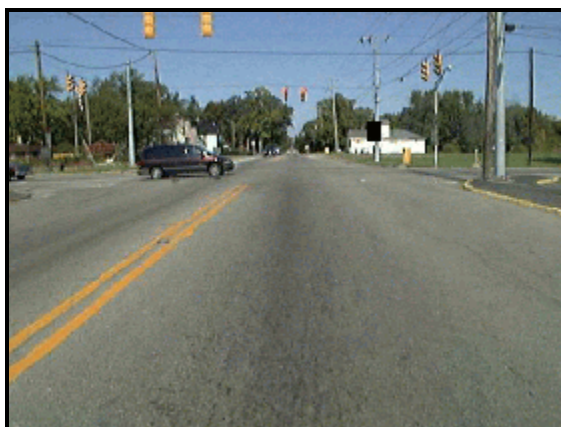
Figure 1: Case vehicle's northbound approach toward left turn at intersection

The crash occurred within the intersection. The front left corner of the case vehicle was impacted by the front right corner of the other vehicle, causing the case vehicle's driver and front right passenger front air bags and the driver's knee bolster air bag to deploy. The other vehicle was also equipped with front air bags that deployed. The case vehicle rotated clockwise, the other vehicle was displaced northeastward and both vehicles came to rest within the intersection, a short distance from the point of impact.