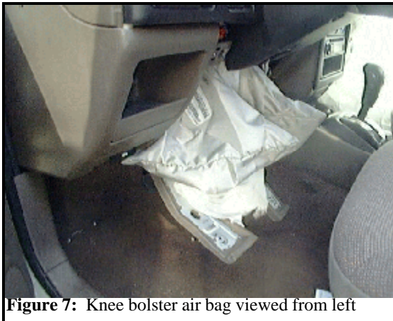
Figure 7: Knee bolster air bag viewed from left