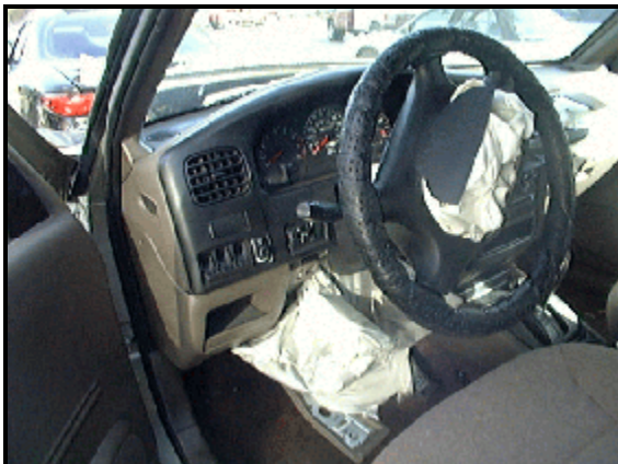
Figure 5: Driver's seat area showing general location of the driver's knee bolster air bag

The deployed air bag measured 44 centimeters [17.3 inches] horizontally and 32 centimeters [12.6 inches] vertically ( Figure 8 ). There was no evidence of damage to the knee bolster air bag nor its cover flap.