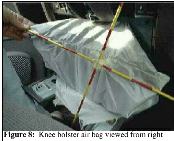
Figure 8: Knee bolster air bag viewed from right