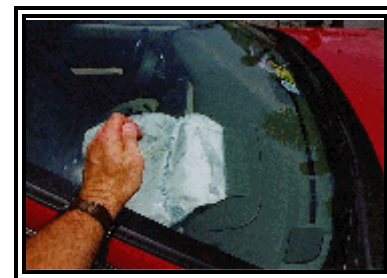
Figure 5. Top mount and flap configuration of the front right air bag.

The front right air bag was a top mount module in the upper right instrument panel ( Figure 5 ). The module assembly was retained in the instrument panel by a series of friction fit (push) clips. Symmetrical H-configuration cover flaps concealed the air bag membrane within the module assembly. The cover flaps were 5.1 x 25.4 cm (2.0 x 10.0") and hinged at the fore and aft segment segments.