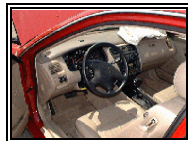
Figure 4. Split deployment of the frontal air bag system.

The Honda Accord was equipped with a Supplemental Restraint System (SRS) that consisted of redesigned frontal air bags for the driver and right passenger positions. In addition, this vehicle was equipped with side impact air bags for the front seated positions. The Honda was involved in a frontal crash sequence which exceeded the threshold for deployment. The front right air bag deployed, however, the front left (driver) air bag failed to deploy ( Figure 4 ). The crash did not warrant deployment of the side impact air bags.