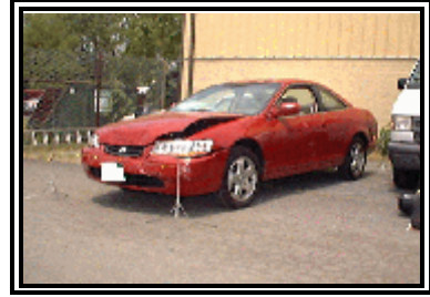
Figure 1. Frontal damage to the Honda Accord.

This on-site investigation focused on the split deployment of the frontal air bag system in a 2000 Honda Accord EX. The Honda was equipped with redesigned frontal air bags and side impact air bags for the driver and right passenger positions. The vehicle was involved in an intersection-type crash with a 1991 Toyota Celica that resulted in frontal damage ( Figure 1 ) to the Honda. The impact resulted in a sufficient longitudinal deceleration to deploy the Honda's frontal air bag system. The front right air bag deployed, however, the driver air bag failed to deploy. The focus on this investigation was to determine the cause of the split deployment.