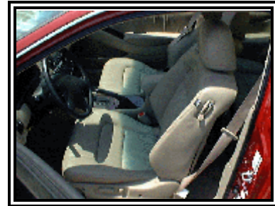
Figure 6. Adjusted seat track position for the female driver.

The driver of the 2000 Honda Accord was seated in a mid track position with the seat back support reclined to approximately 25 degrees and the adjustable head restraint set to the lowest position. In this position, the seat track was adjusted 10.4 cm (4.1") rearward of the full forward position and 13.7 cm (5.4") forward of the full rear position ( Figure 6 ). The horizontal distance between the mid point of the front left air bag module cover and the seat back support was 55.9 cm (22.0"), thus providing the driver with a safe distance between herself and the steering assembly and the front left air bag module. The driver stated she was wearing the manual belt system although there was no loading evidence on the belt system.