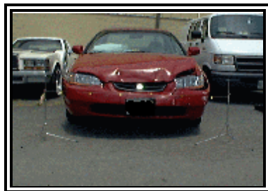
Figure 2. Frontal damage to the Honda Accord.

The 2000 Honda Accord sustained moderate frontal damage as a result of the intersection-type crash with the Toyota Celica. The direct contact damage ( Figure 2 ) began on the bumper fascia 38.1 cm (15.0") right of center and extended 113.7 cm (44.75") to the left corner. Maximum crush was 19.7 cm (7.75") located on the bumper reinforcement bar, 12.1 cm (4.75") left of the vehicle's centerline ( Figure 3 ). The frontal impact deformed the entire width of the energy absorbing frontal structure resulting in a combined induced and direct contact damage length of 153.7 cm (60.5"). The bumper fascia crushed and returned to its original form while the reinforcement bar retained the deformation pattern. Therefore, the crush profile was documented at the reinforcement bar by removing the grille and plastic filler panels. The crush profile was as follows: C1 = 3.8 cm (1.5"), C2 = 8.3 cm (3.25"), C3 = 17.1 cm (6.75"), C4 = 5.1 cm (13.0"), C5 = 3.8 cm (1.5"), C6 = 0 cm. The Collision Deformation Classification (CDC) for this frontal impact sequence was 01-FDEW-1.