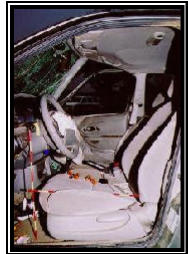
Figure 12. Interior view of the driver space.

At impact, the driver initiated a forward trajectory in response to the 12 o'clock impact force and loaded the deployed redesigned driver air bag as evidenced by the makeup transfers documented to the upper right quadrant of the air bag face. Although driver injury information was limited, she sustained an abrasion to the left shoulder which probably was a result of air bag interaction, evidenced by the location of the injury relative to the fabric transfers documented to the left upper quadrant of the air bag face. The driver's torso loaded the deployed air bag and compressed the bag against the steering assembly. This loading of the steering column resulted in 3.0 cm (1.2 in) of sheer capsule movement. She subsequently impacted the knee bolster resulting in bilateral knee abrasions, evidenced by the deformation and scuff marks identified on this component. The driver continued the kinematic response pattern as her head struck the sunvisor as evidenced by the abrading and hair strands documented to this component, however, no resulting injury was reported. Following the crash, she exited the vehicle under her own power and was transported by private vehicle to the emergency room of a local hospital for treatment and released. The redesigned driver air bag provided adequate protection against contact to the steering wheel hub/rim, thus preventing serious injury.