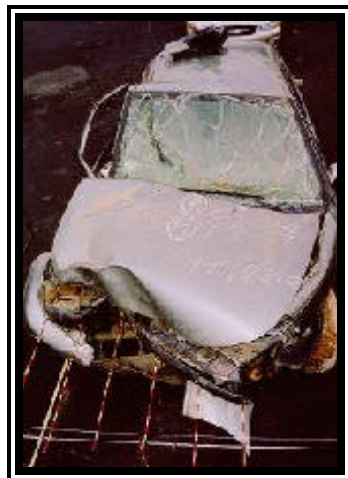
Figure 5. Front right damage to the 1999 Ford Contour Sport SE.

The 1999 Ford Contour Sport SE sustained severe frontal damage as a result of the impact with the tree cluster ( Figures 5 & 6 ). The direct contact damage began 12.0 cm (4.7 in) right of the end plane centerline and extended 18.0 cm (7.1 in) outboard. The impact deformed the full frontal width resulting in a combined direct and induced damage length (Field L) of 116.0 cm (45.7 in). Six crush measurements were documented at the level of the bumper: C1= 4.5 cm (1.8 in), C2= 27.5 cm (10.8 in), C3= 47.5 cm (18.7 in), C4= 77.5 cm (30.5 in), C5= 63.5 cm (25.0 in), C6= 57.5 cm (22.6 in). The Collision Deformation Classification (CDC) for this impact to the Ford was 12-FZEN-4 with a principal direction of force of 0 degrees. The hood was deformed up and rearward from engagement against the trees. The bumper corners were pulled inward by the narrow contact damage as the end structure was displaced slightly to the right from the impact force. Tree bark was noted along the contact damage. The right fender was deformed rearward which restricted the right front wheel/tire (not