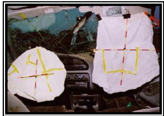
Figure 9. 1999 Ford Contour Sport SE deployed redesigned frontal air bags.

The 1999 Ford Contour Sport SE was equipped with redesigned frontal air bags for the driver and front right passenger positions. The air bags deployed as a result of the crash ( Figure 9 ). The driver air bag was housed in the center of the steering wheel with a horizontally oriented flap tear seam (H-configuration). No contact evidence was identified on the exterior surface of the module cover flaps. The flaps were symmetrical in shape and measured 19.0 cm (7.5 in) in width and 9.0 cm (3.5 in) in height. The diameter of the driver air bag measured 56.5 cm (22.2 in) in its deflated state ( Figure 10 ). Makeup transfers were documented to the upper right quadrant of the air bag face along with fabric transfers to the upper left quadrant. The bag was tethered by two internal straps and vented by two ports located at the 11 o'clock and 1 o'clock sectors on the rear aspect of the air bag.