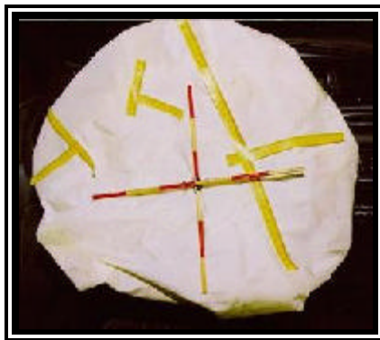
Figure 10. Contact evidence to the 1999 Ford Contour deployed redesigned driver air bag.

The front right passenger air bag deployed from the right top instrument panel area with a single cover flap design hinged at the forward aspect. The cover flap was rectangular in shape and measured 43.0 cm (16.9 in) in width along the top portion, 36.7 cm (14.4 in) in width along the lower portion, 26.0 cm (10.2 in) in height along the left edge and 22.0 cm (8.7 in) in height along the right edge. An indentation was noted along the aft edge of the flap from contact to the (fractured) right mid-windshield area. The passenger air bag measured 71.5 cm (28.1 in) in width and 69.5 cm (27.4 in) in height in its deflated state ( Figure 11 ). Although heavily stained by mold from exposure to the environment post-crash, contact evidence consisted of dark fabric transfers to the lower left quadrant of the air bag face with heavy abrading surrounding the contact site. The top section of the air bag membrane was also abraded from engagement against the (fractured) right windshield. The bag was tethered by two internal straps and vented by one port located at the 10 o'clock sector on the side aspect of the bag. Rearward air bag excursion measured 53.0 cm (20.9 in) from the aft portion of the right instrument panel.