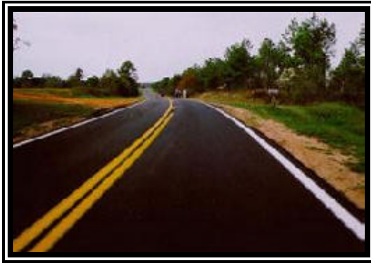
Figure 1. Northbound approach for the 1999 Ford Contour Sport SE.

The 15 year old female driver of the 1999 Ford Contour was operating the vehicle northbound ( Figure 1 ) when she approached the apex of the road curvature (at the hillcrest) and allowed the vehicle to depart the right (east) pavement edge. The vehicle traveled 71.0 meters (233.0 feet) alongside the apron before the vehicle re-entered the roadway in a slight counterclockwise yaw, evidenced by the police reported re-entry tire marks approximated during the SCI scene inspection. Subsequent right steering maneuvers re-directed the vehicle back towards the east pavement edge. The Ford again exited the east pavement edge ( Figure 2 ) and continued 22.0 meters (72.2 feet) into a wooded area. This trajectory was evidenced by 11.9 meters (39.0 feet) of pre-impact soil furrows documented at the scene. The driver reported to police that she struck a pothole in the road which contributed to pre-crash circumstances, however, evidence suggested this was more of an issue related to excessive speed and driver inexperience.