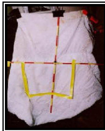
Figure 11. Contact evidence to the 1999 Ford Contour deployed redesigned passenger air bag.