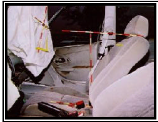
Figure 13. Deformation to the front right seat back support.

The 12 year old female front right child passenger of the 1999 Ford Contour Sport SE was unrestrained (3-point manual lap and shoulder belt system available) and presumed to be seated in an upright posture with the seat track adjusted to a middle position. The lack of belt usage was determined by the trajectory of the child in conjunction with the absence of loading evidence on the restraint webbing or D-ring.