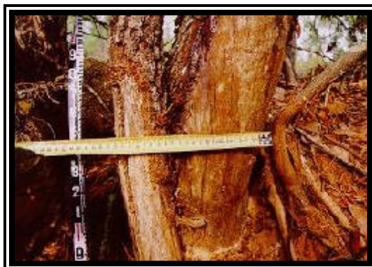
Figure 4. Close-up view of struck tree cluster.