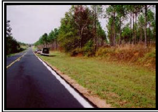
Figure 2. Northbound approach for the 1999 Ford Contour Sport SE.