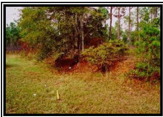
Figure 3. Struck tree cluster.

As the Ford approached the wooded terrain, the frontal area was deflected slightly upward by the embankment (no impact) as the front right area impacted a tree cluster ( Figures 3 & 4 ) resulting in severe damage. The WinSMASH damage and trajectory algorithm computed an impact speed of 67.8 km/h (42.1 mph) with an overall velocity change of 51.4 km/h (31.9 mph) and a matching negative longitudinal component. The speed change exceeded the threshold for deployment, therefore, the Ford's redesigned frontal air bag system deployed. At this point, the Ford rotated clockwise approximately 130 degrees and came to rest 6.5 meters (21.3 feet) from the point of impact facing southeast.