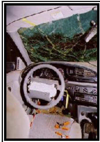
Figure 7. Interior view of the driver space.

Interior damage to the Ford Contour was severe and attributed to component intrusions and occupant contact ( Figures 7 & 8 ). The left knee bolster was deformed and scuffed. Steering wheel rim deformation measured 1.5 cm (0.6 in) along the top portion as sheer capsule movement measured 3.0 cm (1.2 in). The turn signal stalk separated from the steering column. Scuff marks, abrasions, and dark hair strands were identified on the left sunvisor. The rear view mirror was displaced to the right (not fractured). The center floor-mounted console was displaced to the right. The glove compartment door was deformed, scuffed and out-of-place. The front right seat back support was displaced rearward 25.0 cm (9.8 in) and attributed to passenger rebound. Indentations were identified on the right front door panel. Minor abrading and scuffs were also documented to the rear aspect of the front left seat back, which was attributed to cargo movement within the vehicle. It should be noted that the right mid-instrument panel area, windshield header, and headliner were free of contact evidence. Longitudinal intrusions into the front occupant space involved 15.0 cm (5.9 in) of right toe pan/instrument panel and 12.0 cm (4.7 in) of center instrument panel intrusion. Vertical intrusions into the front right passenger space involved 3.0 cm (1.2 in) of roof intrusion.