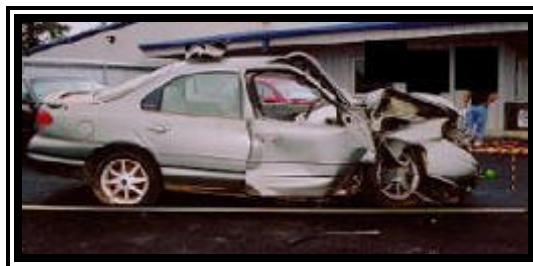
Figure 6. Right side view of the 1999 Ford Contour Sport SE.