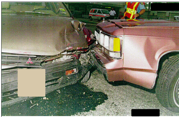
Figure 5: On-scene at final rest, looking across the case vehicle's front from the left and showing the Mitsubishi's front left area (case photo #05)