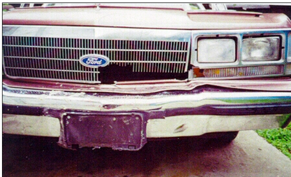
Figure 3: Case vehicle's damaged front bumper and grille (case photo #07)

Based on the available photographs, the case vehicle's contact with the Mitsubishi involved the left half of the case vehicle's front plane. Direct damage extended approximately from the center to the front left corner on the bumper and grille, with induced damage extending across the entire front. Portions of the grille were broken away, but the headlight and turn signal assemblies were intact ( Figure 3 ). The case vehicle's left front fender sustained induced damage as it was pushed rearward ( Figure 5 ). All glazing appears to have remained intact and no doors came open.