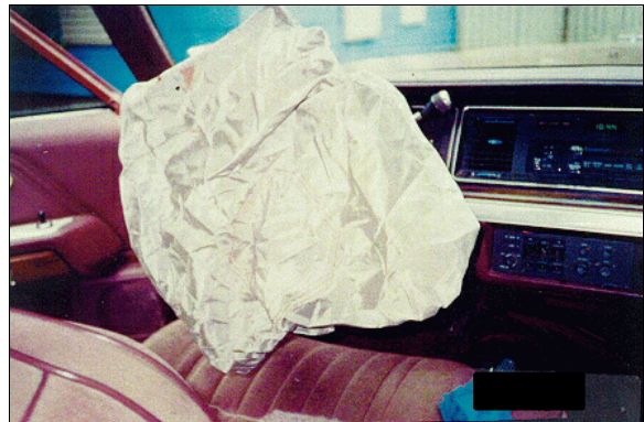
Figure 7: Case vehicle's deployed driver air bag showing blood spots on fabric (case photo #15)

The case vehicle driver made no known pre-crash avoidance maneuvers. As a result and independent of the non-use of her available safety belts, her pre-impact body position did not change just prior to impact. The case vehicle's impact with the Mitsubishi caused her to move forward and slightly rightward, toward the 30 degree direction of force, as the vehicle decelerated. Either one or both of the deploying driver air bag module's cover flaps contacted the driver's chest and upper abdomen, causing lacerations to her heart and liver and fractures of the ribs and sternum. Immediately following, the air bag contacted her chest, neck, and face, causing multiple abrasions and contusions. She was propelled rearward into her seat back as the case vehicle rotated slightly counterclockwise. The driver's facial interaction with the deploying air bag resulted in the bending and breaking of her prescription eyeglasses and caused one of her earrings to be propelled rearward where it came to rest on the rear shelf near the case vehicle's backlight. According to the available information, at final rest the driver was laying to the right.