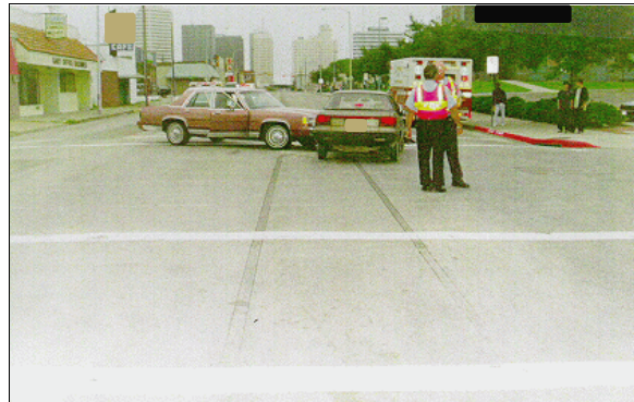
Figure 1: On-scene view looking east at case vehicle's (left) and Mitsubishi's (right) final rest positions and braking skid marks from Mitsubishi; Note: Mitsubishi deflected slightly southward while rotating slightly clockwise (case photo #01)

The front left half of the case vehicle ( Figures 3 and 4 ) impacted the front left of the Mitsubishi ( Figure 5 ), causing the case vehicle driver's air bag to deploy. The case vehicle rotated approximately 10 degrees counterclockwise and came to rest heading in a south-southwesterly direction. The Mitsubishi was deflected southward and was pushed approximately 10 degrees clockwise prior to coming to rest heading east-southeastward. The vehicles remained in contact with each other at final rest ( Figure 6 ).