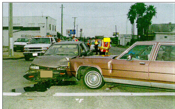
Figure 2: On-scene view looking west at case vehicle's (right) and Mitsubishi's (left) final rest positions; Note: case vehicle rotated counterclockwise post-impact (case photo #03)