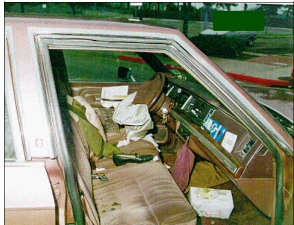
Figure 8: On-scene view looking across case vehicle's front seating area; Note: close proximity of bench seat to instrument panel (case photo #14)