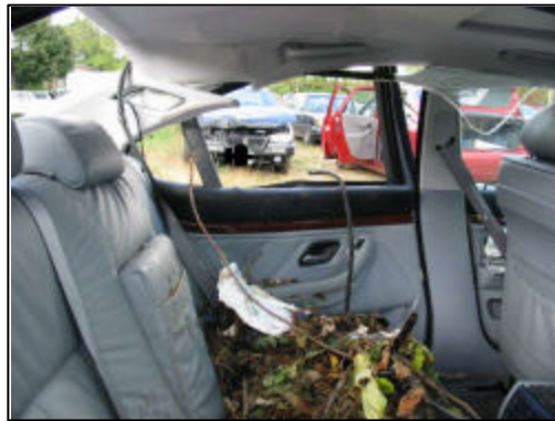
Figure 7. View across the rear seating positions showing intrusions