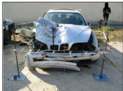
Figure 5. Frontal damage to the BMW 525i

The BMW sustained moderate frontal damage as a result of the impact with the tree ( Figure 5 ). The direct damage began 110 cm (43") inboard of the front left bumper corner and extended along the front bumper 50 cm (20") to the front right corner. The bumper fascia sustained abrasions and fractures from contact with the tree. Direct contact abrasions and tree debris were also present on the right aspect of the hood. The hood was buckled rearward and the right front fender was crushed rearward. The combined direct and induced damage measured 160 cm (63") across the entire frontal plane. Six crush measurements were documented by the NASS researcher along the front