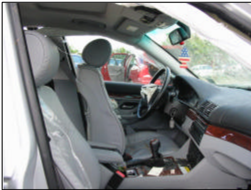
Figure 6. View across the front seating positions

The 2001 BMW 525i sustained moderate interior damage as a result of the multiple impacts ( Figures 6 and 7 ). The left rear door was jammed shut at the time of the vehicle inspection. The windshield was fractured from impact forces. The left rear, right front, and backlight glazing was disintegrated from impact forces. The right toe pan intruded longitudinally, and lateral intrusions included the left roof side rail, left door, and left C-pillar. The knee bolster was scuffed on the left aspect from contact with the driver’s left leg. The interior panel of the left front door had been removed at the time of the vehicle inspection. The NASS researcher reported that the rear left head restraint was damaged as a result of the impact with the utility pole. It was separated from the rear seat back at the time of the vehicle inspection. The driver’s safety belt webbing exhibited scuffs on the shoulder portion of the belt.