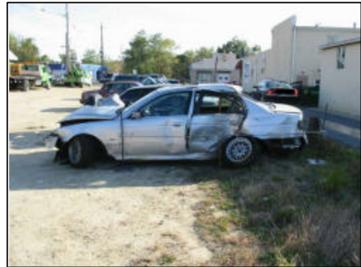
Figure 4. Left side damage to the BMW 525i

The BMW 525i sustained moderate left side damage as a result of the fence and utility pole impacts ( Figure 4 ). The direct damage for the fence impact was located on the left rear quarter panel. The maximum lateral crush was 5 cm (2") for the impact with the fence. The Collision Deformation Classification (CDC) for the fence impact was 10-LBEW-1. The direct damage for the utility pole impact began 45 cm (18") rear of the left B-pillar and extended 45 cm (18") rearward along the left rear door. Pocketing in the sheet metal and wood transfers from the pole were present on the left rear door. The left rear wheel was displaced laterally and the left aspect of the rear bumper fascia was separated. The right rear wheel was displaced as a result of the rapid CCW rotation around the pole. The direct contact involved the entire vertical height of the vehicle. The combined direct and induced damage began at the left B-pillar and measured 90 cm (35") rearward along the left rear door and left rear quarter panel. Due to the overlapping damage from the multiple left side impacts, a single crush profile was documented by the researcher. It should be noted that the crush profile and damage locators were adjusted after Zone Center review and did not coincide with the case photographs of the crush contour gauge. The maximum lateral crush on the left rear door measured 33 cm (13"). The CDC for the utility pole impact was 09-LPAW-3.