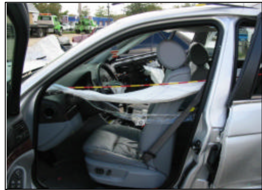
Figure 10. View of driver's HPS

The 2001 BMW 525i was equipped with a HPS that consisted of inflatable tubular structures for both front seated occupants that deployed as a result of the crash. The HPS deployed vertically from the A-pillars and roof side rails and were positioned diagonally across the side windows when fully inflated ( Figure 10 ). Both HPS were tethered at the lower aspect of the A-pillars and at the roof side rails between the B- and C-pillars. The HPS cover flaps measured 150 cm (59”) in length and 10 cm (4”) in width. Each HPS air bag measured 120 cm (47”) in length and 16 cm (16”) in diameter. The NASS researcher did not identify any occupant contact to the HPS.