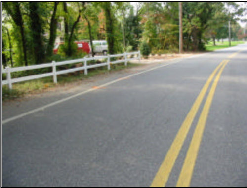
Figure 2. Southbound approach for the BMW 525i

The 17-year-old male driver of the 2001 BMW 525i was operating the vehicle southbound on the two-lane roadway on approach to the right curve ( Figure 2 ). Police reported the pre-crash travel speed to be 72 km/h (45 mph). As the BMW entered the curve, the driver lost control of the vehicle due to the wet roadway surface. The vehicle initiated a clockwise (CW) yaw across the centerline and the northbound lane, and departed the opposite roadside near the apex of the curve ( Figure 3 ). Scuff marks were present on the roadside from the BMW's tires between the point of roadside departure and the impact with the utility pole. The driver stated that he did not apply the brakes and did not attempt any steering inputs to attempt to regain control of the vehicle. It was not known if the BMW's traction control system engaged.