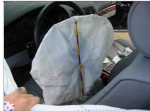
Figure 8. View of deployed driver's air bag

The 2001 BMW 525i was equipped with dual-stage, “smart”, frontal air bags for the driver and front right passenger positions. The driver’s air bag deployed as a result of the frontal impact with the tree. The driver’s air bag deployed from the steering wheel hub that was configured with asymmetrical H-configuration module cover flaps. The upper flap measured 16 cm (6”) in width and 11 cm (4”) in height. The lower flap measured 14 cm (6”) in width and 7 cm (3”) in height. The driver’s air bag ( Figure 8 ) measured 58 cm (22”) in diameter and was vented by a single circular port at the 12 o’clock aspect on the rear of the air bag. The air bag was not tethered. The NASS researcher reported no occupant contact evidence on the air bag.