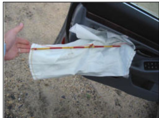
Figure 9. Door-mounted driver's side air bag

The 2001 BMW 525i was equipped with door-mounted side impact air bags for both front seating positions. Both side impact air bags deployed as a result of the crash. The side impact air bags deployed in a lateral direction from the interior door panels above the arm rests. The cover flaps were in the shape of parallelograms and were hinged at the bottom aspects. The side air bags offered thorax protection and measured 50 cm (20”) in length and 22 cm (9”) in height. Each side air bag was tethered by one internal strap. The deployed driver’s side air bag is shown in Figure 9 .