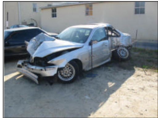
Figure 1. Damaged 2001 BMW 525i

This remote investigation focused on the performance of the Advanced Occupant Protection System (AOPS) and the side impact inflatable occupant protection system present in a 2001 BMW 525i sedan. The AOPS included dual-stage “smart” frontal air bags and safety belt pretensioners. The side impact inflatable occupant protection system included side impact air bags and a Head Protection System (HPS). The BMW ( Figure 1 ) was involved in a run-off-road crash that involved a left side impact to a wood fence and a wood utility pole, and a subsequent frontal impact with a tree. The impacts resulted in the deployment of the driver’s air bag, both side impact air bags, and both HPS. A 17-year-old male driver was the sole occupant of the vehicle and was restrained by the manual 3-point lap and shoulder belt. He sustained small lacerations behind the left ear, left shoulder abrasion, left chest abrasion, left abdomen abrasion, left lower leg contusion, a right hip contusion, and a thoracic spine strain. He was transported by ambulance to a local hospital where he was treated for his injuries and released.