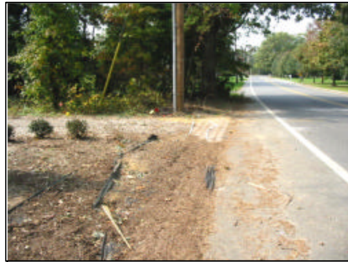
Figure 3. Close-up of crash site