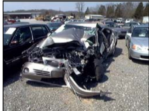
Figure 1. Damaged Pontiac Bonneville

This remote investigation focused on the performance of the Advanced Occupant Protection System (AOPS) in a 2001 Pontiac Bonneville ( Figure 1 ). The vehicle was equipped with side impact air bags, dual-stage frontal air bags, seat belt sensors, integrated manual 3-point lap and shoulder belts, and an Event Data Recorder (EDR). The Bonneville was involved in a run-off-road crash and sideswiped a number of trees, which resulted in the driver's side impact air bag deployment. The Bonneville subsequently sustained a frontal impact with two additional trees, which resulted in the deployment of the frontal air bag system. The vehicle was occupied by a 32-year-old female driver who was restrained by the 3-point lap and shoulder belt. She was probably out of position left due to the negative roadside slope. She initiated a forward trajectory in response to the multiple impacts, and loaded the manual restraint and intruded frontal components. She sustained forehead lacerations and a probable closed head injury from possible contact with the intruded with trees during the sideswipe event. The combination of her forward loading and frontal component intrusion resulted in a left humerus fracture, a left femur fracture, a right lower leg fracture and bilateral lower leg contusions and abrasions. She was pronounced dead at the scene prior to being removed from the vehicle.