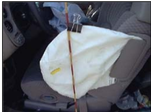
Figure 11. Left side view of driver's side impact air bag

The 2001 Pontiac Bonneville was equipped with side impact air bags for the driver and front right passenger positions. The side impact air bags were located in the outboard aspects of the front seat backs. The driver's left side impact air bag ( Figure 11 ) deployed as a result of the direct left side contact of the vehicle with the trees during the sideswipe event. The left side air bag impact sensor was located on the lower aspect of the left B-pillar. The driver's side impact air bag deployed forward from the outboard aspect of the driver's seat back. The plastic cover flap measured 8.0 cm (3.1") in width and 21.0 cm (8.3") in height and was hinged at the rear aspect. The driver's side impact air bag measured 37.0 cm (14.6") in height and deployed forward from the seat back approximately 38.0 cm (15.0"). A scuff was noted on the forward outboard aspect approximately 5.0 cm (2.0") aft of the forward seam. Body fluid (blood) was present on the inboard aspect of the driver's side impact air bag.