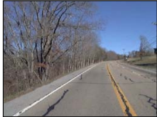
Figure 2. Eastbound approach for the Bonneville

The 32-year-old female driver was operating the 2001 Pontiac Bonneville in an eastbound direction on the east/west roadway on approach to the gradual right curve ( Figure 2 ). As the vehicle entered the curve and positive grade, the driver relinquished control for unknown reasons. The Bonneville drifted across the centerline and departed the left sloped roadside in a tracking mode. Due to the slope of the north roadside, the Bonneville was leaning to the left relative to the vehicle's longitudinal axis. The vehicle's EDR recorded the pre-crash vehicle speed five seconds prior to Algorithm Enable was 98 km/h (61 mph).