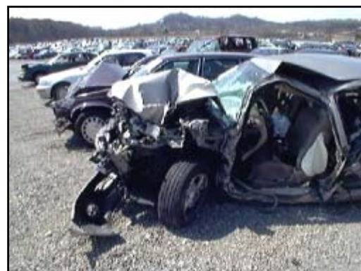
Figure 4. Left side damage to the Bonneville

The 2001 Pontiac Bonneville sustained moderate damage as a result of the five left side sideswipe impacts with the trees ( Figure 4 ). The second of the five impacts involved a tree less than 10.0 cm (3.9”) in diameter and was assigned as the impact for Collision Deformation Classification (CDC) and crush measurements, as the remaining left side impacts resulted in overlapping damage. The left side combined direct and induced damage began 68.0 cm (26.8”) aft of the rear axle and extended forward 415.0 cm (163.4”)