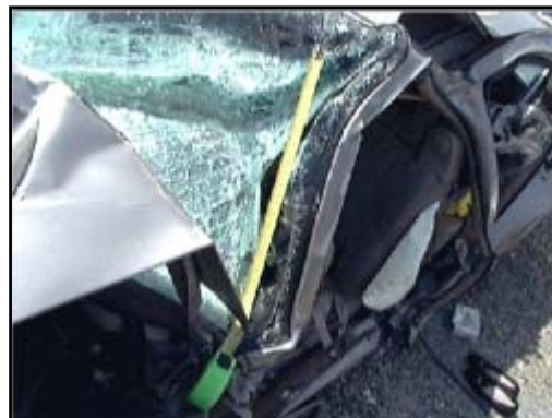
Figure 7. View of holed windshield