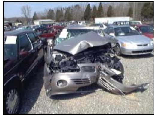
Figure 5. Frontal damage to the Bonneville

The Bonneville sustained moderate/severe frontal damage as a result of the frontal impact with the trees ( Figure 5 ). The direct contact damage began 31.0 cm (12.2") to the right of the centerline and extended 73.0 cm (28.7") across the frontal plane. The combined direct and induced damage measured 95.0 cm (37.4") across the frontal plane. The bumper fascia was fractured, abraded, and partially separated on the left aspect. The hood sustained abrasions from the tree impact, and was buckled and displaced to the left. The front axle was crushed on the left aspect and displaced rearward and slightly CCW. The front axle displacement resulted in the shortening of the left wheelbase by 32.0 cm (12.6") and the elongation of the right wheelbase by 12.0 cm (4.7"). The left A-pillar was deformed rearward and the left roof side rail was deformed upward from induced buckling. Six crush measurements were taken along the frontal plane and were as follows: C1 = 50.0 cm (19.7"), C2 = 73.0 cm (28.7"), C3 = 85.0 cm (33.5"), C4 = 76.0 cm (29.9"), C5 = 60.0 cm (23.6"), C6 = 29.0 cm (11.4"). The maximum frontal crush was located between C2 and C3 and measured 91.0 cm (35.8"). The CDC for the frontal impact was 12-FDEW-4.