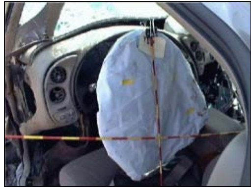
Figure 9. Deployed driver's air bag

The 2001 Pontiac Bonneville was equipped with dual-stage frontal air bags for the driver and front right passenger positions that deployed as a result of the frontal impact with the trees. The EDR summary report indicated that only the first stage deployed in this crash. The driver's air bag ( Figure 9 ) was housed in the center of the steering wheel hub with symmetrical I-configuration module cover flaps. Each cover flap measured 7.5 cm (3.0") in width and 11.0 cm (4.3") in height. The driver's air bag measured 55.9 cm (22.0") in diameter in its deflated state. The air bag was tethered by four internal straps and vented by two circular ports located on the rear aspect of the air bag at the 10 and 2 o'clock positions. Body fluid (blood) was present on the front and rear surfaces of the air bag from the driver.