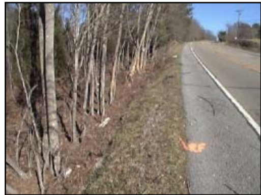
Figure 3. View of crash site and struck trees

As the 2001 Pontiac Bonneville departed the roadside in a tracking mode, the left side aspect impacted five trees in a sideswipe configuration ( Figure 3 ). The direction of force was in the 12 o'clock sector and the impact produced moderate left side damage. Although the force direction did not have a significant lateral component, the tree contact to the lower left B-pillar resulted in the deployment of the driver's side impact air bag. The vehicle's EDR recorded a "Near Deployment" event as a result of the sideswipe impact. The EDR recorded a 1.50 km/h (0.93 mph) velocity change for the left side impact with the trees. The Bonneville continued in a forward direction and impacted two additional trees with the front aspect. Impact resulted in moderate/severe damage to the Bonneville. The direction of force was in the 12 o'clock sector and the impact was sufficient to deploy the frontal air bag system in the vehicle. The maximum EDR recorded velocity change for the frontal impact was 38.8 km/h (24.1 mph). Due to the multiple impacts and masking damage, the WinSMASH program was not used to compute delta-V's for the impacts. The Bonneville rotated in a counterclockwise (CCW) direction around the trees and came to rest on the north shoulder and straddling the fog line.