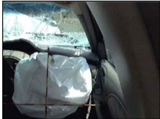
Figure 10. Deployed front right passenger's air bag

The front right passenger's air bag deployed from a top-mount module ( Figure 10 ). The front right passenger's air bag measured 50.0 cm (19.7") in width and 50.0 cm (19.7") in height in its deflated state. The air bag was tethered by four internal straps and was vented internally through the instrument panel. There was no contact evidence present on the front right passenger's air bag.