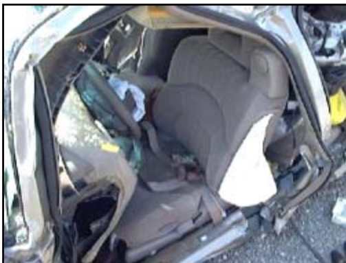
Figure 6. View of driver's seat area and intruded components

Interior damage to the 2001 Pontiac Bonneville was moderate and attributed to passenger compartment intrusion ( Figure 6 ). The windshield laminate was fractured and holed vertically along the left A-pillar as a result of impact forces. The opening in the windshield laminate measured 50.0 cm (19.7") in height and 7.0 cm (2.8") in width ( Figure 7 ). All left side glazing and the backlight were disintegrated from impact forces.