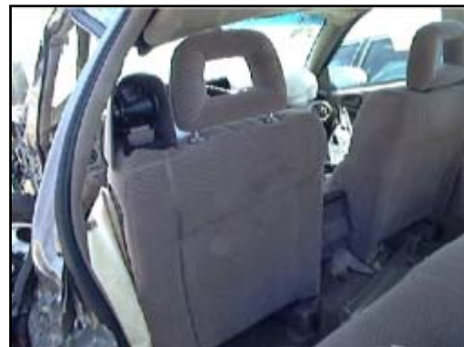
Figure 8. View of the rear aspect of the integrated shoulder belt retractor

The driver and front right positions of the Pontiac Bonneville were configured with integrated manual 3-point lap and shoulder belts with sewn latch plates and Emergency Locking Retractors (ELR's). The shoulder belt retractors were located on the outboard upper aspects of the front seat backs ( Figure 8 ) and the lap belt retractors were located on the outboard aspects near the lower B-pillars. The integrated shoulder belts did not have height adjustments. The driver's and front right passenger's manual restraints exhibited signs of historical usage. The driver's seat belt webbing was cut by rescue personnel to facilitate extrication of the driver, and loading evidence was present on the seat belt webbing in the NASS photographs. The EDR summary report indicated the driver's belt switch circuit status as "buckled." The front center position was configured with a lap belt that did not show any signs of historical usage.