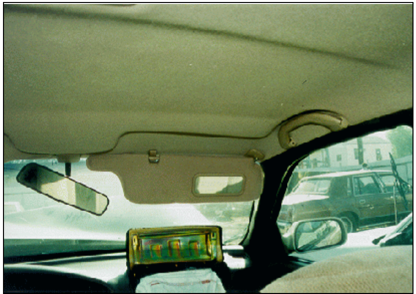
Figure 10. Front right seating position