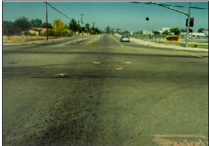
Figure 3. Area of impact/final rest—west

The case vehicle rotated counterclockwise and came to rest in the intersection. The other vehicle was