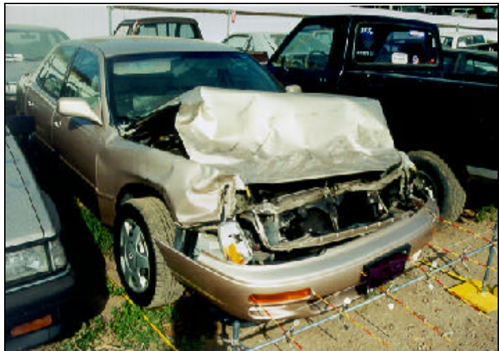
Figure 4. Front right, case vehicle