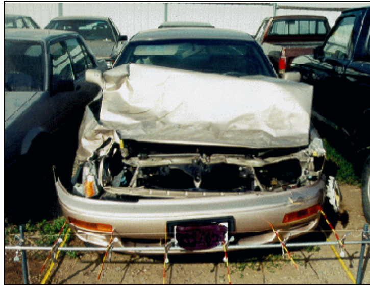
Figure 7. Front of case vehicle

The case vehicle sustained 144 cm (57 in) of direct contact damage that extended across the entire frontal end width of the vehicle. The residual crush was measured at both the bumper and above bumper levels (radiator support). The averaged maximum crush was 17 cm (7 in) at C5. The principle direction of force was within the 1 o'clock sector and was an estimated 20 degrees. The impact energy was managed by the forward structures of the vehicle. The damaged components included the bumper fascia and reinforcement bar, upper radiator supports, grille, and hood.