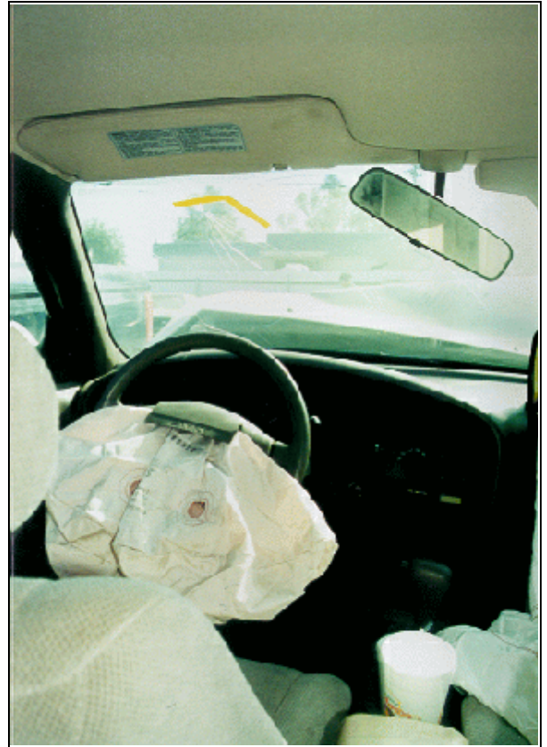
Figure 8. Driver's seated position

Given the fact that the air bag had a maximum post-crash excursion of 90 cm (35 in), and this excursion matched the distance to the seat back, it would have been impossible for the bag to fully inflate before this occupant engaged the air bag.