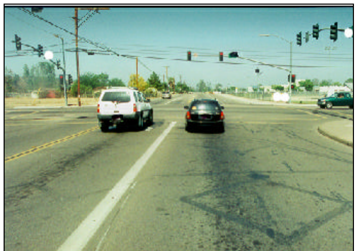
Figure 2. Approach to area of impact-other vehicle