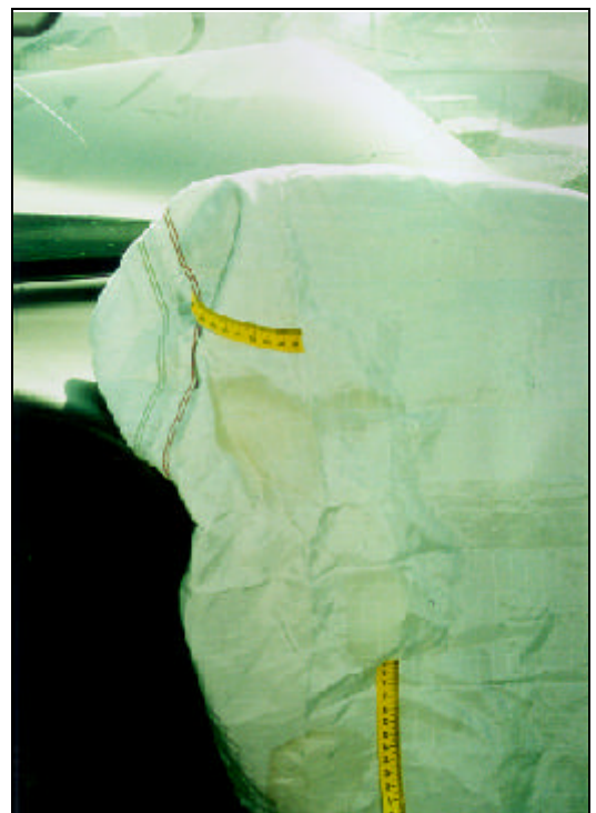
Figure 11. Front right passenger air bag