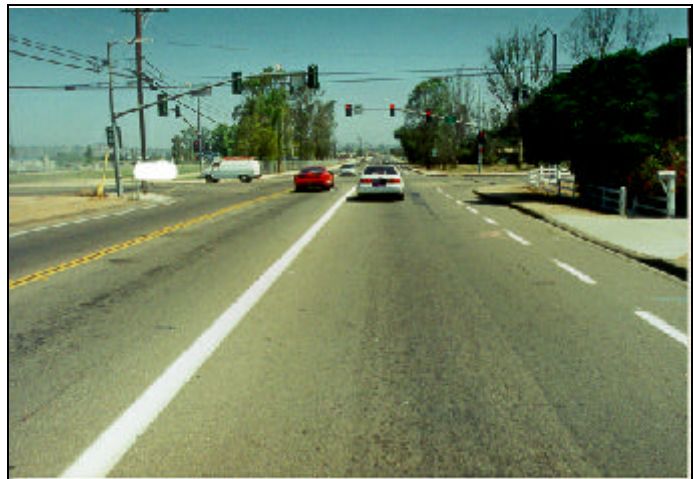
Figure 1. Approach to area of impact–case vehicle

This crash occurred in June, 2002 at 1115 hours in an unincorporated area of southern California. The crash occurred within the confines of a four-leg intersection. The northbound leg of the intersection is comprised of one northbound lane, one southbound lane, and one left turn lane. The speed limit is 80 km/h (50 mph). The westbound leg of the intersection is comprised of one westbound travel lane, one eastbound lane, and one left turn lane. The speed limit is 72 km/h (45 mph) during normal hours and 40 km/h (25 mph) during school hours. The 72 km/h (45 mph) speed limit was in effect at the time of the crash. All roads leading into and out of the intersection are of asphalt construction and are level. All roadways were dry and free of defects. The intersection is controlled by tri-color traffic signals.