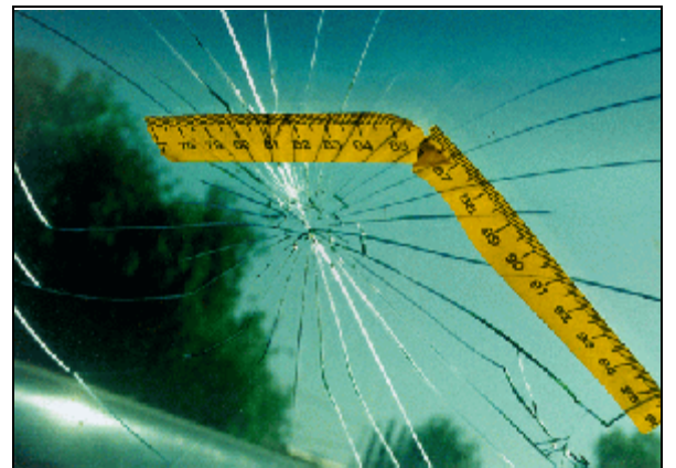
Figure 9. Windshield contact