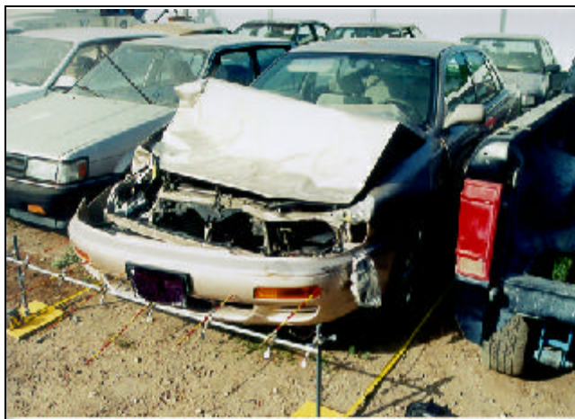
Figure 6. Left front, case vehicle

Description: 1996 Toyota Camry four-door VIN: 4T1BF12K9TUxxxxxx Odometer: Unknown Engine: 6 cyl / 183 CID Reported Defects: None Cargo: Booster seat Damage Description: Moderate override damage to grille, hood, and fenders. Vehicle towed from the scene. CDC: 01FDMW1 Delta V: Total 39 km/h (24mph) Longitudinal -37 km/h (23 mph) Latitudinal -13 km/h (-8 mph) Energy 29,176 joules (21,519 ft lbs)