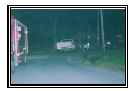
Figure 3. On-scene photograph showing pre-impact skid marks

The driver of the 1996 Ford F-150 was operating the vehicle southbound on approach to the T-intersection. At the time of the crash, the stop sign located on the northwest corner of the intersection had been displaced from a prior unrelated event, and was lying on the ground. It appeared that the driver did not detect the T-intersection as he approached it. Based on skid marks ( Figure 3 ) documented by the investigating officer, the driver became aware of the intersection and applied the brakes in full-lockup approximately 10.0 m (32.8') north of the intersection. The F-150 pickup truck traveled across the intersection and rotated