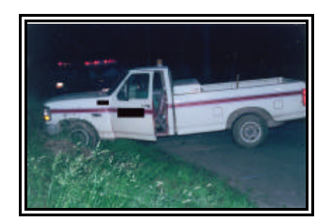
Figure 1. On-scene photograph of the 1996 Ford F-150 pickup truck

This on-site investigation focused on a single-vehicle crash that involved a 1996 Ford F-150 pickup truck ( Figure 1 ) that was equipped with a driver's air bag. The Ford pickup truck was occupied by an unrestrained 41-year-old male driver who was operating the pickup truck on approach to a T-intersection during the nighttime hours. The driver apparently failed to detect the intersection on his approach and applied the brakes in full-lockup as the vehicle entered the intersection. The unrestrained driver was displaced forward by impact prior to air bag deployment into the path of the driver's air bag cover flap. The pickup truck continued across the intersecting roadway and impacted a dirt embankment that measured approximately 109.2 cm (43.0") in height with the