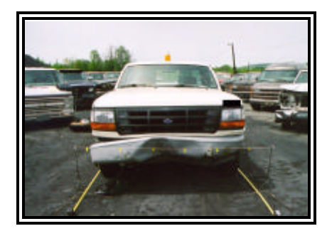
Figure 5. View of frontal damage to the Ford F-150 pickup truck

The Ford F-150 sustained moderate frontal damage as a result of the impact with the dirt embankment ( Figure 5 ). Numerous longitudinal abrasions were present on the lower aspect of the front bumper. The direct damage was concentrated on the lower aspect of the front bumper and involved the entire width of the bumper. The entire bumper was displaced vertically and rearward, and the bottom right corner was rotated slightly outward. The left frame rail was protruding forward from the bumper 3.8 cm (1.5"). Moderate deformation was present slightly right of the center aspect of the bumper from probable contact with a rock. The direct damage