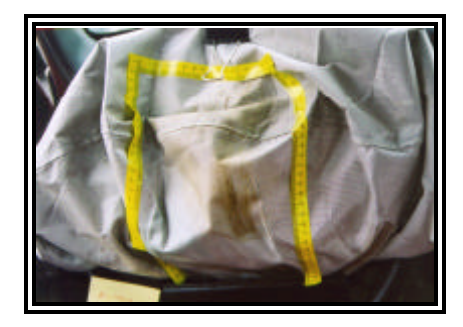
Figure 9. Rear bottom view of the driver's air bag showing the tissue and fabric transfers

measured 11.4 cm (4.5") in height and 6.4 cm (2.5") in width. A large tissue transfer from the driver's neck was also present on the bottom rear aspect of the air bag ( Figure 9 ). The transfer was located in the center aspect and measured 24.1 cm (9.5") in height and 10.2 cm (4.0") in width.