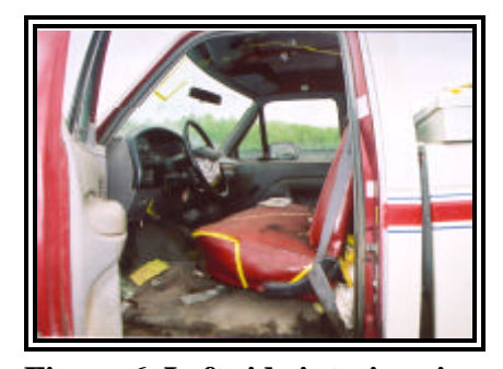
Figure 6. Left side interior view of the Ford F-150 pickup truck

The 1996 Ford F-150 pickup truck sustained moderate interior damage as a result of occupant contact (Figure 6). There was no damage to the windshield laminate, side glazing, or backlight glazing. There was no passenger compartment intrusion. The knee bolster was scuffed from the driver's left knee. The scuff was located 5.1 cm (2.0") to the left of the center of the steering column and extended 11.4 cm (4.5") to the left at an upward angle. Although there was no deformation to the steering wheel rim, the steering column was compressed as a result of occupant loading (Figure 7). The left shear capsule displacement measured 6.5 cm (2.5") and the right shear capsule displacement measured 7.0 cm (2.8"). Two pronounced body fluid (blood) spatters were present on the interior roof. The first was located 27.9 cm (11.0") left of center and 20.3 cm (8.0") rear of the windshield header. It extended 30.5 cm (12.0") rearward and measured 7.6 cm (3.0") wide at the rear aspect. The second was located 24.1 cm (9.5") left of center and 43.2 cm (17.0") rear of the windshield header. It measured 12.7 cm (5.0") in width at the rear aspect. Clear body fluid spatter was noted on the driver's sun visor, the left aspect of the windshield header, and on the top aspect of the windshield to the right of the steering column. A large amount of body fluid (blood) was present on the left and center aspects of the bench seat where the driver came to rest. Lateral abrasions were present