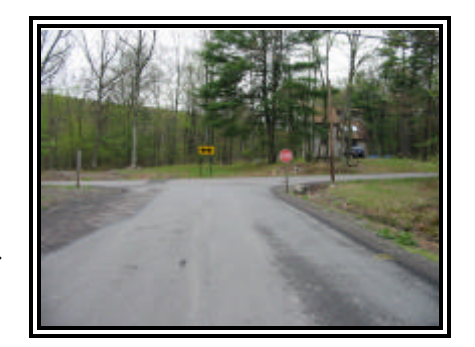
Figure 2. View of T-intersection looking south

This crash occurred during the nighttime hours in June 2001 at a Tintersection of two rural roadways (Figure 2). At the time of the crash, there were no adverse weather conditions and the asphalt roadway was dry. The unmarked north/south roadway consisted of one travel lane in each direction that were bordered by gravel shoulders. The roadway was straight and had a 2 percent negative southbound grade. The unmarked east/west roadway consisted of one travel lane in each direction and was bordered by gravel shoulders. A dirt embankment was present on the south side of the roadway opposite the mouth of the intersection and was offset to the west aspect. The embankment consisted of moderately packed dirt and rocks and was located 2.1 m (6.9') from the south road