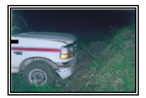
Figure 4. View showing final rest of the pickup truck relative to the dirt embankment

The 1996 Ford F-150 pickup truck impacted the dirt embankment with the front bumper area ( Figure 4 ). Impact resulted in moderate damage to the pickup truck. The principal direction of force was in the 12 o'clock sector, and the impact was sufficient to deploy the frontal air bag system in the vehicle. The damage algorithm of the WinSMASH program computed a barrier equivalent speed of 18.7 km/h (11.6 mph) based on crush measurements along the front bumper. The longitudinal delta-V component was -18.7 km/h (-11.6 mph) and the lateral delta-V component was 3.3 km/h (2.1 mph). Based on the direct contact damage to the bumper, it appeared that the bottom aspect of the bumper struck a moderately-sized rock with the center aspect as