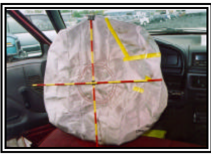
Figure 8. Driver's air bag

Due to the yielding nature of the soft soil, the air bag deployed late in the crash sequence as the front bumper engaged the embankment. The driver's air bag was circular in shape and measured 67.3 cm (26.5") in diameter. The air bag was vented by two circular ports at the 12 o'clock sector that measured 3.8 cm (1.5") in diameter. The air bag was tethered by two internal straps that measured 11.4 cm (4.5") in width and were located at the 12 and 6 o'clock aspects. The air bag excursion measured 27.9 cm (11.0"). Body fluid (blood) transfers were present on the upper right quadrant on the face of the air bag. Green fabric transfers from the driver's shirt were present on the bottom rear aspect of the air bag. The fabric transfer was offset slightly to the left and