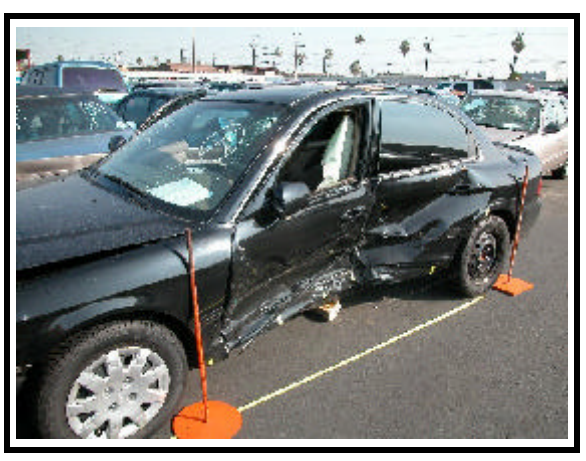
Figure 3 . Left side damage (impact 1) to case vehicle.