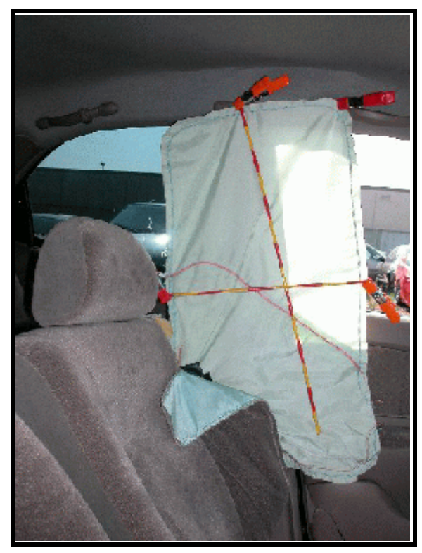
Figure 10. Driver's side air bag