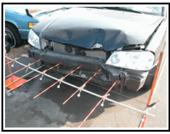
Figure 4 . Front damage to case vehicle (impact 2).