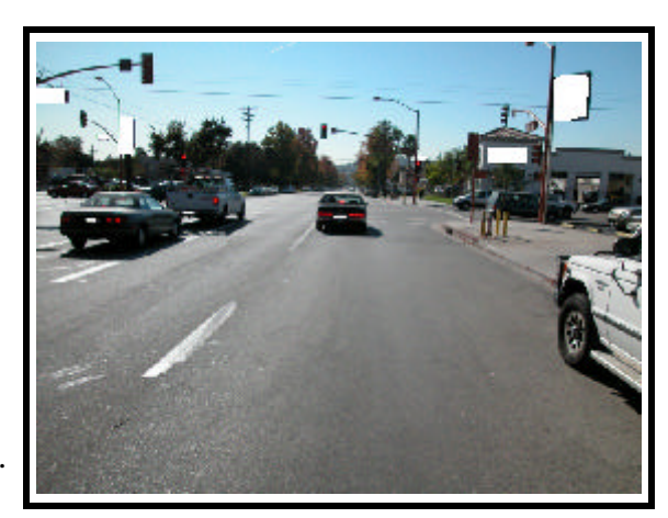
Figure 1. Case vehicle stopped at intersection.

The side air bag involved crash occurred in an urban area of southern California in October, 2002 at 2151 hours. This was a two vehicle angle/broadside type crash which occurred within the confines of a four leg intersection. The north-south roadway is a two-way, undivided asphalt street. The southbound roadway consists of two through lanes, and a left turn lane. The roadway is bordered by raised concrete curbs. The speed limit for southbound traffic is 40 km/h (25 mph). The east-west roadway is a two-way, undivided asphalt street. The westbound roadway consists of