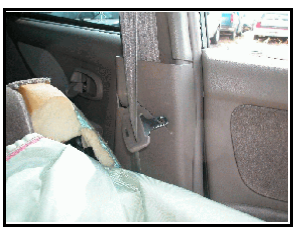
Figure 8. Driver's seat belt