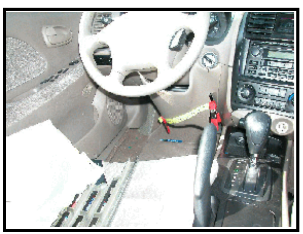
Figure 7. Deformed knee bolster