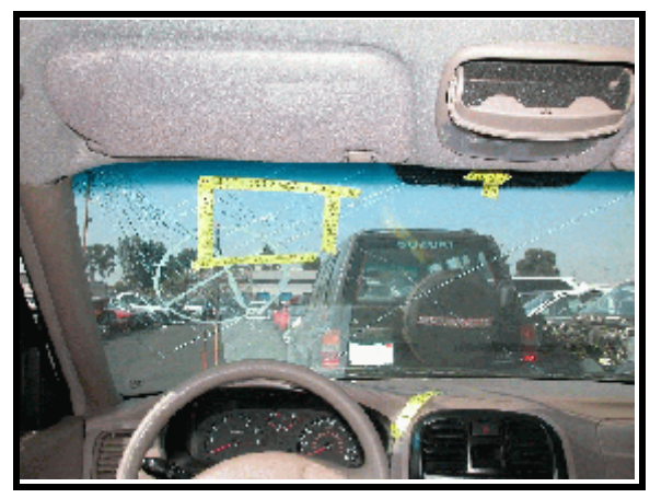
Figure 6. Windshield contact

The Kia Optima was equipped with three-point safety belts at all five seating positions with switchable retractors (ELR/ALR) at all but the driver's position (ELR only). The driver's seat belt was found locked, in a retracted position-- pinned/locked between the B-pillar and the seat. The vehicle was also equipped LATCH anchors and tether connections for the two rear outboard seats.