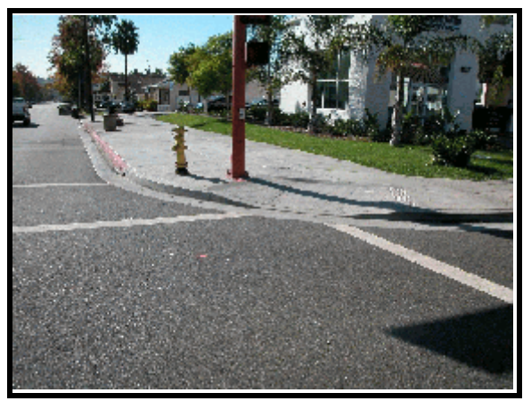
Figure 2. Impact 2 (pole)

The driver of the Toyota complained of chest pain. He did not seek medical treatment.