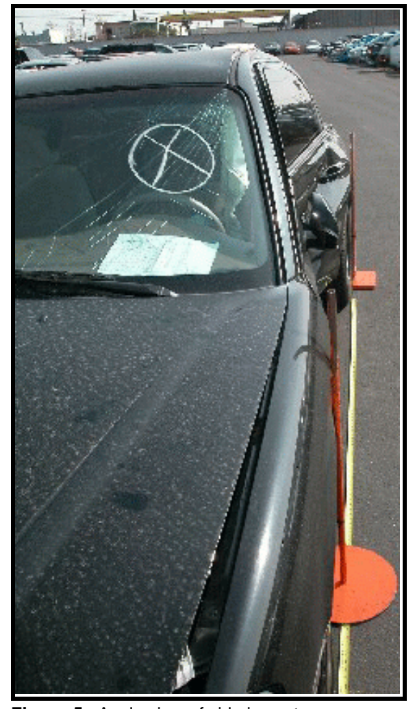
Figure 5. Angle view of side impact

The case vehicle sustained major damage to its left side. The case vehicle's engine started, but was towed from the scene. It was later declared a total loss by the insurance company.