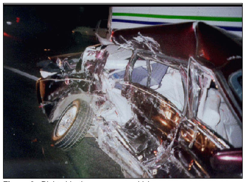
Figure 3. Right side damage, case vehicle

roadway. The driver of the other vehicle was ejected through the left side window. This vehicle came to rest on its roof/right side facing north. The driver came to rest just north of this vehicle.