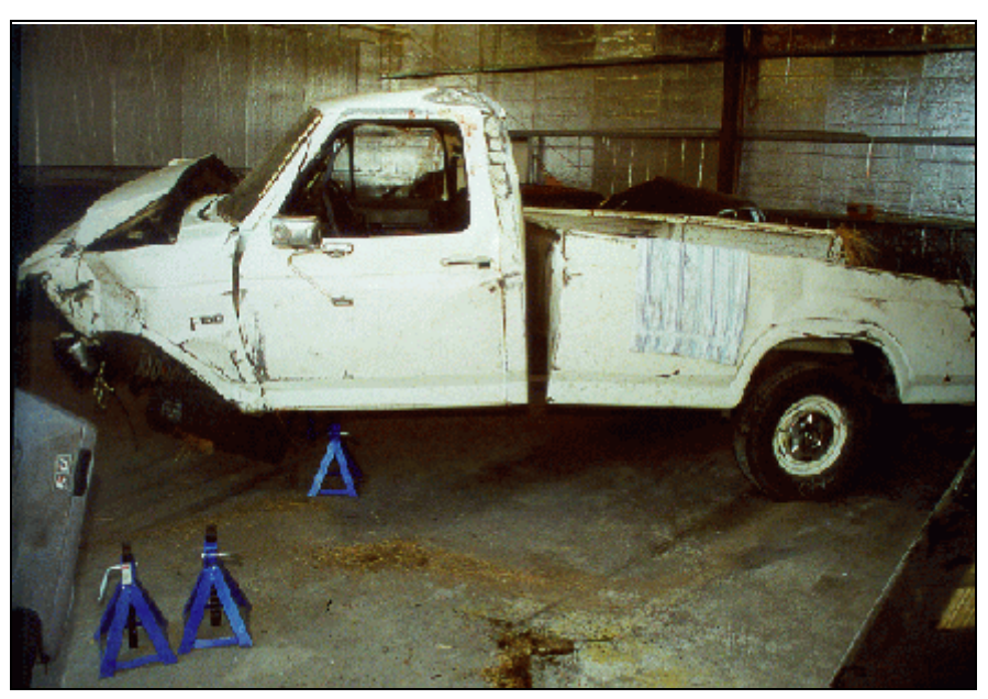
Figure 10. Left side, other vehicle