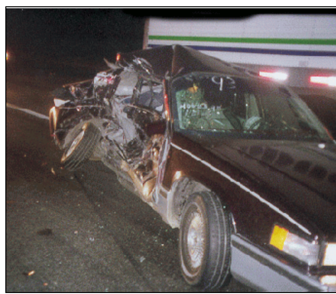
Figure 6. Right side damage, case vehicle