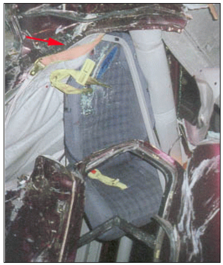
Figure 13, Child safety seat, image rotated and webbing enhanced

The 10-month-old female rear right occupant was seated in a forward facing/booster seat with what appears to be a modified harness system. The seat was designed with a 5-point harness, however there was no visual sign of the hip straps being available and/or used. It is believed that the seat was anchored to the vehicle and the child was strapped into the seat. The hip straps were not being used and do not appear to be available at the time of the crash. At impact, the child's initial motion would have been forward and to the right. As the right rear door intruded into the passenger compartment, this occupant engaged the door panel and side glass frame. The facial injuries were most likely related to the frame, while the abdominal injuries were related to the door panel.