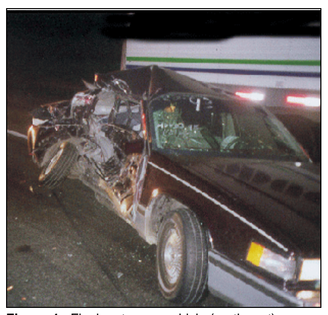
Figure 1. Final rest, case vehicle (northwest)

This crash occurred in September, 2001 at 2000 hours. The crash occurred within the confines of a four leg intersection. The southbound leg of the intersection is comprised of a southbound travel lane, a left hand turn lane, and a northbound through lane. The roadway is controlled by an overhead tri-color signal that was red at the time of the crash. The eastbound leg of the intersection is comprised of a westbound through lane, two left hand turn lanes, and one eastbound through lane. The roadway is controlled by an overhead tricolor signal that was green at the time of the crash. The weather was clear and the asphalt roadway was dry at the time of the crash. It was dark; streetlights were present and operating at the time of the crash. The speed limit was 89 km/h (55 mph) for all intersecting roadways.