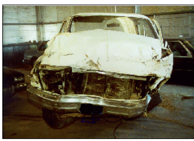
Figure 9. Front of other vehicle (1985 Ford F150 pickup)