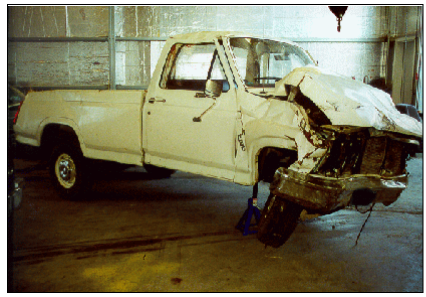
Figure 4. Front right, other vehicle

The rear right occupant sustained serious injuries, including: a fragmented spleen (AIS=3), a liver laceration (AIS=2), a left mandible fracture, a deep abrasion to the upper forehead, contusions to the right cheek, a lip abrasion, abrasion to right side of face, contusions to the inner aspect of the right knee, contusion to front of right thigh, contusion to the front of upper right shin, and abrasions/dicing injuries to right side of face. She was transported from the scene by helicopter. After arrival,