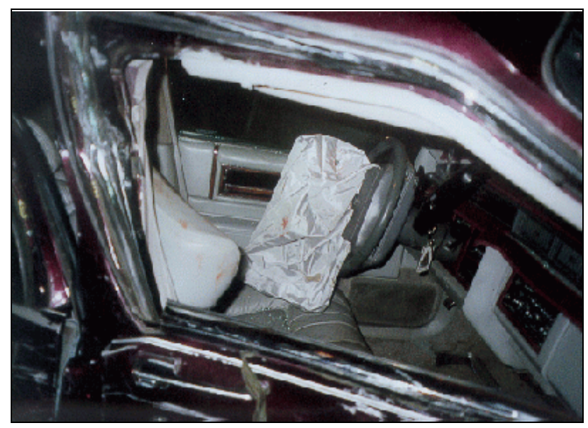
Figure 11. Driver's air bag

The 5-year-old female rear left occupant was seated in a forward facing position. She was wearing the available lap and shoulder belt. At impact, she was projected forward and