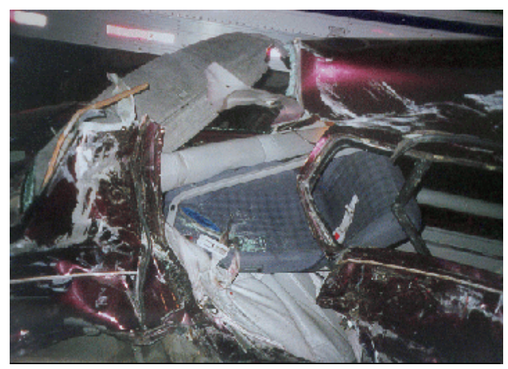
Figure 7. Child safety seat as it was found in vehicle

The 10-month-old female rear right occupant was seated in what appears to be an older model Cosco Highback Booster seat. The manufacturer's recommendations for use of this seat are: between 10- 18 kg (22 and 40 lbs) use 5-point harness and for 14-32 kg (30-70 lbs) remove harness and use as a beltpositioning booster. This seat is designed to have a 5-point harness, however, the hip straps were not present. This is likely due to mis-threading of the harness. According to police, this occupant was "properly secured in a child restraint seat." Based on the location of the vehicle shoulder belt in the photos, it would appear that the belt was being used with the child seat. The photos represent the position of the seat after emergency personnel had extricated and transported the child.