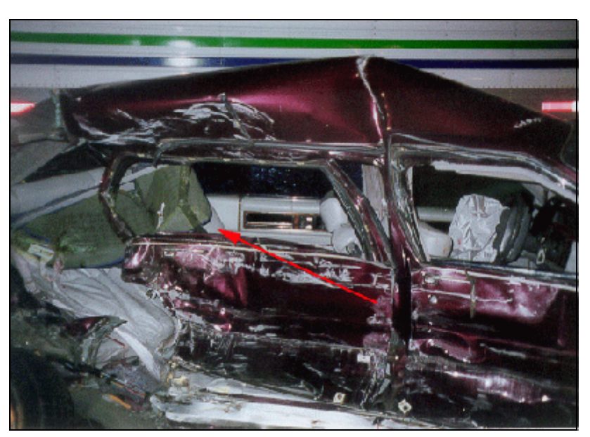
Figure 12. Rear right seat

to the right. She likely engaged the seat belt to some degree. The intrusion to the right side of the vehicle appears to have pushed the right side child seat to the left where it engaged this occupant's right upper leg, fracturing the femur.