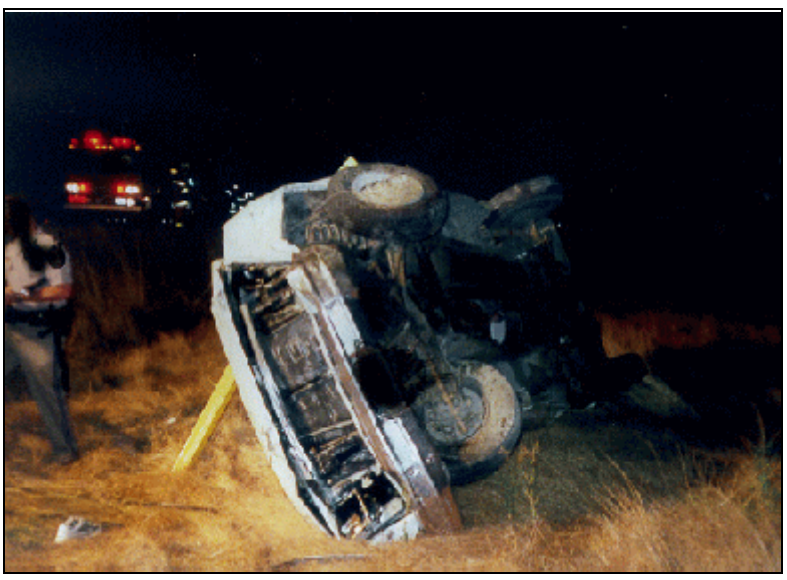
Figure 2. Final rest, other vehicle (south)

The case vehicle spun out in a clockwise direction and came to rest in the eastbound lanes. The other vehicle rolled over (6 quarter rolls) and left the