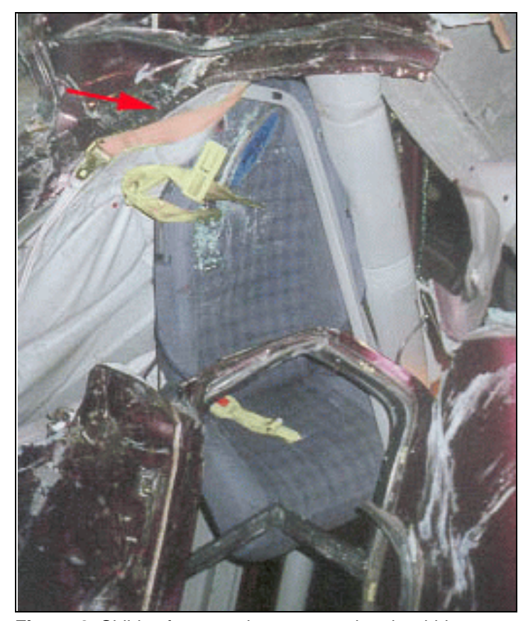
Figure 8, Child safety seat, image rotated and webbing enhanced