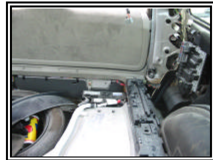
Figure 5. View of battery and fuse panel

The vehicle's battery was located in the rear cargo area on the left aspect. The fuse panel was also located in the rear cargo area on the rear aspect of the left interior panel. The battery and fuse panel were exposed at the time of the vehicle inspection ( Figure 5 ).