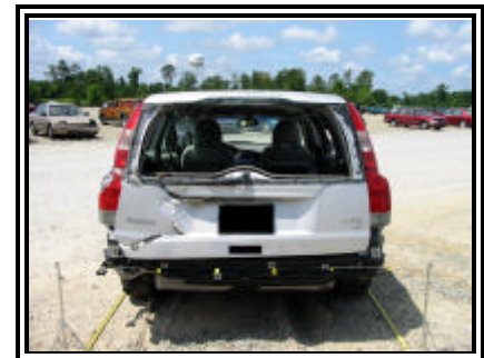
Figure 8. View of tailgate and rear damage to the Volvo V70