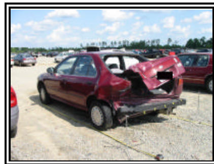
Figure 9. Rear damage to the 1996 Nissan Sentra

The 1996 Nissan Sentra sustained moderate rear aspect damage as a result of the impact with the Volvo V70 ( Figure 9 ). The bumper fascia was separated from the vehicle. The direct contact damage on the bumper fascia began 15.9 cm (6.3") left of center and extended laterally 48.3 cm (19.0") to the rear left corner. The left rear quarter panel and trunk lid were abraded crushed forward from direct contact. The combined direct and induced damage involved the entire width of the Sentra and measured 123.2 cm (48.5"). The entire bumper beam was displaced as a result of the crush on the rear left corner. The backlight was disintegrated as a result of induced damage. The CDC for the impact with the Volvo was 07-BYEW-4. Six crush measurements were documented along the rear bumper beam and were as follows: C1 = 40.6 cm (16.0"), C2 = 31.1 cm (12.3"), C3 = 23.2 cm (9.1"), C4 = 14.0 cm (5.5"), C5 = 4.4 cm (1.8"), C6 = 0.0 cm.