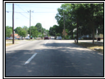
Figure 2. Northbound approach for the Volvo V70

The front aspect of the Ford Mustang impacted the left side aspect of the Volvo. Impact resulted in moderate damage to the Volvo, and police-reported moderate damage to the Mustang. The damage algorithm (missing vehicle routine) of the WinSMASH program computed a total delta-V of 12.0 km/h (7.5 mph) based on the crush profile of the Volvo. The longitudinal component was -7.7 km/h (-4.8 mph) and the lateral component was -9.2 km/h (-5.2 mph). Based on the elongated damage pattern on the Volvo, it appears the Mustang sustained contact with the Volvo as the Volvo continued in a northbound direction across the front of the Mustang. The Volvo was redirected in a CCW rotation through the intersection and traveled toward the outboard curb of the northbound roadway. The Volvo rotated approximately 160 degrees and the rear aspect of the Volvo struck the rear aspect of a parked 1996 Nissan Sentra that was parked along the outboard curb. The damage algorithm of the WinSMASH program computed a total delta-V for the Volvo of 14.0 km/h (8.7 mph) and a total delta-V of 22.0 km/h (13.7 mph) for the Nissan Sentra. The secondary impact displaced the Sentra forward and the rear aspect was deflected CCW onto