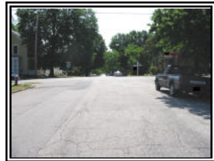
Figure 3. Eastbound approach for the Ford Mustang