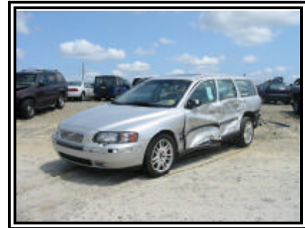
Figure 1. Damaged 2001 Volvo V70

This on-site investigation focused on a three-vehicle crash that involved a 2001 Volvo V70 ( Figure 1 ) that was equipped with a side impact occupant protection system (SIPS) that deployed as a result of a side impact intersection collision with a 1999 Ford Mustang. The Volvo was occupied by a 45-year-old female driver who was restrained by the manual 3-point lap and shoulder belt. At the initial left side impact, the driver's side air bag (SIPS II) and the left side inflatable curtain (IC) deployed. The driver initiated a lateral trajectory in response to the left side impact force and loaded the lap and shoulder belt and the deployed driver SIPS II air bag and IC. She sustained a minor abrasion on her left torso area from possible clothing friction as a result of the side air bag deployment. The Volvo was redirected in a counterclockwise (CCW) rotation across the intersection and struck the rear of a parked 1996 Nissan Sentra with the rear aspect. The Volvo came to rest on the roadway and the driver exited the vehicle under her own power. She did not receive medical treatment at the scene and was not transported. She did not seek follow-up medical treatment.