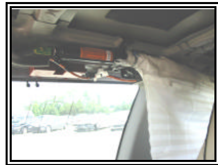
Figure 12. View of stored gas inflator

The stored gas inflator for the IC was mounted longitudinally on the left roof side rail between the C- and D-pillars ( Figure 12 ). According to Volvo, the gas in the IC was a mixture of argon and helium. The circular inflator canister was located 7.6 cm (3.0") aft of the left C-pillar and measured 30.5 cm (12.0") in length and 3.8 cm (1.5") in diameter. The inflator was manufactured by Autoliv. The inflation tube of the IC was configured in a circular pattern and overlapped the forward aspect of the inflator canister 7.6 cm (3.0") and was secured to the canister by a 1.0 cm (0.4") wide circular clamp.