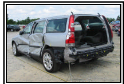
Figure 7. View of rear left damage to the Volvo V70