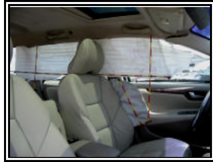
Figure 11. View of left side IC and SIPS II

The left IC deployed downward from the left roof side rail as a result of the left side impact with the Ford Mustang ( Figure 11 ). The tear seam measured 144.8 cm (57.0") in length and extended from the left A-pillar to 8.9 cm (3.5") aft of the left C-pillar. In its deflated state, the IC measured 143.5 cm (56.5") in length, 30.5 cm (12.0") in height at the forward aspect and 33.0 cm (13.0") in height at the rear aspect. The IC was structured with various chambers with the chamber edges fused together. The configuration of the IC chambers was designed to concentrate the air channels to areas where it was likely for occupants to strike their heads. Volvo information stated that the IC inflates to full volume in approximately twenty-five thousandths of a second and remains inflated for approximately three seconds. The air bag was tethered at the forward aspect. The graduated tether measured 27.9 cm (11.0") in width at the aft aspect and 1.3 cm (0.5") in width at the forward aspect at the left A-pillar. The tether was anchored to the left A-pillar 45.7 cm (18.0") above the bottom aspect of the A-pillar and was cut post crash. There were no identifiable contacts present on the IC.