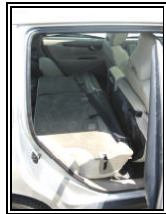
Figure 4. View of folded rear seats

The rear seating positions were configured with a 60/40 bench seat with folding backs. The seat cushions were designed to fold forward against the front seat backs and the rear seat backs folded downward behind the forward-folding cushions ( Figure 4 ). At the time of the vehicle inspection, the rear left seat cushion was removed and the rear seats were folded forward. Both the seat cushions and seat backs were equipped with locking mechanisms in the upright and full-down positions. The rear seat was configured with fixed-height head restraints that pivoted fore and aft for the outboard positions. The center position was configured with an adjustable head restraint in the full-down position and a fold down center arm rest. A retractable 60/40 split cargo net was present in the rear seat backs that extended vertically to the roof. The cargo net was fully retracted at the time of the vehicle inspection, however, the driver stated that at the time of the crash the cargo net was extended to the roof.