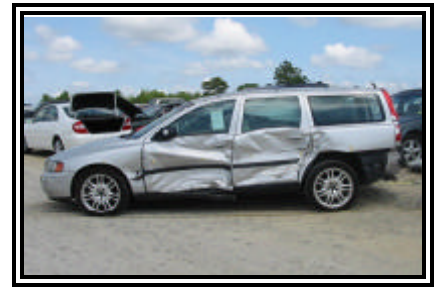
Figure 6. View of left side damage to the VolvoV70

The Volvo V70 sustained moderate rear aspect damage as a result of the secondary impact with the parked Nissan Sentra ( Figures 7 and 8 ). The direct contact damage began 11.4 cm (4.5") left of center on the lift gate and extended laterally 68.6 cm (27.0") to the rear left corner. Paint transfers from the Sentra were present on the lift gate. The lift gate was fractured as a result of direct contact 39.4 cm (15.5") left of center. The fracture extended diagonally to the bottom left aspect and upward to the base of the glazing. The rear bumper fascia was separated from the vehicle and not available at the time of the vehicle inspection. The plastic honeycomb filler sustained minor crush and deformation on the rear left corner aspect. The combined direct and induced damaged involved the entire width of the rear plane. Six crush