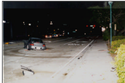
Figure 5. Post-crash spin-out and final rest of the Porsche.

The Porsche rotated rapidly approximately 90 degrees in a CW direction. During this rotation, the inboard aspect of the left front wheel impacted and mounted the barrier curb. The vehicle's center of gravity continued in a westerly direction as the left front fender area impacted a hedge and the left front fender/tire/wheel area impacted a square concrete utility pole ( Figure 4 ). This impact resulted in severe damage to the left front area.