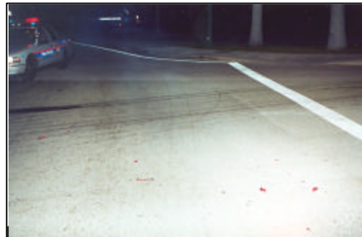
Figure 2. Westbound approach to the curb impacts. Note the pre-impact tire mark(s).

The 42-year old unrestrained male driver of the Porsche was traveling in a westerly direction on the two-lane road. He was attempting to negotiate a left curve in a posted 48 km/h (30 mph) speed zone. The vehicle broke traction and drifted to the right in a slight counterclockwise (CCW) yaw as evidenced by the right side tires marks on the asphalt road surface. The police computed a speed of 98 km/h (61 mph) based on the critical curve tire scuffmarks noted in Figure 2 . The Porsche drifted across the mouth of the intersection and into the curb at the northwest quadrant of the intersection ( Figure 2 ).