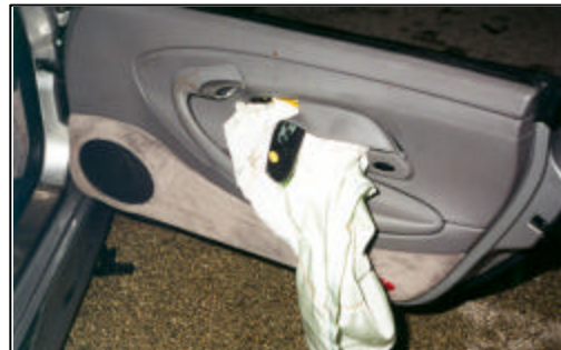
Figure 9. Deployed front right side impact air bag.

The 1999 Porsche 911 Carrera was equipped with door mounted side impact air bags for the front seat positions. The sensors for the side impact air bags were located on the driver and passenger side rocker panels. Although the Porsche sustained a significant left side impact, the front left door side impact air bag did not deploy. The front right door panel mounted air bag did deploy. The police images of the deployed side impact air bag depict a large bag ( Figure 9 ), typical of providing torso and head protection. There were no lateral impacts to the