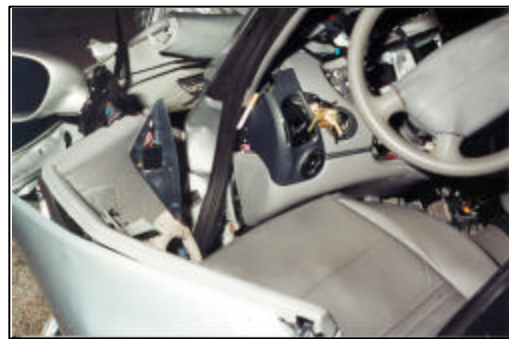
Figure 8. Driver's left leg contact to instrument panel mounting bracket.