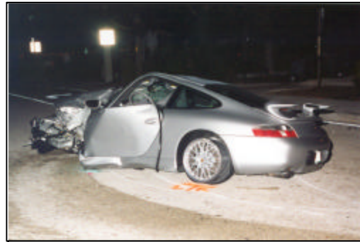
Figure 1. Final rest position of the 1999 Porsche 911 Carrera.

This remote investigation focused on the performance of the side impact air bag and the injury mechanisms for the front right occupant in a 1999 Porsche 911 Carrera. The Porsche was equipped with redesigned frontal air bags and door panel mounted head and torso side impact air bags for the front seating positions. The Porsche ( Figure 1 ) was involved in a run-off-road crash resulting in impacts with a curb, guy wire, hedge, and a concrete utility pole. The right door panel mounted side impact air bag deployed. The vehicle was occupied by an unrestrained 42-year old male driver and a