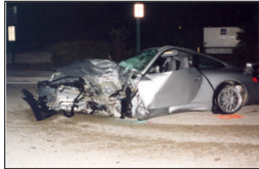
Figure 6. Left side damage to the Porsche.

The seventh and most significant impact to the Porsche involved the left front side area contacting the square concrete utility pole ( Figure 6 ). The damage from this event consisted of a fractured left front axle, extensive lateral deformation of the left front fender, hood, left frame rail, lateral and longitudinal displacement of the A-pillar, induced deformation of the front left door, fractured windshield, and shattered front left glazing. The Collision Deformation Classifications (CDC) for this multiple event crash is identified in the following Table 1 .