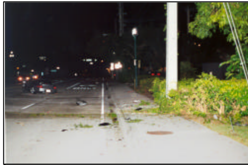
Figure 4. Area of impact with guy wire, hedge and concrete utility pole.

Based on the trajectory of the vehicle, the front right aspect of the Porsche impacted a cable guy wire that snagged the vehicle and induced a rapid clockwise (CCW) rotation. The damage to the vehicle from this impact was masked by a subsequent pole impact and separation of the bumper fascia. In addition, the available police photographs for this remote investigation did not document the guy wire impact damage. The guy wire fractured under tension during this impact event.