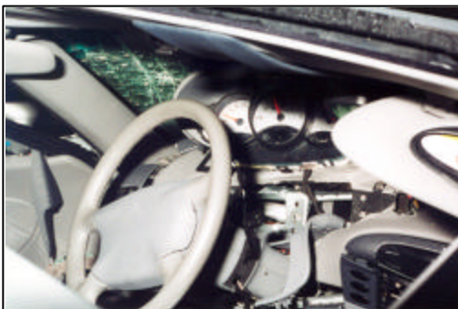
Figure 7. Vertical and longitudinal intrusion of the left instrument panel.

The 1999 Porsche 911 Carrera sustained severe interior damage as a result of intrusion and occupant contacts. The most significant intrusion appeared to be the vertical and longitudinal displacement of the left side instrument panel ( Figure 7 ). Other intrusions include longitudinal displacement of the left toe pan, lateral displacement of the left side-kick panel forward of the A-pillar, and vertical and longitudinal displacement of the steering assembly.