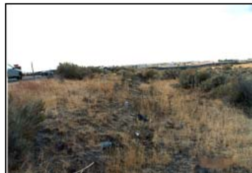
Figure 3. Southbound view of the rollover trajectory

The right side tires furrowed into the roadside, which tripped a rollover with the right side leading. The vehicle rolled eight quarter-turns over a distance of approximately 57 m (186') and came to rest upright facing northeast on the roadside ( Figure 3 ). The unrestrained driver was ejected through the backlight during the rollover event. Miscellaneous clothes and store-bought items that were present in the vehicle were also ejected and deposited along the vehicle's rollover trajectory ( Figure 4 ). The vehicle's final rest position was behind tall sagebrush, which made it difficult to detect the vehicle from the roadway. The driver came to rest 6.4m (21.0') south of the vehicle's final rest position and 11.3 m (37.0') west of the roadside.