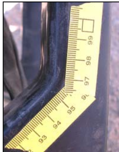
Figure 20. Close-up of left side seat belt scuff