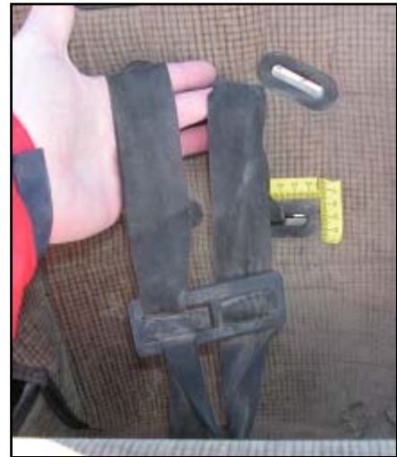
Figure 16. View of harness straps and harness retainer clip

The left harness strap was permanently routed through the retainer clip and the right harness strap was inserted from the front aspect versus the rear aspect ( Figure 16 ). Since the right harness strap was routed through the retainer clip from the front, it was not held in position by the plastic locking tab on the retainer clip. The left harness strap had two complete twists in the webbing between the rear harness bracket and the retainer clip. It had two additional complete twists between the retainer clip and the latch plate. The right harness strap had one complete twist between the rear harness bracket and the retainer clip and one complete twist between the retainer clip and the latch plate. It was not known how tight the harness straps were in relation to the child passenger, however, the harness adjustment webbing on the front aspect of the CSS was extended 35.6 cm (14.0"). The latch plate showed abrasions indicative of regular usage.