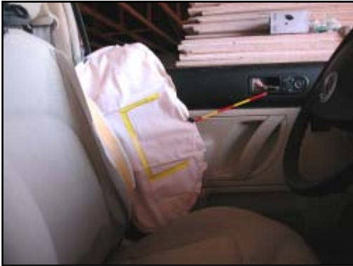
Figure 23. Area of abrasion on the driver's side impact air bag

The side impact air bags measured 55.9 cm (22.0”) in height and 33.0 cm (13.0”) in width and extended vertically from the seat cushion to the top of the seat back. The air bags were not tethered and were vented back through the module. The inboard aspect of the driver’s side impact air bag exhibited an area of light abrasion that measured 19.7 cm (7.8”) in height and 10.2 cm (4.0”) in width ( Figures 23 and 24 ). The abrasion was a result of engagement against the outboard aspect of the interior seat back due to the impeded deployment caused by the seat cover.