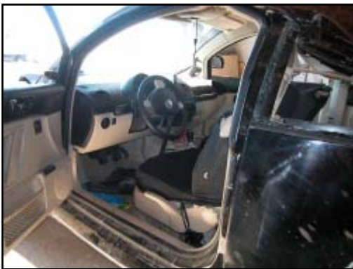
Figure 9. View of deformed steering wheel rim and knee bolster

The interior damage to the 1998 Volkswagen Beetle was attributed to passenger compartment intrusion and occupant contact. Both side doors were operational. The rear hatch was displaced and jammed. The windshield laminate exhibited a minor fracture on the right aspect. The left door glazing, right door glazing, left rear glazing, and backlight glazing disintegrated from impact forces. The bottom half of the steering wheel rim was deformed forward 2.5 cm (1.0") from occupant contact and there were no identifiable contacts to the knee bolster ( Figure 9 ). The rear view mirror assembly was separated from the roof and hanging by the wiring harness. The driver's head restraint was deformed slightly CW, but exhibited no contact evidence. The front right head restraint was completely separated from the seat back. Heavy body fluid transfers (blood) were present on the head restraint fabric, and it appeared to have pulled vertically out of the seat back during the rollover ( Figure 10 ). Two heavy lateral dirt transfers were present above