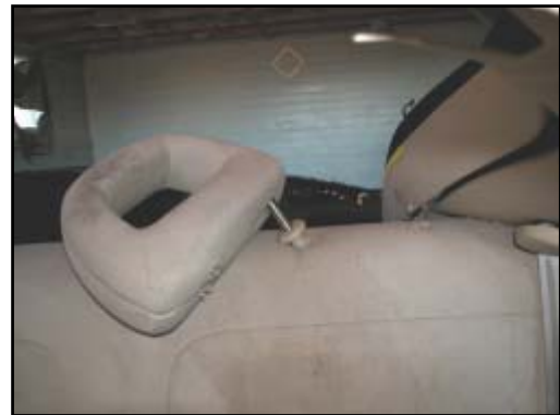
Figure 11. Damaged rear left head restraint

The rear left head restraint was displaced as a result of the lateral left C-pillar intrusion and subsequent ejection of the driver ( Figure 11 ). The head restraint rotated CCW approximately 170 degrees, based on the on-scene photographs, and the outboard stainless steel post was completely separated from the head restraint and seat back. The inboard post was displaced and partially separated from the seat back. Scuff marks were present on the interior trim panel of the left C-pillar from probable contact with the driver during the ejection.