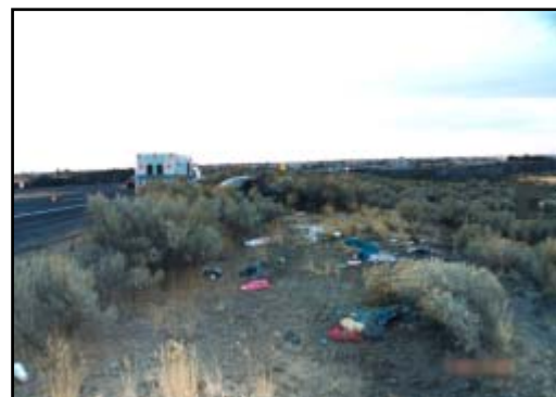
Figure 4. Miscellaneous contents ejected from the vehicle

The crash was not discovered for approximately eight hours. A passing motorist detected the vehicle's reflection behind the sagebrush and determined that a crash had occurred. The passing motorist telephoned the police and reported the crash. Police found the female driver of the Volkswagen south of the vehicle's final rest position. She was found face-down and was