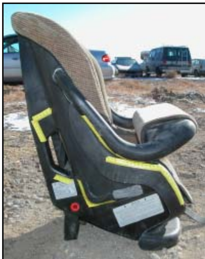
Figure 18. View of right side damage on the CSS

The Cosco convertible CSS sustained moderate damage as a result of the crash ( Figures 18 and 19 ). Abrasions on the left outboard aspect of the tray shield began 11.4 cm (4.5”) below the pivot point and extended 17.8 cm (7.0”) forward along the left arm of the tray shield. A heavy abrasion from loading against the vehicle seat belt webbing was present on the left outboard aspect of the forward-facing belt path that measured 7.6 cm (3.0”) in width along the contour of the belt path and 0.6 cm (0.3”) in length ( Figure 20 ). The right outboard aspect of the belt path was moderately abraded on the top aspect from loading against the shoulder belt and on the bottom aspect from loading against the lap belt. The shoulder belt abrasion measured 3.8 cm (1.5”) in width and the lap belt abrasion measured 5.1 cm (2.0”) in width. A large “V”-shaped abrasion was located below and forward of the forward-facing belt path on the right side of the CSS as a result of engagement against the plastic right rear side panel of the Volkswagen Beetle. The abrasion measured 7.6 cm (3.0”) in height and 7.0 cm (2.8”) in width. Contact with the plastic right side panel of the vehicle interior also resulted in scuffs on the right outboard aspect of the tray shield that measured 20.3 cm (8.0”) along the tray shield arm and scuffs on the right front side plane of the CSS that measured 19.1 cm (7.5”) in length.