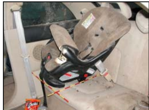
Figure 17. Post-crash position of the CSS

The CSS was found in the rear right seating position and installed forward-facing with the manual 3-point lap and shoulder belt ( Figure 17 ). The vehicle seat belt was in the locked mode and was routed through the forward-facing belt path. At the time of the vehicle inspection, the CSS had not been moved since the time of the crash. The CSS was found leaning to the left toward the center of the vehicle at a 20 degree angle from vertical and rotated slightly CW within the vehicle seat belt. The right front aspect of the CSS was resting directly against the right rear interior panel. Although the vehicle seat belt was buckled, the CSS was able to move greater than 2.5 cm (1.0") side-to-side and fore-and-aft. The kickstand was in the down position for forward facing use. The distance between the seat back and kickstand measured 16.5 cm (6.5") on the left side and 2.5 cm (1.0") on the right side.