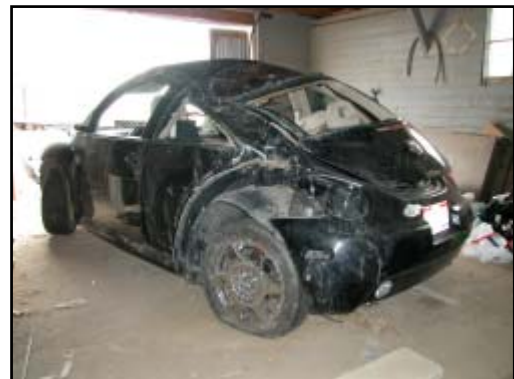
Figure 7. Damaged 1998 Volkswagen Beetle

The 1998 Volkswagen Beetle sustained moderate damage as a result of the rollover ( Figure 7 ). The front bumper fascia and both head lamp assemblies were separated from the vehicle. The left mirror was separated. Heavy abrasions from ground contact were present on the upper left A-pillar, left roof side rail, upper left B-pillar, and upper left C-pillar. Minor diagonal abrasions were present on the left front fender, left door, and left rear quarter panel. The left rear fender was fractured and separated. Grass was deposited in the left front door area and the left rear window frame. The left front and left rear alloy wheels were abraded. The left front wheel was turned inward