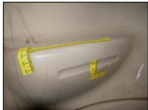
Figure 12. View of abrasion and laceration on right rear armrest

The right rear interior plastic panel/armrest sustained a 14.6 cm (5.8") long scuff on the top aspect from contact with the CSS. A small tear was present 4.4 cm (1.8") below the top aspect of the armrest. The tear began 12.7 cm (5.0") aft of the forward aspect of the armrest and measured 1.6 cm (0.6") in length ( Figure 12 ).