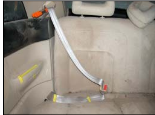
Figure 14. View of rear right seat belt

The rear right seat belt ( Figure 14 ) was found buckled and routed through the forward-facing belt path of the CSS during the vehicle inspection. In the buckled position, the length of the shoulder belt webbing measured 62.2 cm (24.5") between the D-ring and the latch plate. The lap belt portion measured 58.4 cm (23.0") between the latch plate and outboard anchor. The retractor was found to be in the locked mode. The Volkswagen's rear right latch plate showed no abrasions indicative of historical usage. The plastic housing on the latch plate was abraded due to the loading of the webbing during the rollover. Stretching of the webbing began at the stop button and extended 21.6 cm (8.5") upward. A black linear transfer that extended laterally across the webbing was adjacent to the stop button, which was a result of loading against the right side plastic surface of the CSS belt path.