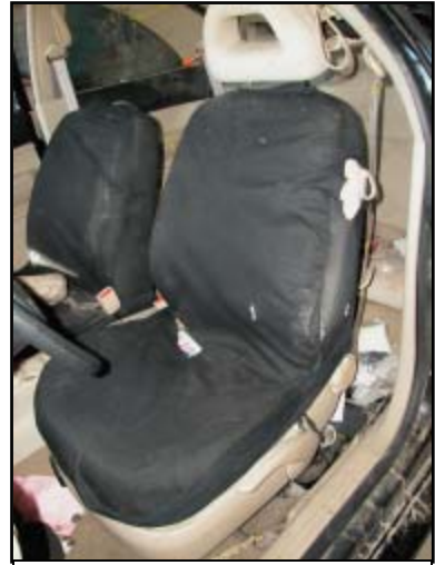
Figure 5. View of driver's aftermarket seat cover

Both front seat backs were configured with after-market seat covers ( Figure 5 ). There were no identifying labels on the seat covers indicating the manufacturer. It appeared that the outboard aspects of the covers were cut to gain access to the release levers on the upper outboard aspects of the seat backs. The covers were installed over the seat back from the top and subsequently pulled over the seat cushion. Elastic loops were present on the inboard and outboard aspects of the seat covers near the rear aspect of the cushion, but were not secured at the time of the vehicle inspection. The underside of the seat cover revealed a clear plastic pouch with plastic hooks for the elastic loops, however, the plastic pouch had not been opened and the hooks were not in use. A content label was also present on the underside of the seat cover adjacent to the hooks and instructions that included a warning that read “Warning: Not recommended for use on seats equipped with air bags.” In addition, a warning label was present