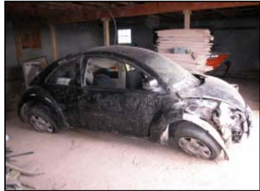
Figure 8. Right side view of damaged Volkswagen Beetle

approximately 30 degrees and the left rear wheel was displaced slightly rearward. The left C-pillar and left rear aspect of the roof were crushed vertically with a lateral component due to the rollover. The maximum roof crush was located at the left C-pillar area. The roof exhibited lateral abrasions. The rear hatch was displaced. The right roof side rail and right C-pillar sustained moderate abrasions. The top aspect of the right door was displaced outward which created a gap between the top aspect of the door frame and the roof side rail that measured 17.8 cm (7.0"). The right front fender was fractured and separated. The right sill sustained lateral crush that measured 10.2 cm (4.0") and was located 78.7 cm (31.0") rear of the right A-pillar.