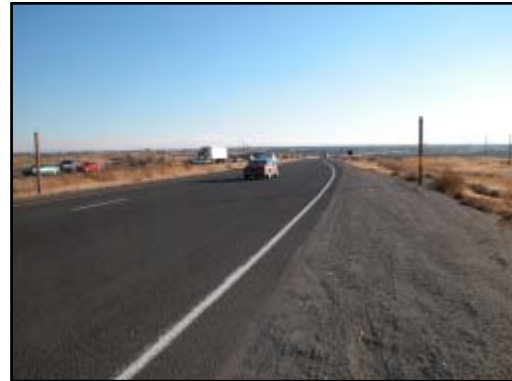
Figure 2. Southbound approach for the Volkswagen Beetle

The 24-year-old female driver was operating the vehicle in a southbound direction on the state roadway during the nighttime hours ( Figure 2 ). Police reported that the driver was operating the vehicle under the influence of alcohol. As the vehicle approached the crash site, the driver failed to negotiate the left curve and traveled onto the roadside in a tracking motion. Police estimated the vehicle's pre-crash speed to be 106 km/h (66 mph). The Volkswagen Beetle traveled in a south direction along the roadside for approximately 52 m (170'). The driver attempted to regain control by steering left. She overcorrected which caused the vehicle to initiate a counterclockwise (CCW) yaw for approximately 47 m (154').