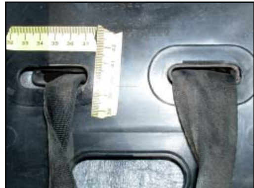
Figure 21. Close up of displaced left plastic sleeve and harness straps

There was no loading evidence on the right harness strap, however minor stretching of the left harness strap was present above the harness retainer clip as a result of the child's loading to the harness system. Plastic sleeves were secured in each harness slot by plastic tabs on the rear upper and rear lower aspects of the sleeves. Due to the loading of the left harness strap, the lower left plastic sleeve was displaced forward from the harness slot 1.3 cm (0.5"). Figure 21 depicts the displaced left plastic sleeve.