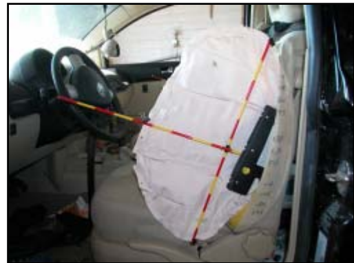
Figure 22. Deployed driver's side impact air bag

The side impact air bags deployed forward from the respective seat backs through a vertical tear seam on the forward aspect of the seat backs. The tear seam measured 57.2 cm (22.5") in height. The side impact air bag was housed in a plastic module surrounded by Styrofoam filler within the seat back. The interior plastic cover flap measured 22.9 cm (9.0") in height and 10.2 cm (4.0") in width and exhibited three small tabs on the forward aspect ( Figure 22 ).