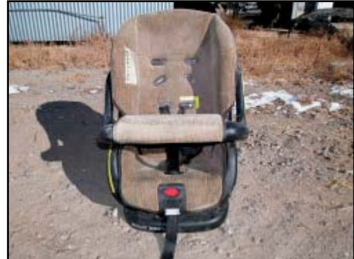
Figure 15. Cosco Regal Ride CSS

The Cosco Regal Ride ( Figure 15 ) was a convertible CSS with a tray shield installed forward-facing in the rear right position of the Volkswagen Beetle. A locking clip was not required due to the use of the ALR, and the locking clip was found attached to the rear aspect of the CSS. The CSS manufacture date was June 2002 and the CSS was not listed on the NHTSA recall list. The 1998 Volkswagen Beetle was not equipped with lower anchors, but was configured with tether anchors on the rear outboard positions. Although the CSS was originally configured with a tether strap, it was not present on the CSS at the time of the inspection. The harness system was routed through the lowest harness slots that were intended for rear-facing use rather than through the top reinforced slots. The harness retainer clip was positioned 19.1 cm (7.5") above the latch plate.