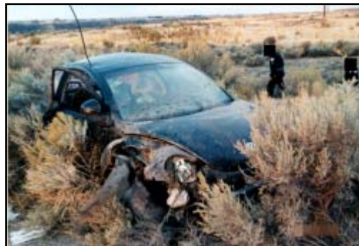
Figure 1. On-scene photograph of the 1998 Volkswagen Beetle at rest

This on-site investigation focused on the performance of a forward-facing convertible child safety seat (CSS) that was installed in a 1998 Volkswagen Beetle. The Beetle was occupied by a 24-year-old female driver and a 14-month-old female child passenger. The driver was unrestrained and the child was restrained in a forward-facing convertible CSS in the rear right position. The driver was operating the vehicle during nighttime hours under the influence of alcohol and failed to negotiate a left curve. The vehicle departed the right roadside and the driver overcorrected by steering left. The Beetle initiated a counterclockwise yaw and rolled over two complete turns. The unrestrained driver was ejected