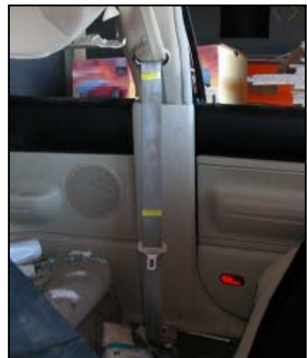
Figure 13. View of post-crash driver's seat belt

The 1998 Volkswagen Beetle was configured with manual 3-point lap and shoulder belts with sliding latch plates and fixed D-ring anchors for each outboard seating position. The rear seat was not configured with a center seat position, and was not equipped with a manual restraint. The lap portions of the front seat restraints were anchored to steel bars mounted longitudinally along the inboard lower sill areas. The bars measured 27.9 cm (11.0") in length and 1.0 cm (0.4") in diameter. The driver's seat belt was configured with an Emergency Locking Retractor (ELR) and the remaining seat belts were configured with switchable ELR/Automatic Locking Retractors (ALR). Retractor pretensioners were present for the driver and front right passenger seat belts, but it could not be determined if they fired as a result of the rollover. The driver's seat belt was found in the stowed position at the time of the vehicle inspection, and was not utilized by the driver in the crash ( Figure 13 ). In its stowed position, the driver's seat belt webbing exhibited minor body fluid (blood) transfers that were consistent with a body fluid pattern on the adjacent interior B-pillar panel. The driver's latch plate showed signs of minor historical usage.