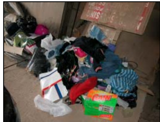
Figure 6. Additional cargo items found in the vehicle

Additional cargo in the vehicle at the time of the crash included numerous plastic bags of new clothing, a large box of powder laundry detergent, a television game system, quarts of motor oil, bags of snack foods, audio tapes, video tapes, and a pizza ( Figure 6 ).