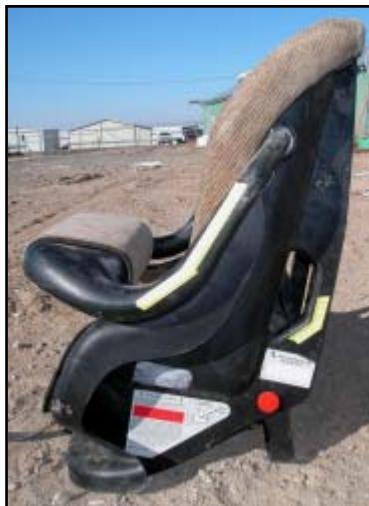
Figure 19. View of left side damage to the CSS