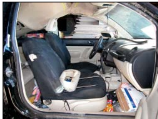
Figure 10. View of front right seat and separated front right head restraint