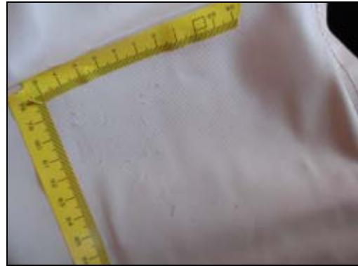
Figure 24. Close-up of the abraded area on the air bag

Both after-market seat covers sustained damage as a result of the side impact air bag deployment. The side impact air bags deployed within the seat covers that stretched to accommodate the air bag expansion and relaxed as the air bags deflated. Lacerations in seat-cover fabric were noted on the lower outboard aspects near the seat bight. In addition, the outboard aspects showed significant stretch marks in the polyester fabric along the entire height of the seat back.