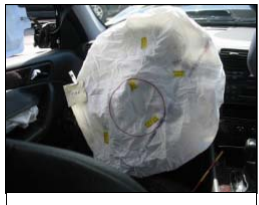
Figure 16. Deployed driver's frontal air bag.