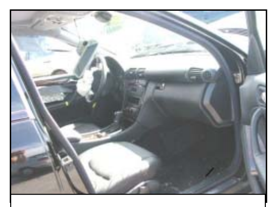
Figure 17. Non-deployed front right frontal air bag.