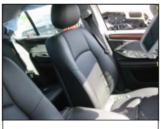
Figure 10. Driver's safety belt.

The 2003 Mercedes-Benz C240 was equipped with manual 3-point lap and shoulder belts for all five seating positions. The front safety belts equipped retractor-mounted were with pretensioners. driver's safety The belt pretensioner fired as a result of the crash. The driver's safety belt (Figure 10) was configured with a sliding latch plate and a belt-sensitive. Emergency Locking Retractor (ELR). The front safety belts were also equipped with height adjustable D-rings. The front left was adjusted in the full-up position and the front right was adjusted in the full-down position. The driver utilized the safety belt in this crash.