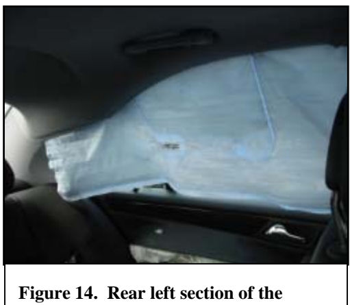
Figure 14. Rear left section of the inflatable curtain.