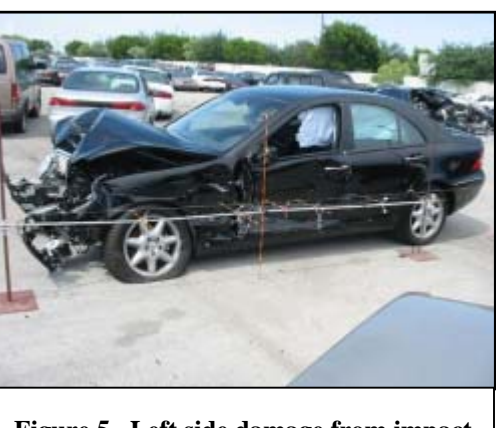
Figure 5. Left side damage from impact with the BMW.

The 2003 Mercedes-Benz C240 sustained moderate left side damage ( Figure 5 ) as a result of the impact with the 1995 BMW 325i. The direct contact damage width measured 274.0 cm (107.8") and began 83.0 cm (32.6") forward of the left rear axle and extended rearward where it terminated beyond the forward edge of the left rear door. The maximum crush was 12.0 cm (4.7") and was located 179.0 cm (70.5") forward of the left rear axle. The damage from the impact with BMW consisted of lateral crush to the left front fender, left front door, and shattered left front glazing. The researcher