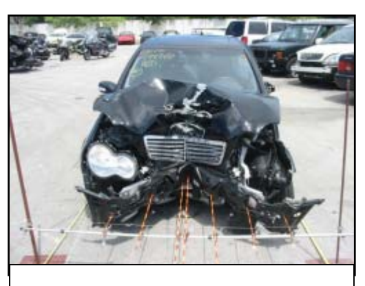
Figure 6. Pole impact damage to the front center area of the Mercedes-Benz.

The Mercedes-Benz impacted a utility pole with its front and sustained moderate damage ( Figure 6 ). The direct contact damage began 36.0 cm (14.2") inboard of the front right bumper corner and measured 33.0 cm (13.0") in length. The maximum crush from this impact was located 49.0 cm (19.3") inboard of the front right bumper corner and measured 44.0 cm (17.3"). Six crush measurements were documented on the front bumper using a combined direct and induced damage width of 111.0 cm (43.7") and were as follows: C1 = 0.0, C2 = 0.0, C3 = 23.0 cm (9.1"), C4 = 37.0 cm