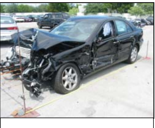
Figure 1. 2003 Mercedes-Benz C240.

This remote investigation focused on the performance of the Side Impact Inflatable Occupant Protection System in a 2003 Mercedes-Benz C240. The system included door panel mounted side impact air bags and inflatable curtain air bags for the four outboard seating positions. The Mercedes-Benz was also equipped with dual stage frontal air bags, an occupant-sensing device for the front right seat, and retractor mounted safety belt pretensioners for the four outboard seating positions. The Mercedes-Benz (Figure 1) was involved in an intersection collision with a 1995 BMW 325i. Subsequently, the Mercedes-Benz was