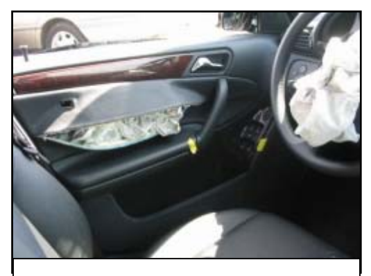
Figure 9. Driver contacts to the front left door panel and armrest.