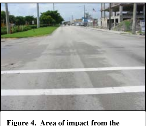
Figure 4. Area of impact from th Mercedes-Benz approach.

components were -11.0 km/h (-6.8 mph) and 7.0 km/h (4.3 mph) respectively. The total velocity change for the BMW was 16.0 kmh (9.9 mph). The longitudinal and lateral components were -13.9 kmh (-8.6 mph) and -8.0 kmh (-5.0 mph) respectively.