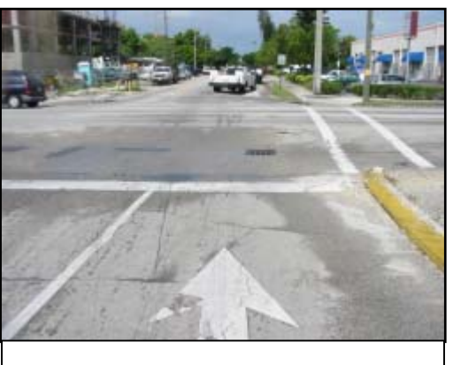
Figure 3. BMW approach to intersection.

The frontal area of the BWM impacted the forward aspect of the Mercedes-Benz's left side (Figure 4). The resultant directions of force were within the 10 o'clock sector for the Mercedes-Benz and 1 o'clock for the BMW. This impact was sufficient to deploy the front left and rear left door panel mounted side air bags and left side curtain air bag in the Mercedes-Benz. The impact resulted in the BMW's driver's frontal air bag deployment. The missing vehicle algorithm of the WinSMASH program computed a total velocity change of 13.0 km/h (8.1 mph) for the Mercedes-Benz. The longitudinal and lateral