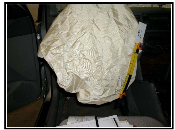
Figure 13. Face of driver's air bag

(3.1 in) from the left edge and 29.0 cm (11.4 in)