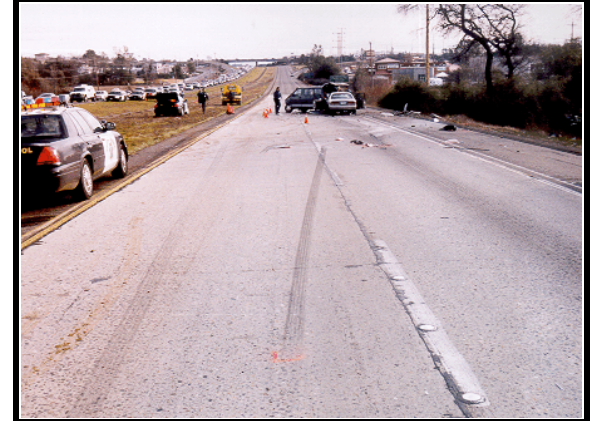
Figure 3 . Path of travel (Buick LeSabre/Ford Aerostar), eastbound

The case vehicle and the Volkswagen Passat were traveling westbound. The Ford Aerostar van and Buick LeSabre were traveling eastbound. The Passat was traveling to the right and in front of the case vehicle.