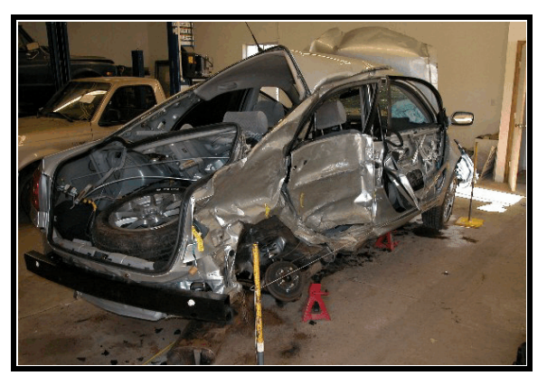
Figure 7. Right rear, Toyota Corolla

Direct damage from Impact 3 (Buick LeSabre) began and the front left corner of the vehicle and extended across the entire front end. The bumper, bumper fascia, bumper backing bar, and