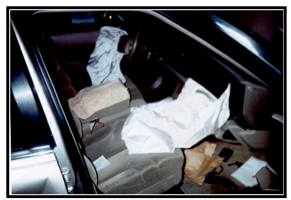
Figure 25. Front air bags, Buick LeSabre