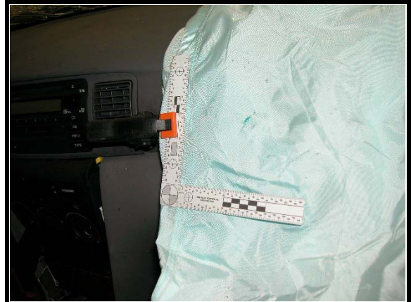
Figure 14 . Cut on upper left portion of front right passenger's air bag

from the top of the air bag face. The cut was as a result of contact to the windshield during deployment.