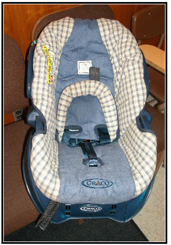
Figure 28. Front of Graco child seat

child seat interior with essentially the whole left side of her body. As the impact progressed, the right rear door intruded into and fractured the child seat exacerbating the left side injuries, including the clavicle and skull fractures. This occupant also sustained right side skull and rib fractures and lacerations to the spleen and liver. Given the amount of intrusion and the fact that the restraint remained in place, the injuries were a combination of impact and compression as the child safety seat was intruded on by the right door panel. At impact with the Buick, this occupant would have responded to the 1 o'clock direction of force by moving forward (with her back) and to the right.