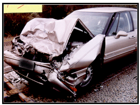
Figure 24. Front left, Buick LeSabre