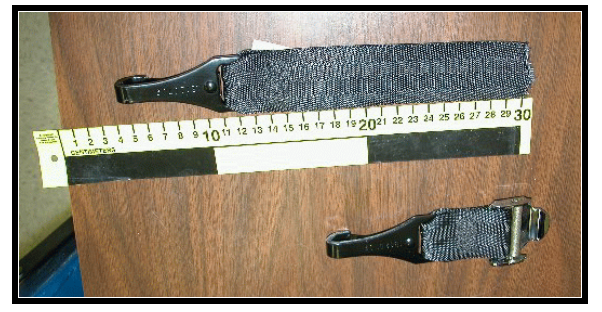
Figure 18. LATCH tethers