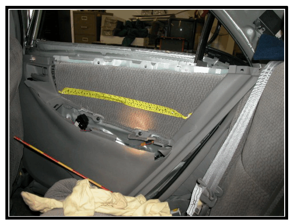
Figure 27. Damage to right rear door side panel seat belt system-causing abrasions to her shoulder due to impact, intrusion, and contact with infant safetv seat

bag-causing abrasions and contusions to her face/head and also caused her to bite her lip.