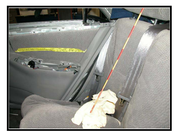
Figure 10. Right rear door intrusion