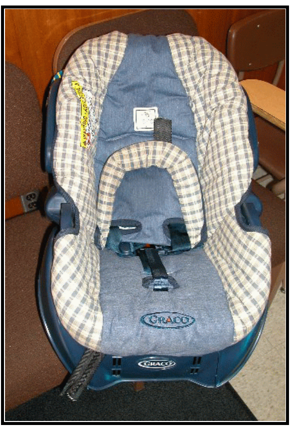
Figure 19. Front of Graco child seat