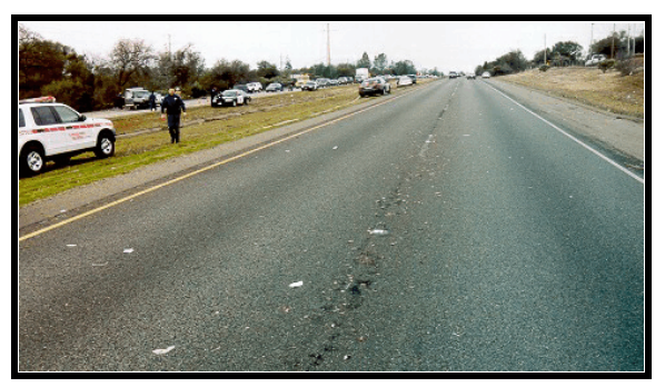
Figure 1. Path of travel (Corolla), westbound

This three vehicle crash occurred in January, 2004 at 0750 hours. The crash occurred in the eastbound lanes of a divided four lane US highway. The eastbound and westbound travel lanes are divided by a dirt center median. The westbound roadway is bordered on the north by a solid white painted line and an asphalt shoulder and is bordered on the south by a solid white painted line and an asphalt/dirt center median. The eastbound roadway is bordered on the north by a solid white painted line and an asphalt shoulder. The roadway was dry and free of defects. According to the National Weather Service, the visibility was 16 km (10 miles), the wind was calm, and the temperature was 2 degrees C (36 degree F). The speed limit is 105 km/h (65 mph).