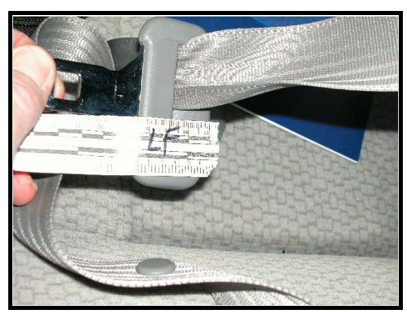
Figure 11. Driver's seat belt

The Toyota Corolla was configured with manual 3point lap and shoulder belts with sliding latch plates for all five seating locations. The front seat restraints were configured with adjustable shoulder belt anchorages with the driver's side adjusted to the mid position and the front right passenger's adjusted to the full down position. The driver's manual restraint was configured with an emergency locking retractor (ELR). The remaining restraints were configured with switchable retractors that were in the ELR mode. Both front restraints were equipped with seat belt pretensioners that actuated as a result of the impact with the1997 Buick LeSabre.