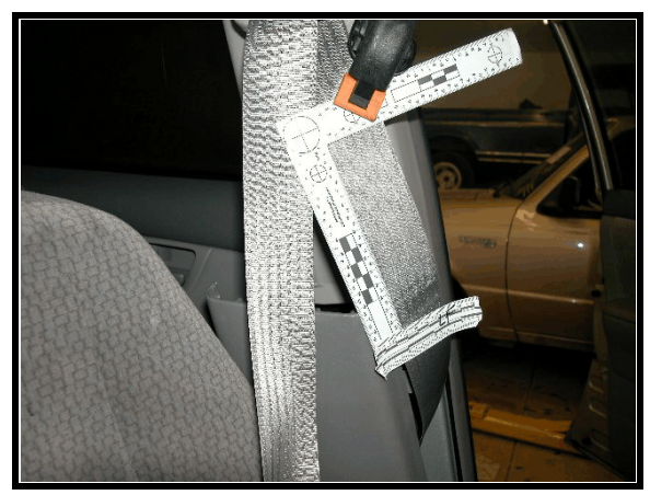
Figure 12. Load marks to driver's seat belt