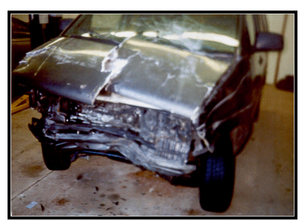
Figure 23. Front left, Ford Aerostar