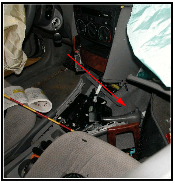
Figure 26. Contact to shifter and center console

and hip. Her face engaged the deployed air