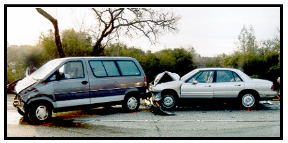
Figure 6 . Final rest positions for Buick LeSabre and Ford Aerostar