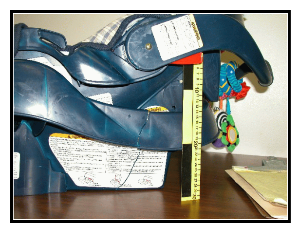
Figure 21. Left side of seat (nearest impact). Seat attached to base.