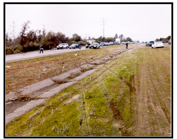
Figure 2 . Road departure path of travel (Corolla), westbound