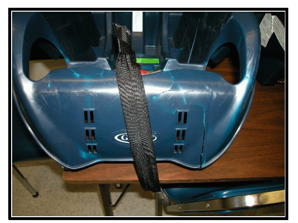
Figure 20. Fractures to front of child seat base.