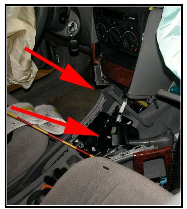
Figure 9. Center console driver contacts

loading damage to center console and center mounted shifter from contact with the driver.