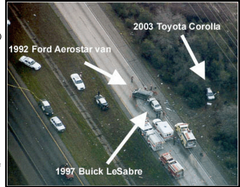
Figure 4. Aerial view of crash scene, North is to the left of photo

The driver indicated that he was traveling approximately 89 km/h (55 mph). At some point he recalled that he needed to call someone. He looked over to the right front passenger's seat and grabbed his cell phone. When he looked up he saw that he had drifted into the adjacent lane 0.6-0.9 m (2-3 ft). He swerved back to the right and heard tires squealing beside him.