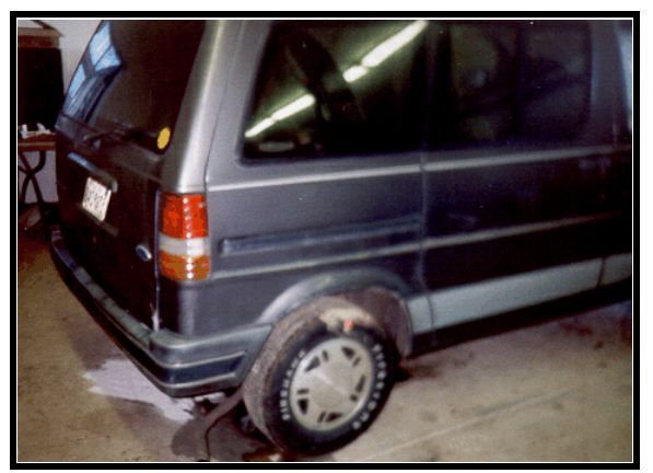
Figure 22. Right rear, Ford Aerostar