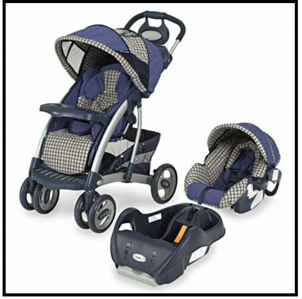
7411LV.

The investigating officer had been trained as a Child Passenger Safety Technician. It was his opinion that the seat usage and installation met applicable state motor vehicle laws. He did note the following issues: