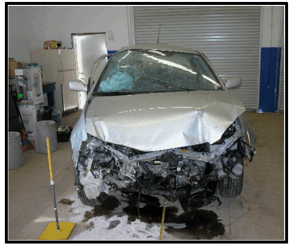
Figure 8. Front, Toyota Corolla

Interior damage to the Toyota Corolla was significant and was attributed to occupant contact and passenger compartment intrusion. The windshield sustained fracture damage from impact forces and the front right passenger's air bag. The back light and all the glass on the right side was disintegrated by impact forces. There was extensive right side intrusion, including intrusion through both right side doors, the sill, and the B/C pillars. The maximum intrusion was the sill into the right rear seating position and measured 39.0 cm (15.3 in) laterally. The rear right door intruded 32.0 cm (12.6 in) laterally into this same area. There was loading damage to the right rear door arm rest from contact with the child seat in this location. There was