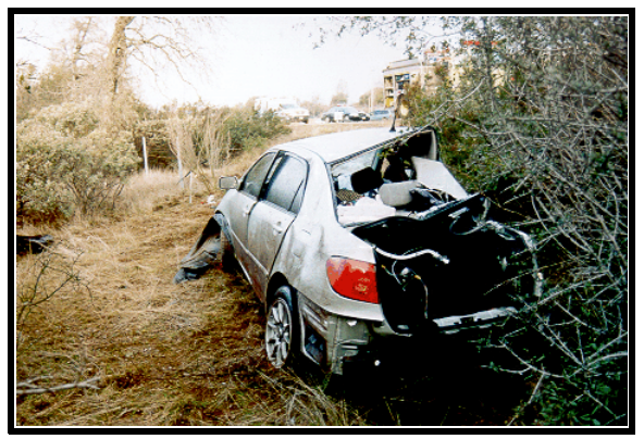
Figure 5. Final rest, Toyota Corolla

All the vehicles were towed from the scene.