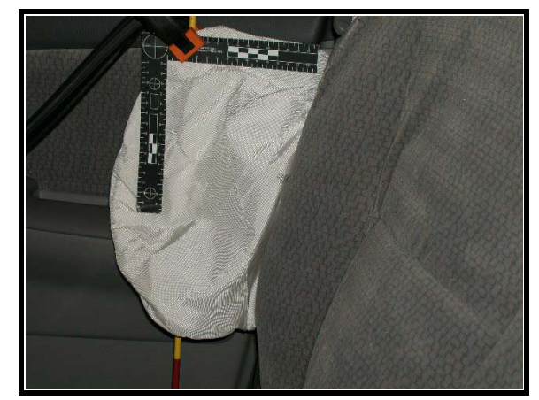
Figure 15. Front right side air bag

The Toyota Corolla was equipped with seat back mounted side air bags for the front seating positions. The front right passenger's side air bag deployed as a result of the impact with the Ford Aerostar van. This air bag was shaped in a halfcircle that measured 31.0 cm (12.2 in) in height and projected forward 21.0 cm (8.3 in) at the apex of the circle. The air bag was not tethered and did not have any vents. There were no indications of damage or occupant contacts to the air bag.