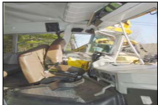
Figure 11. Lateral view of the driver's seat position and longitudinal intrusion

Interior damage to the 2002 TC2000 school bus was severe and was a result of occupant contact and passenger compartment intrusion. The left instrument panel, center instrument panel, windshield header, toe pan and floor pan intruded longitudinally and vertically into the forward aspect of the passenger compartment (Figure 11). The vertical intrusion of the windshield