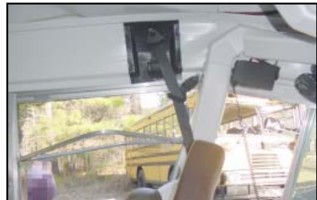
Figure 15. Driver's retractor, D-ring, and shoulder belt in the 2002

The 2002 TC2000 school bus was configured with a manual 3-point lap and shoulder belt for the driver's position. The buckle stalk was attached to an L-shaped bracket that was mounted longitudinally on the on the inboard aspect of the seat base. There was no visible damage to the buckle or buckle stalk in the available photographs. The retractor was located along the left roof side rail approximately 20 cm (8") aft of the left B-pillar ( Figure 15 ). The retractor was fixed to a metal plate, which was attached to the roof side rail, and a fixed plastic-covered D-ring was located approximately 10 cm (4") above the retractor. A second D-ring was present on the lower aspect of the roof side rail, and utilized as a guide for the shoulder belt webbing. The secondary D-ring was attached to a short section of webbing that was fixed to the aft edge of the left B-pillar at the roof side rail, and was located below the retractor. A section of the shoulder belt webbing that was visible in one of the photographs appeared to be corrugated as a result of occupant loading. The lap belt anchor and latch plate were not visible in any of the available photographs.