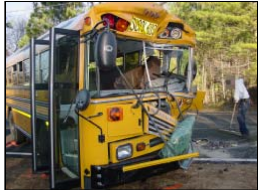
Figure 9. Frontal view of the damaged 2002 school bus