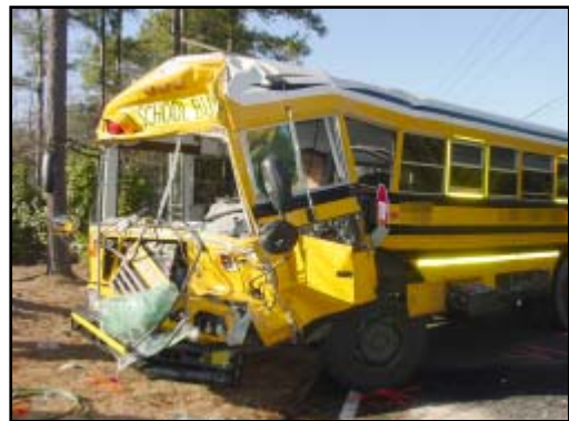
Figure 10. Left front view of the damaged 2002 school bus