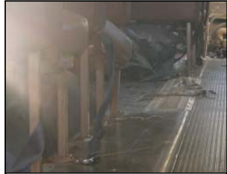
Figure 14. Close up of the lap belt in the fifth row left seat

The school bus passenger seats were configured with fixed-length manual lap belts with locking latch plates for each seating position. Although the police report indicated that the bus monitor, 9-year-old, and 10-year-old were restrained, the specific seating positions were unknown, and images of specific lap belts were unavailable. The lap belt webbing on the outboard aspect of the left side fifth row bench seat appeared cupped and corrugated ( Figure 14 ). The deformation to the safety belt webbing combined with the displacement of the seat cushion suggested probable occupancy of the seat. However, a specific occupant could not be linked to the seat position at the time of this PCS.