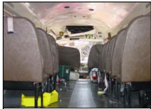
Figure 12. Interior view from the rear of the 2002 school bus

The entire instrument panel was displaced and fractured from crash forces. The driver's lower instrument panel was deformed and fractured on each side of the steering column from contact with the driver's knees. Pocketing was present on the inboard aspect of the left lower instrument panel consistent with a right knee contact. Body fluid (blood) was also present on the driver's instrument panel. The rear (bottom) aspect of the steering wheel rim was cut by rescue personnel to facilitate the extrication of the driver. The steering column was also deflected forward, possibly as a result of extrication. The longitudinal intrusion caused the upward buckling of the floor under the driver's seat. The seat was displaced upward and deflected to the left approximately 20 degrees. The floor buckling also resulted in rearward deflection of the driver's seat into the padded partition located behind it. The engine shroud was displaced as a result of the frontal intrusion and floor buckling. The floor was also slightly buckled in the area of the D-pillars. The driver's sun visor was fractured and deformed as a result of crash forces and intrusion. There did not appear to be any occupant contact to the visor. The rear view mirror located on the forward wall above the windshield was fractured from crash forces.