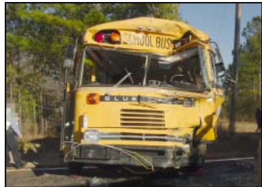
Figure 4. Frontal view of the damaged 1989 school bus

The damage to the 1989 Blue Bird TC2000 school bus was based on photographs obtained from the school district. The 1989 TC2000 bus sustained severe frontal damage as a result of the collision with the 2002 TC2000 school bus ( Figures 4 and 5 ). The direct contact damage began approximately 30 cm (12”) left of the centerline and extended laterally to the front left corner. Due to the identical nature of the bus models, the direct contact involved the entire vertical height of the front of the bus. The left aspect of the steel front bumper was deflected rearward and abraded.