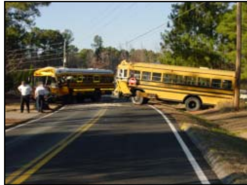
Figure 1. On-scene view of the buses at final rest

This remote investigation focused on the performance of the passenger compartments and integrity of the body panels on two Type D school buses that were involved in a head-on crash ( Figure 1 ). The crash involved two full-size Blue Bird TC2000 school buses; one was a 1989 and the other a 2002. Both buses were configured to transport children with disabilities. The 1989 bus was occupied by a 54-year-old female driver, a 66-year-old male bus monitor, a 10-year-old male child, and a 9-year-old male child. The seating positions of the passengers were not known. The 2002 bus was occupied by a 63-year-old male driver and a 68-year-old female bus monitor.