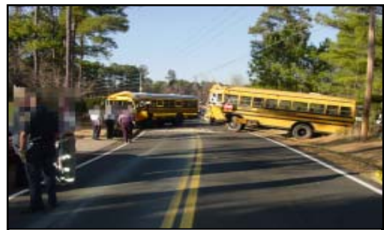
Figure 2. Northbound approach for the 1989 school bus

The 54-year-old female driver of the 1989 Blue Bird TC2000 school bus was operating the vehicle in a northbound direction on the two-lane roadway ( Figure 2 ). The 66-year-old male driver of the 2002 Blue Bird TC2000 school bus was operating the vehicle southbound on the same roadway. The pre-crash speeds of the buses were unknown. Both buses were on approach to the curve, a left curve for the 1989 bus and a right curve for the 2002 bus. As the 2002 bus attempted to negotiate the right curve, the bus traveled across the centerline into the opposing northbound lane.