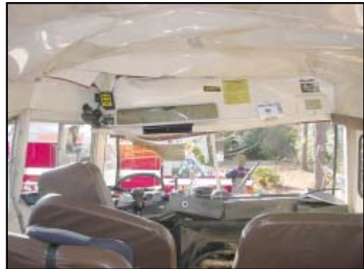
Figure 6. Interior view looking forward from the second row

Interior damage to the 1989 TC2000 school bus was severe and was a result of occupant contact and passenger compartment intrusion. The left instrument panel, center instrument panel, toe pan, and windshield header intruded longitudinally and vertically into the forward aspect of the passenger compartment. The longitudinal intrusion of the windshield header resulted in the buckling and separation of the interior roof sheet metal at the top left aspect of the windshield header and leading edge of the roof on the left aspect.