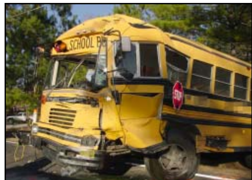
Figure 5. Left front view of the damaged 1989 school bus

The front left corner sustained abrasions and deformation above the bumper. The lower front panel that housed the headlights was displaced and crushed on the left aspect. The windshield was fractured and out-of-place in the on-scene photographs. The maximum crush at the front left bumper corner was approximately 45 cm (18”), based on the on-scene photographs. The maximum crush along the windshield header was located approximately 30 cm (12”) to the left of the centerline and was estimated to be approximately 30 cm (12”). The combined direct and induced damage involved the entire frontal width of the bus. Vertical body panel separation occurred along the front left corner due to the longitudinal crush. The left front side access door beneath the left A- and B-pillars sustained longitudinal and outward buckling on the top aspect. The access door and side panel under the access door were displaced outward and rearward as a result of induced damage, although, there was no apparent left side body panel separation. The highest degree of lateral deflection occurred at the beltline at the left B-pillar and