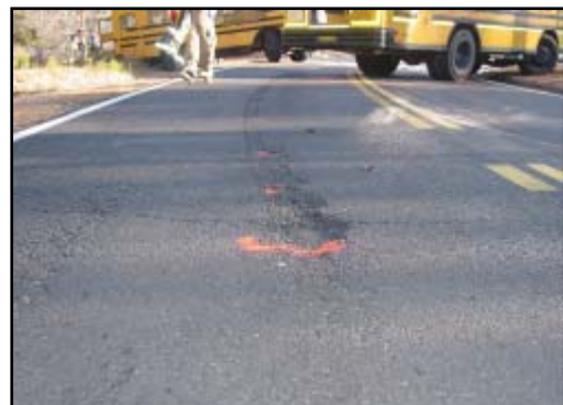
Figure 3. View of the left front tire mark from the 2002 school bus

The driver of the 2002 bus applied the brakes and steered right in an attempt to avoid the collision when he detected the oncoming 1989 bus in the same lane. Police reported a tire mark from the left front wheel of the 2002 bus that measured 12.5 m (41.0') in length to the deflection at the point of impact ( Figure 3 ). The driver of the 1989 bus did not attempt any avoidance maneuvers.