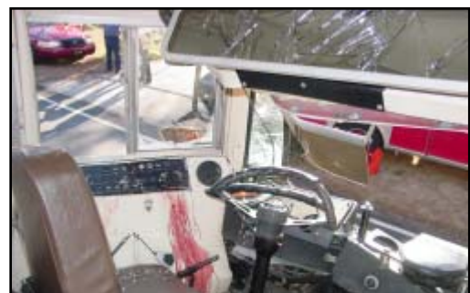
Figure 7. View of driver's seat position and driver contacts

The driver's seat was deflected forward and approximately 20 degrees to the left. The steering column was deflected forward and the rear half of the horizontally oriented steering wheel rim was deflected upward (forward) approximately 90 degrees, although, rescue personnel may have further deformed the steering wheel and rim to extricate the driver. The driver's plastic sun visor was extended downward and fractured as a result of