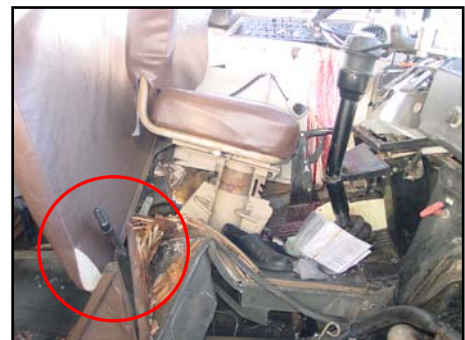
Figure 13. Driver's buckle and stalk (highlighted) in the 1989 bus

The 1989 TC2000 school bus was configured with a manual 2-point lap belt for the driver's position. The configuration of the lap belt was unknown, as the webbing and latch plate were not visible in any of the available photographs. The buckle stalk appeared to be mounted on